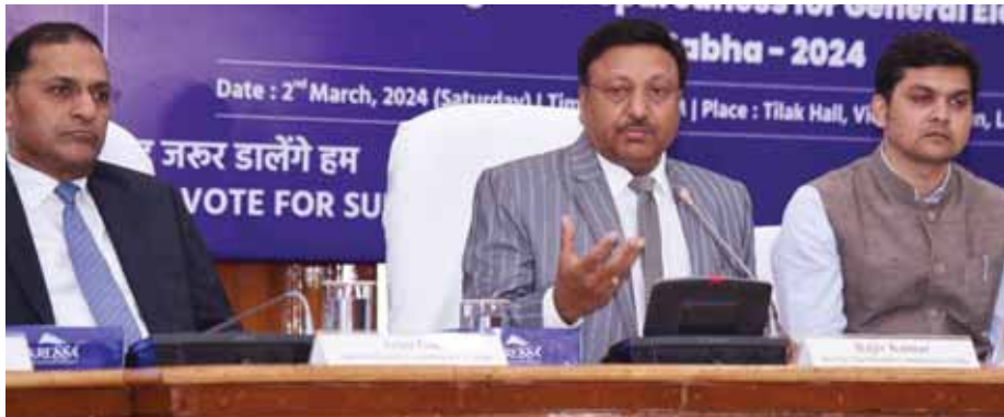
Chief Election Commissioner Rajiv Kumar addressing mediapersons in Lucknow on Saturday