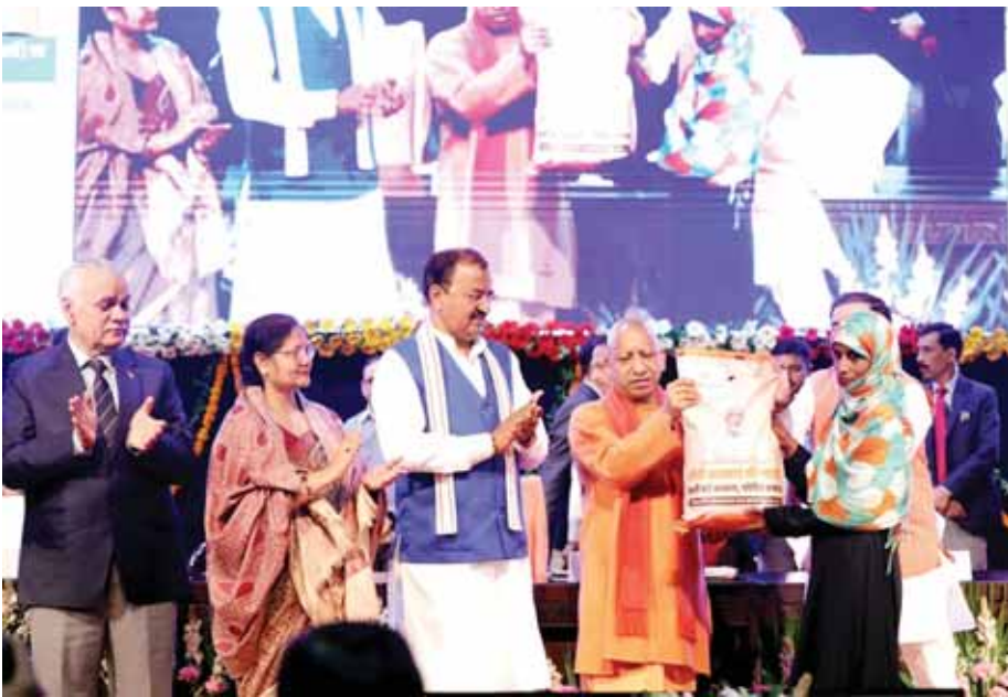
Chief Minister Yogi Adityanath providing ration kits to a beneficiary

affordable generic medicines and other essential household items," he said. "Additionally, there will be a common service centre where services like birth certificates, death certificates, income certificates and caste certificates