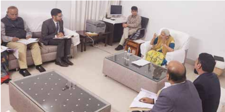
Governor Anandiben Patel talking to officials at Circuit House in Varanasi on Friday evening