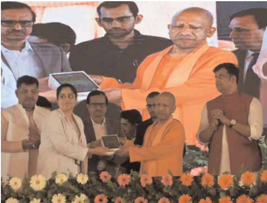
Chief Minister Yogi Adityanath giving smartphones and tablets to students during a programme at Rajkiya Jubilee Inter College grounds in Gorakhpur on Sunday

"In alignment with his vision, Uttar Pradesh has already distributed smartphones and tablets to 20 lakh