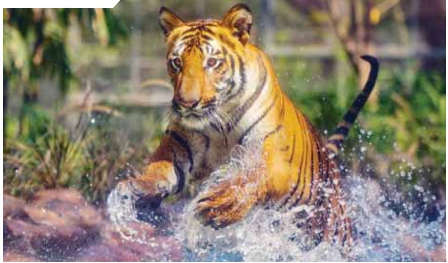
A Royal Bengal Tiger at the Byculla zoo on the World Wildlife Day, in Mumbai