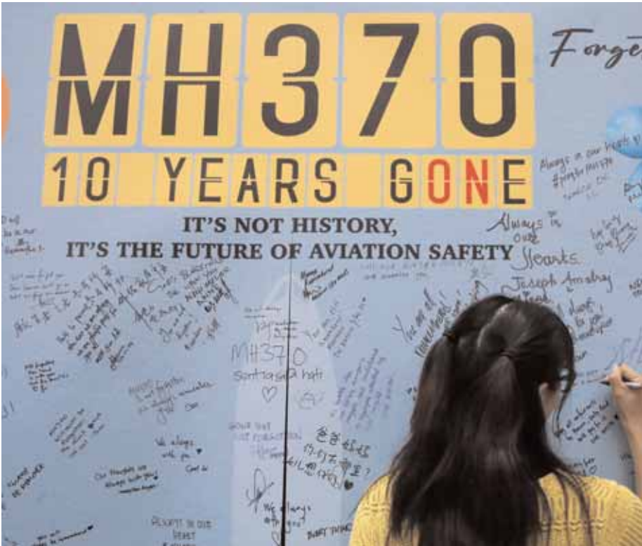
A woman writes well messages on the message board during the tenth annual remembrance event at a shopping mall, in Subang Jaya, on the outskirts of Kuala Lumpur, Malaysia, Sunday. Ten years ago, a Malaysia Airlines Flight 370, had disappeared March 8, 2014 while en route from Kuala Lumpur to Beijing with over 200 people on board.

While federal authorities offer security details to national candidates, those running for local offices — the ones that drug cartels really want to control — are completely exposed and acutely aware of the optics of running from within a security bubble.