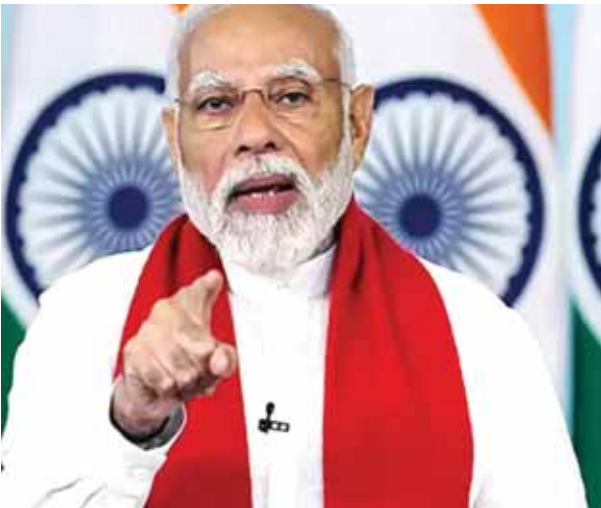
“No matter in which department you are appointed, in which city or village you are, you should

“Your determination and decisions taken in the interest of the country will strengthen the development of the nation, and this responsibility will also bring new opportunities and challenges for you,” Modi said.