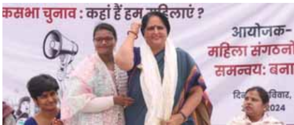
A women's conference being held at Shastri Ghat in Varanasi on Sunday.

A Mahila Adhikar Sammelan (Women's Rights Conference) was organised at Shastri Ghat near district headquarters here on Sunday in which many women's organisations, student wings and civil society groups of the city took part. They said that they joined hands for 'equality, respect, security and employment'. They appealed to the government and all political parties that the upcoming Lok Sabha elections should be fought on the issues of food, clothing, shelter and education. They said that the political fight should be on real issues like health, safety and