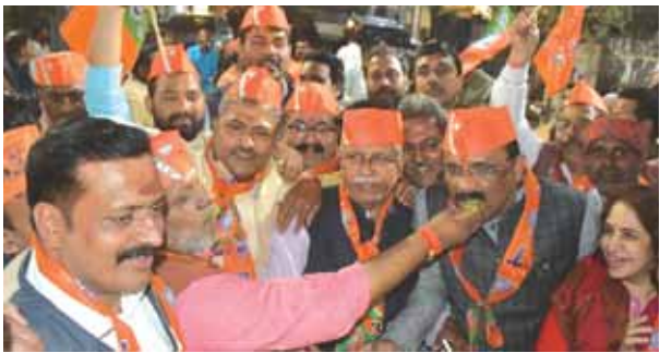
BJP workers in Varanasi taking part in the celebrations on Saturday