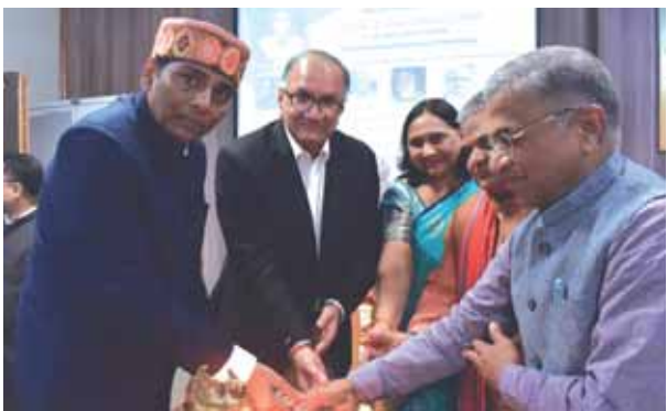
Deputy Chairperson of Rajya Sabha Harivansh inaugurating a lecture at BHU in Varanasi on Saturday.

Deputy Chairperson of Rajya Sabha Harivansh said that India had a very rich economic system and a prosperous past but during 2011-12, India faced a severe economic crisis with declining foreign reserve. "However, now in new India under the revolutionary leadership of Prime Minister Narendra Modi, the country is positively looking forward to become a superpower India with the vision - Vikshit Bharat@ 2047," he said while speaking as the chief guest at Prof RA Singh Memorial Lecture organised by Faculty of Commerce, in Banaras Hindu University (BHU) at Thakur Ratan Pal