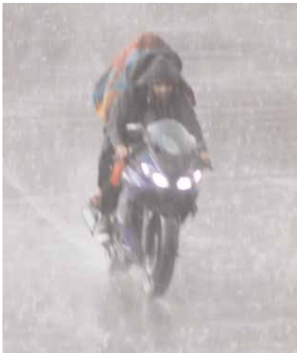
A biker braving a strong hailstorm in city on Sunday. (Right) A car precariously hangs on to a caved-in road in Vikas Nagar