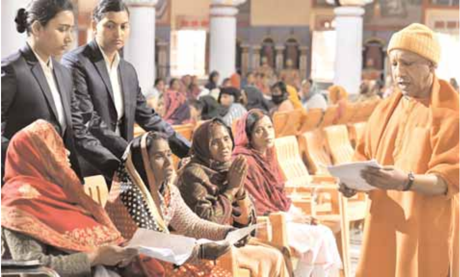
Chief Minister Yogi Adityanath on Sunday directed officials to ensure that all eligible individuals, who have not received permanent houses, are provided the same under the Pradhan Mantri Awas Yojana or the Mukhyamantri Awas Yojana. No poor person should be left homeless, he stated. The chief minister issued the instructions while listening to the housing problem of a woman at the Janata Darshan held in the auditorium of Mahant Digvijaynath Smriti Bhawan in the Gorakhnath temple complex.

Chief Minister Yogi assured the people that the veterinary science college being built at Tal Nador would be transformed into a university in the future, making Gorakhpur home to five universities. He mentioned that the college will not only focus on animal healthcare but also undertake breed improvements. "Fisheries related programmes will also be taken forward here. The college