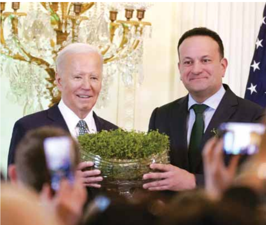
Ireland's Prime Minister Leo Varadkar, right, presents President Joe Biden with a bowl of Shamrocks during a St. Patrick's Day reception in the East Room of the White House, Sunday.