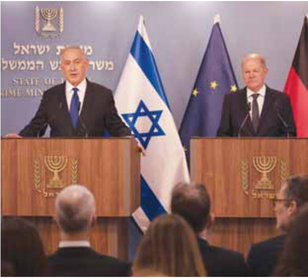
Israeli Prime Minister Benjamin Netanyahu, left, delivers his speech after a meeting with German Chancellor Olaf Scholz in Jerusalem, Sunday.