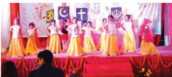
Children participating in a programme at a school in Gudamba on Monday