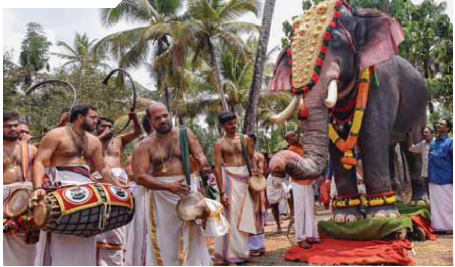
A realistic mechanical elephant, gifted to Thrikkayil Mahadeva temple by PETA India, in Kochi