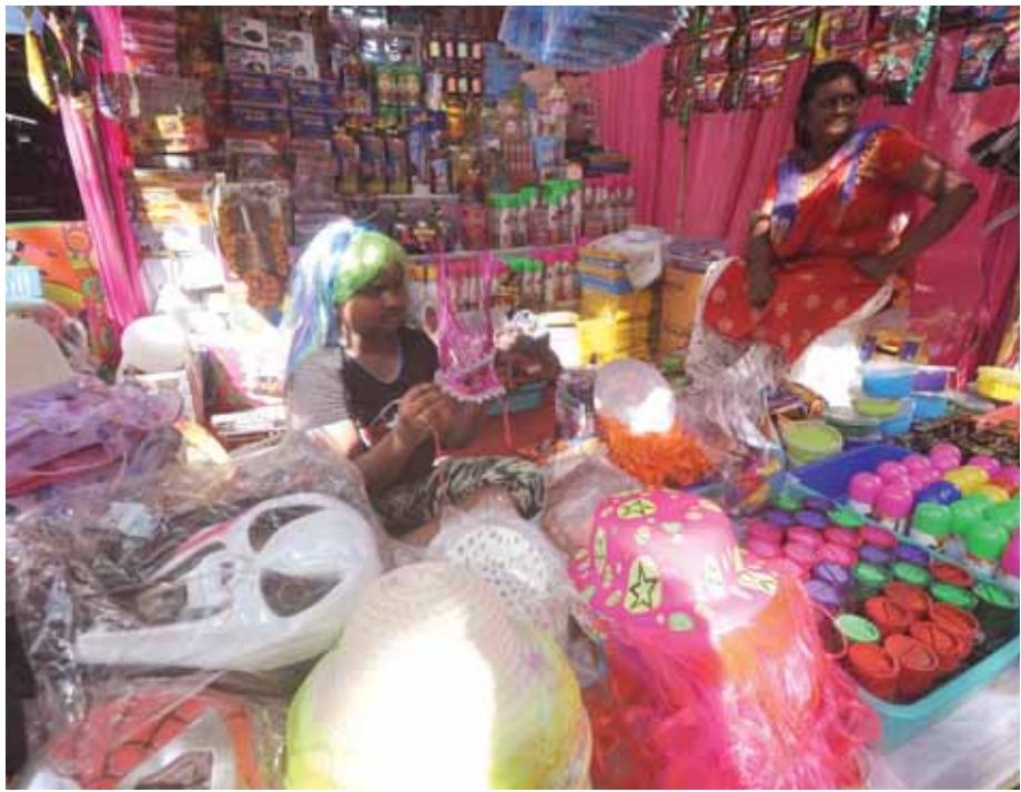
A makeshift shop selling sprinklers and colours in Lucknow on Monday