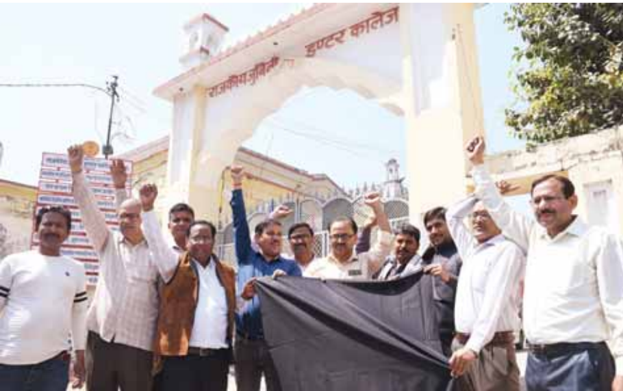
Members of Rajkiya Shikshak Sangh, UP staging protest against the killing of a teacher by a policeman in Muzaffarnagar, at Government Jubilee Inter College in Lucknow on Monday