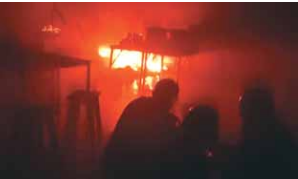
A fire broke out in a leather shoe factory in Dada Nagar late on Tuesday night.