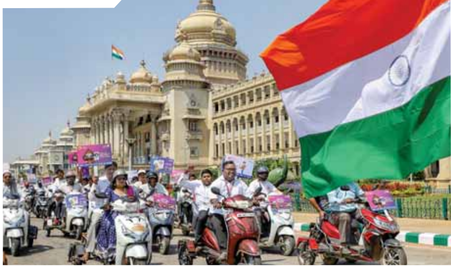
People with disabilities take part in a voter awareness campaign rally, in Bengaluru