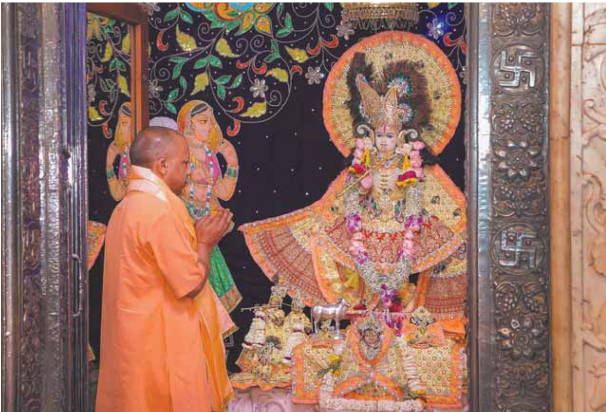
Uttar Pradesh Chief Minister and BJP leader Yogi Adityanath offers prayers at Sri Krishna Janamsthan temple in Mathura on Wednesday as Adityanath commences his poll campaign for the upcoming Lok Sabha elections from Mathura on Wednesday.

of COVID-19, guided by the leadership of Prime Minister Modi, he pointed out. Chief Minister Yogi emphasised the transformative changes witnessed over the past decade, portraying a dynamic shift towards a new India, with fortified border security alongside significant infrastructural advancements under Prime Minister Modi's leadership. Developments span highways, railways, airports, medical colleges, universities, and various new institutions, while benefits of welfare schemes have reached the underprivileged without any discrimination, he added. "Prior to 2014, schemes were often tailored, based on considerations for caste and religion as part of vote bank politics. However, post-2014, adherence to the principle of "Sabka Saath, Sabka Vikas" ensures equal distribution of benefits among people without bias. Every stratum of society – be it the impoverished, entrepreneurs, women, youth or farmers – reaps the rewards, receiving security subsidies universally," he remarked. He added: "Prime Minister Modi's approach pivots on citizen satisfaction, prioritising inclusivity over appeasement. The blueprint for the new India encompasses job creation for youth, reverence for faith, and preservation of heritage, while fostering a connection between ordinary citizens and development endeavours.