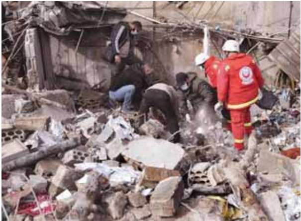
Paramedic workers search for victims in the rubble of a paramedic center that was destroyed by an Israeli airstrike early Wednesday in Hebbariye village, south Lebanon on Wednesday.

An Israeli airstrike on a paramedics centre linked to a Lebanese Sunni Muslim group in south Lebanon killed seven of its members early on Wednesday and triggered a rocket attack from Lebanon that killed one person in northern Israel, officials said. The strike on the village of Hebbariye came after a day of airstrikes and rocket attacks between Israel's military and Lebanon's Hezbollah group along the Lebanon-Israel border, raising concerns of further escalation along the frontier that has been active for the past five months of the Israel-Hamas war. The airstrike after midnight on Tuesday hit an office of the Islamic Emergency and Relief Corps, according to the Lebanese Ambulance Association. It was one of the deadliest single attacks since violence erupted along the border. The paramedics association list-