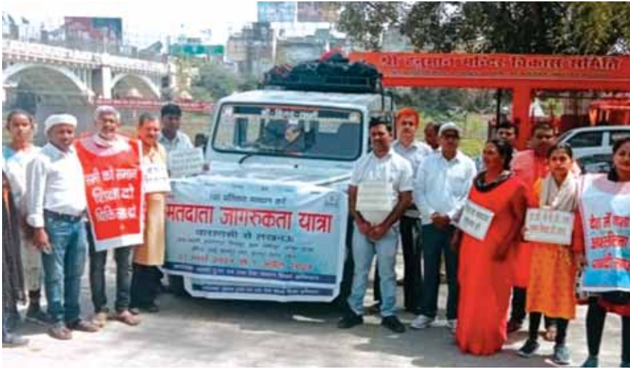
‘Vahan Yatra’ being taken out for voter awareness in Varanasi on Wednesday.