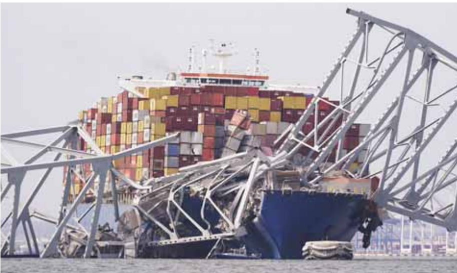
A Coast Guard cutter passes a cargo ship that is stuck under the part of the structure of the Francis Scott Key Bridge after the ship hit the bridge Tuesday in Baltimore.