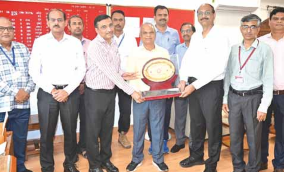
The Rajbhasha department officials presenting shield to the GM at BLW in Varanasi on Wednesday.