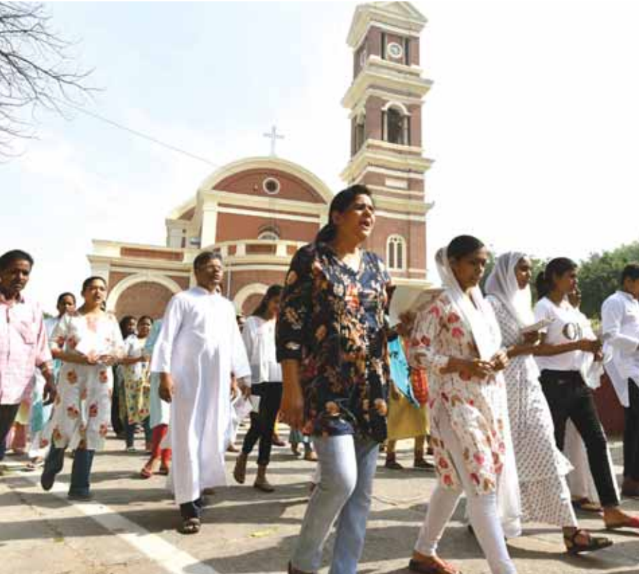
Christian devotees taking part in a religious procession on the occasion of Good Friday at St Joseph’s Cathedral Church in Prayagraj on Friday.

Due to the development of the Kashi Vishwanath Corridor and good connectivity of Varanasi with the country and the world, the number of tourists here is continuously increasing. There was a record increase in visitors since the inauguration apart from rise in the number of visiting tourists in Kashi and other business groups.