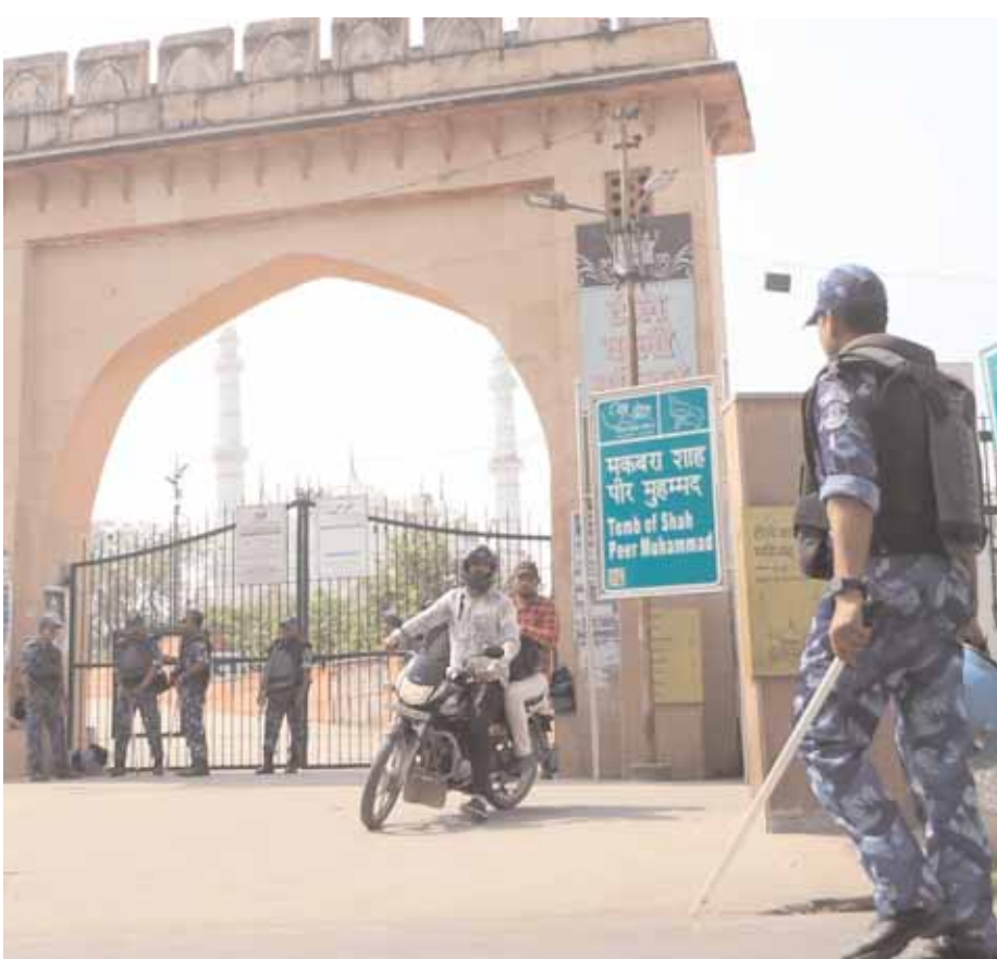
Security personnel stand guard outside Teele Wali Masjid in Lucknow in view of Friday prayers