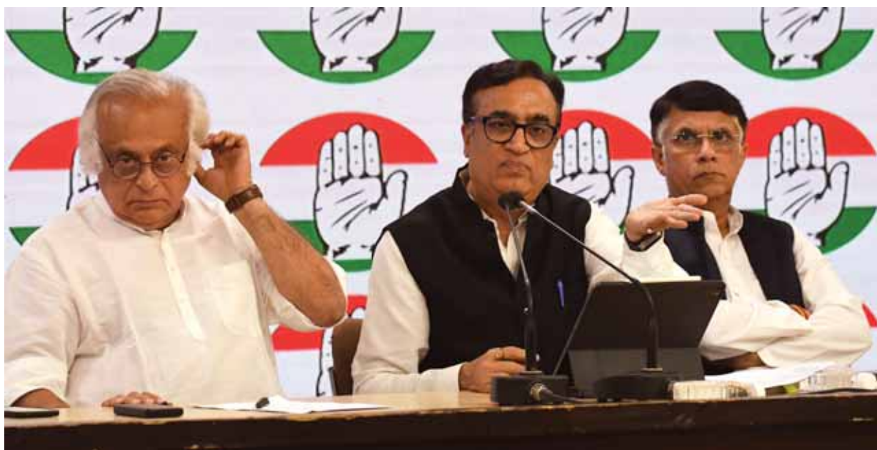
Congress leaders Jairam Ramesh, Ajay Maken and Pawan Khera during a Press conference in New Delhi on Friday