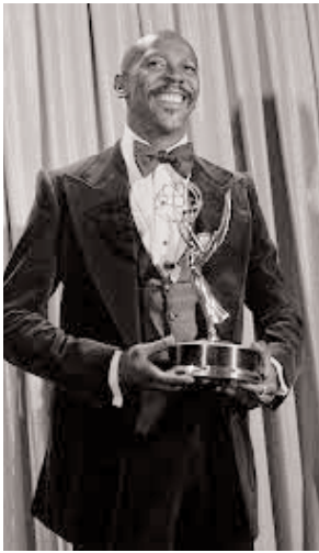
2010 memoir "An Actor and a Gentleman." His English teacher urged him to go into Manhattan to try out for "Take a Giant Step." He got the part and made his Broadway debut in 1953 at age 16. "I knew too

Louis Gossett Jr., the first Black man to win a supporting actor Oscar and an Emmy winner for his role in the seminal TV miniseries "Roots," has died. He was 87. Gossett's nephew told The Associated Press that the actor died Thursday night in Santa Monica, California. No cause of death was revealed. Gossett always thought of his early career as a reverse Cinderella story, with success finding him from an early age and propelling him forward, toward his Academy Award for "An Officer and a Gentleman." He earned his first acting credit in his Brooklyn high school's production of "You Can't Take It with You" while he was sidelined from the basketball team with an injury. "I was hooked — and so was my audience," he wrote in his