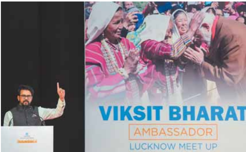
Union Minister for Information and Broadcasting, Youth Affairs and Sports Anurag Thakur speaks during a Viksit Bharat ambassador programme, in Lucknow on Friday

security measures as part of these efforts. Thousands of devotees are expected to converge on Ayodhya from across the nation for pilgrimage, prayers and ceremonial baths in the holy Saryu during Chaitra Shukla Navami, also known as Ram Navami. This marks the first Ram Navami following the consecration of Ram Lalla in his new temple. With such a significant event, Ayodhya is bracing for potentially massive crowds. As numerous individuals seek spiritual rejuvenation through participation, stringent security measures have been implemented to mitigate potential risks. The fleet of fiber motor boats patrolling the river has been bolstered in light of this. Four boats were deployed initially during the Pran Pratishtha ceremony on January 22 this year, and now, in anticipation of increased footfall, an additional six fiber motor boats have been enlisted.