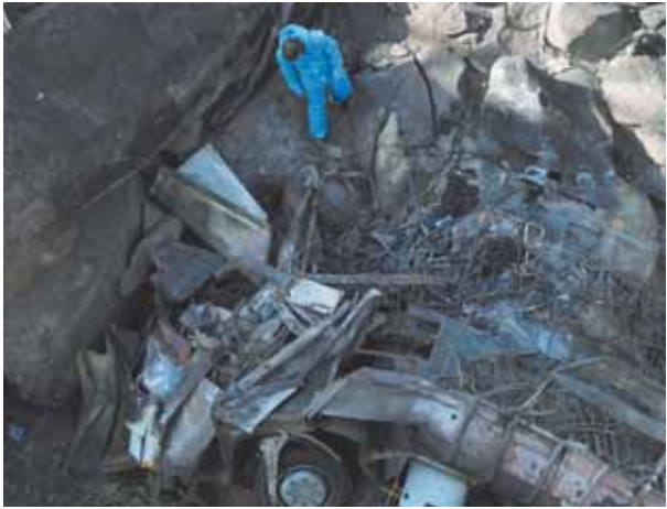
The wreckage of a bus lies in a ravine a day after it plunged off a bridge on the Mmamatlakala mountain pass between Mokopane and Marken, around 300km (190 miles) north of Johannesburg, South Africa on Friday.

Emergency workers in South Africa were searching Friday for the bodies of victims after a bus carrying pilgrims to an Easter gathering plunged off a bridge and caught fire. An 8-year-old child was the only survivor of the crash that killed at least 45. Hours after the Thursday afternoon crash, smoke seeped from the mangled, burned wreck underneath the concrete bridge. Authorities said it appeared that the driver lost control and the bus ploughed into the barriers along the side of the bridge and then over the edge. The driver was among the dead. The crash happened in a mountainous region near the town of Mokopane, which is about 200 kilometres (125 miles) north of the South African capital, Pretoria. The Limpopo provincial government said the bus, which was carrying pilgrims from Botswana, veered off the Mmamatlakala bridge and