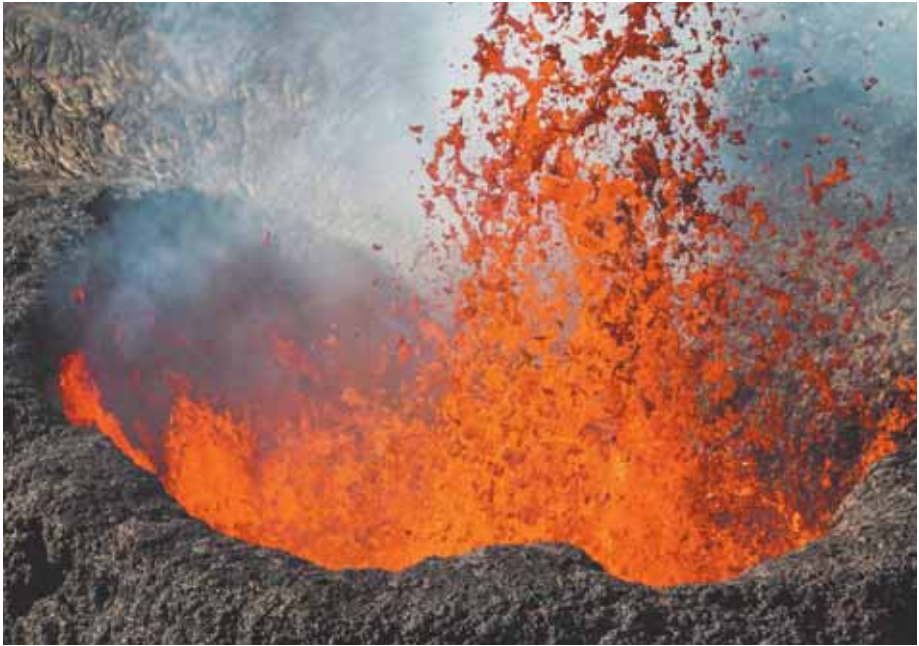
Lava erupt near the town of Grindavik, Iceland on Thursday.

cers, who had him lean against the car and made him open the trunk while they called the car rental agency before letting him go. "Though I understood that I had no choice but to put up with this abuse, it was a terrible way to be treated, a humiliating way to feel," Gossett wrote in his memoir. "I realized this was happening because I was Black and had been showing off with a fancy car — which, in their view, I had no right to be driving." After dinner at the hotel, he went for a walk and was stopped a block away by a police officer, who told him he broke a law prohibiting walking around residential Beverly Hills after 9 p.m. Two other officers arrived and Gossett said he was chained to a tree and handcuffed for three hours. He was eventually freed when the original police car returned.