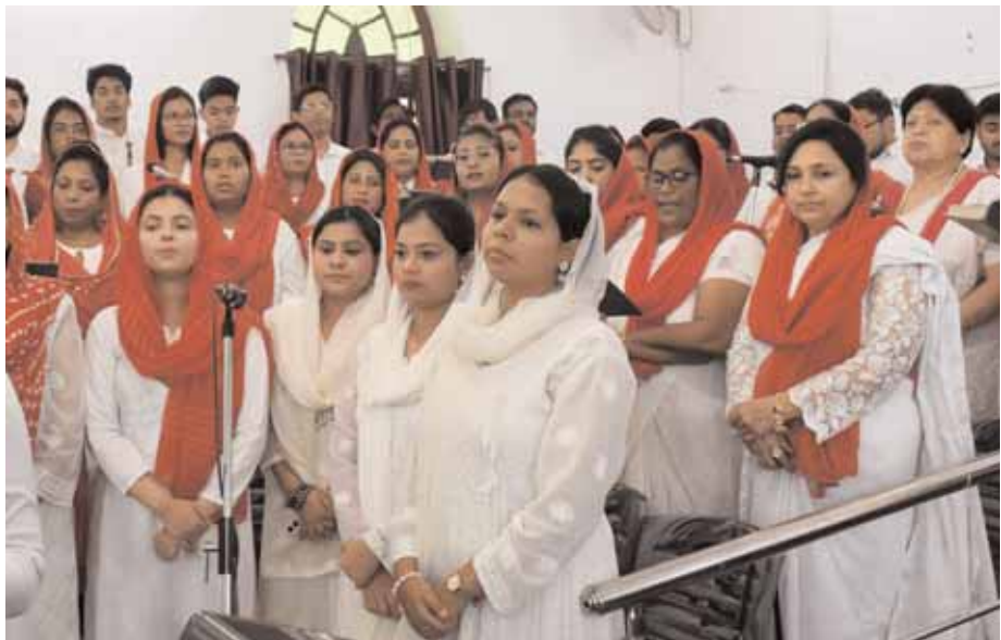
(Top) Members of the Christian community taking part in the 'Way of the Cross' at St Joseph Cathedral in Hazratganj, and (above) a prayer service at Central Methodist Church on the occasion of Good Friday