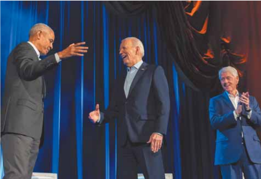
President Joe Biden, center, and former presidents Barack Obama and Bill Clinton participate in a fundraising event with Stephen Colbert at Radio City Music Hall, Thursday in New York.

most money to seize the presidency. During the nearly hourlong conversation, Obama and Clinton explained just how hard Biden's job is. They spoke of loneliness and frustration over policies that work but aren't immediately felt by the public. They gave an insider's view of the office as they sought to explain why Biden was best for the job. "It is a lonely seat," said Obama, who had hitched a ride to New York on Air Force One with Biden. The talk was by turns humorous and serious, ending with all three donning sunglasses in the mostly dark music hall, a nod to the trademark Ray-Ban sunglasses that Biden often wears. The sold-out Radio City Music Hall event was a gilded exclamation mark on a recent burst of campaign travel by Biden, who has visited several political battlegrounds in the three weeks since his State of the Union address served as a rallying cry for his reelection bid. Thursday's event also brought together more than three decades of Democratic leadership. The music hall's marquee advertised the big-dollar night as "An Evening with Joe Biden Barack Obama Bill Clinton." NYPD officers lined surrounding streets as part of a heavy security presence.