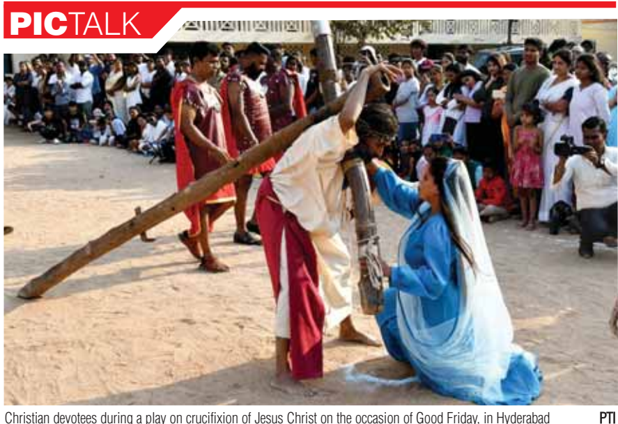
Christian devotees during a play on crucifixion of Jesus Christ on the occasion of Good Friday, in Hyderabad

Despite the offered benefits, concerns have arisen regarding its potential impact on military ethos, professionalism and operational efficiency. Questions linger regarding the maintenance of unit cohesion, the readiness of inexperienced Agniveers for live operational scenarios and the long-term attractiveness of military service. Critics question the scheme's impact on the regimental system of the Indian Infantry and advocate for rigorous testing before full implementation. While some argue for gradual induction to mitigate adverse effects, others emphasise the need for empirical evaluation to safeguard military standards. Broadly speaking, the scheme has not gone down well with the aspiring youth. They feel that most of them would be left without a job in their prime. Moreover, the Gurkhas of Nepal have summarily rejected this scheme and are now looking for options in other countries. This seriously jeopardises India's defence muscle. It has been almost four years since the scheme was launched, and it is the first time the Government has shown its openness to make amendments. The Congress has already termed it an election gimmick. Whatever the reasons, it would be good if the Govt returns to the drawing board and reconsiders the various issues in national interest.