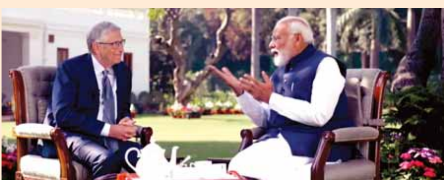
Prime Minister Narendra Modi with Microsoft co-founder Bill Gates during a meeting at his residence in New Delhi on Friday

"frontal organisation". He said the Supreme Court will soon hear the Congress's plea on the I-T department's demands from it. Maken alleged that the "BJP-ruled I-T department" has so far forcibly taken out ₹135 crore from the Congress's bank accounts due to an alleged ₹14 lakh non-compliance demand against the party. "This amount was recovered by freezing more than ₹270 crore of the Congress's bank balance across several accounts," he said. During this period of several weeks, the bank accounts of the Congress were effectively "frozen" in an illegal attempt to paralyse the party's functioning during the Rahul Gandhi-led Bharat Jodo Nyay Yatra, Maken alleged. In the history of India, why is the Congress, a tax-exempt political party like others, being "forced" to pay income tax during the 2024 Lok Sabha election, he asked. "Why have the BJP or its alliance partners not been dealt with similarly? Why has the I-T department not taken cognisance of the Yediyurappa diaries, Jain diaries, Sahara diaries, Birla diaries, Bangaru Lakshman convictions and penalised the BJP?" he asked. The CPI on its part said the Left party is consulting its lawyers to challenge the notice of the tax authorities.