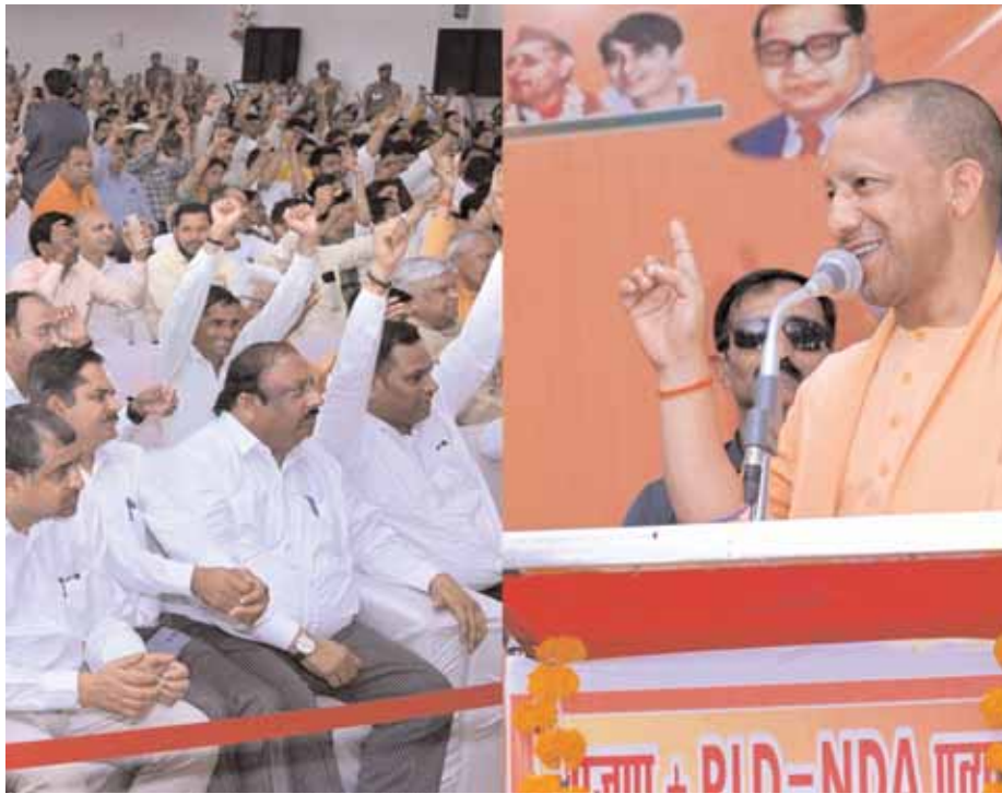
Chief Minister Yogi Adityanath addressing intellectuals at JVS Resort in Bijnor on Friday