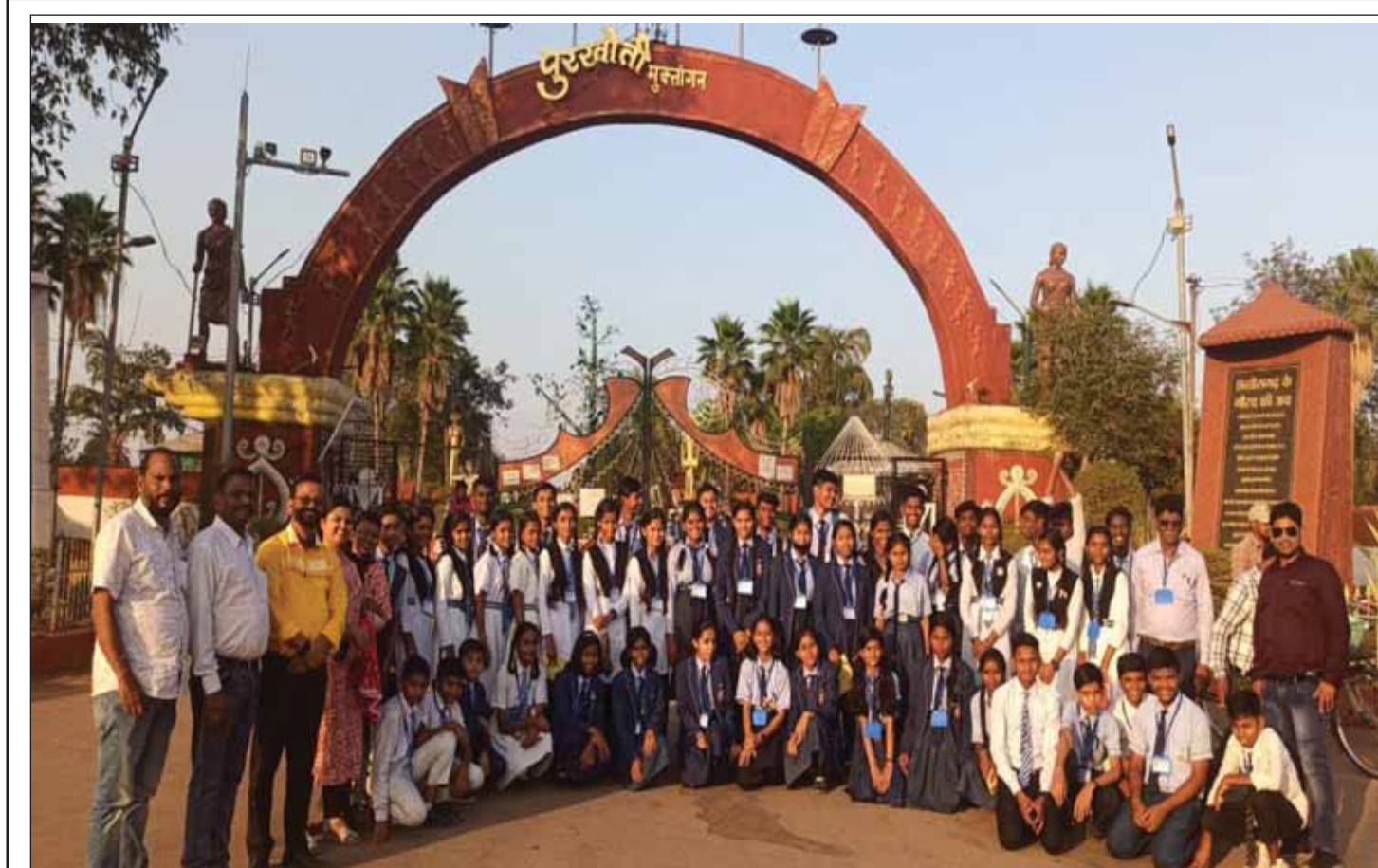
Students of tribal-dominated North Bastar-Kanker district visit Pukhauti Muktangan in capital Raipur under an excursion programme on Saturday.