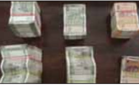
intercepted a car near Mandir Hasaud toll gate and found Rs 18.62 lakhs in cash in it.