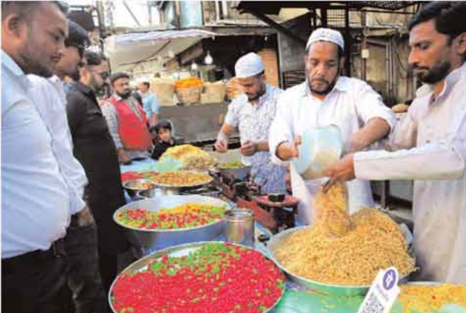
Muslims buy eatables used to break fast during the holy fasting month of Ramadan in Bhopal on Thursday.

approval was given for 23 houses in Kokta Transport Nagar and 2 in Bagmugalia. Permission was granted to select an agency and tender for the work of processing and disposal of solid waste in Adampur Cantonment. The time limit for completing the work of A and B Block near Neelbar Maidan was extended till December 20-24. Approval was given to extend the period of Mahamrityunjaya Go-Seva Sadan Gaushala located in Kokta till August 31.