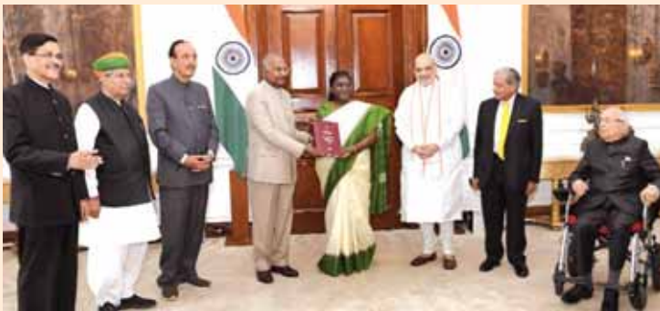
Ram Nath Kovind, chairman of the High-Level Committee (HLC) on 'One Nation, One Election', presents the report to President Droupadi Murmu, in New Delhi, on Thursday. Union Ministers Amit Shah and Arjun Ram Meghwal, DPAP leader Ghulam Nabi Azad are also seen