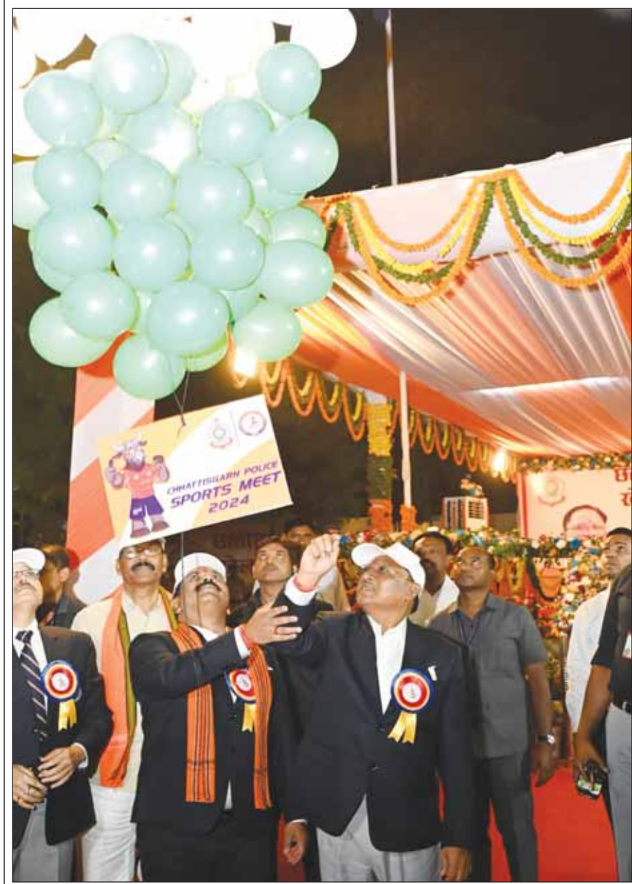
Chhattisgarh Chief Minister Vishnu Deo Sai at the concluding ceremony of the police sports events at the Police Training School (PTS) at Mana on Thursday.

instructions to commence the proposed development works as soon as possible and complete the same within prescribed time limit while adhering to the quality standards. Under the 15th Finance Commission, the Urban Administration and Development Department has sanctioned Rs 1.17 crore for Narayanpur Municipality, Rs 15 lakh for Sargaon Nagar Panchayat, Rs 18 lakh for Kirori Malnagar Nagar Panchayat, Rs 18.98 lakh for Chhura Nagar Panchayat, Rs 53.97 lakh for Simga Nagar Panchayat, Rs 93.35 lakh for Khongapani Nagar Panchayat and Rs 1.63 crore have been sanctioned for Sakti Municipality. Under the 14th Finance Commission, Rs 4.13 lakh has been sanctioned for Sarangarh Municipality.