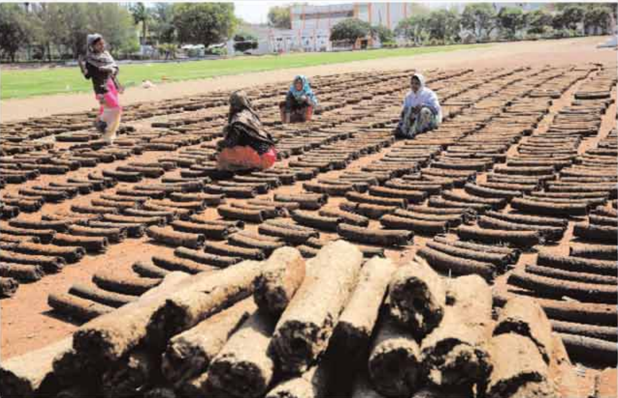
Workers dry cow dung capsules in open fields ahead of the Holika Dahan festival in Bhopal on Thursday.

Bhopal: People protested after 84 shanties were removed from the 100 Quarter Road connecting Khajuri to Piplani in Bhopal. People took to the streets on Thursday to protest against this action. They said that forceful action was taken but people were not given houses. Due to this they are forced to live in the open. The construction work of the road connecting Piplani to Khajuri is under process. For this, about 84 shanties have been removed. Residents are protesting against the removal of slums. They gathered again on Thursday evening and protested against the action. Resident Mrinali Singh Sengar said that examinations of children are going on these days. Meanwhile this action was taken. Due to this children are not able to study. At the same time, people have not even been given houses. The officers said that the people removed during the action would be temporarily shifted to BHEL quarters. However, residents said that many people have not got homes. In such a situation, they have been living in the open. They should be given houses under PM Awas Yojana.