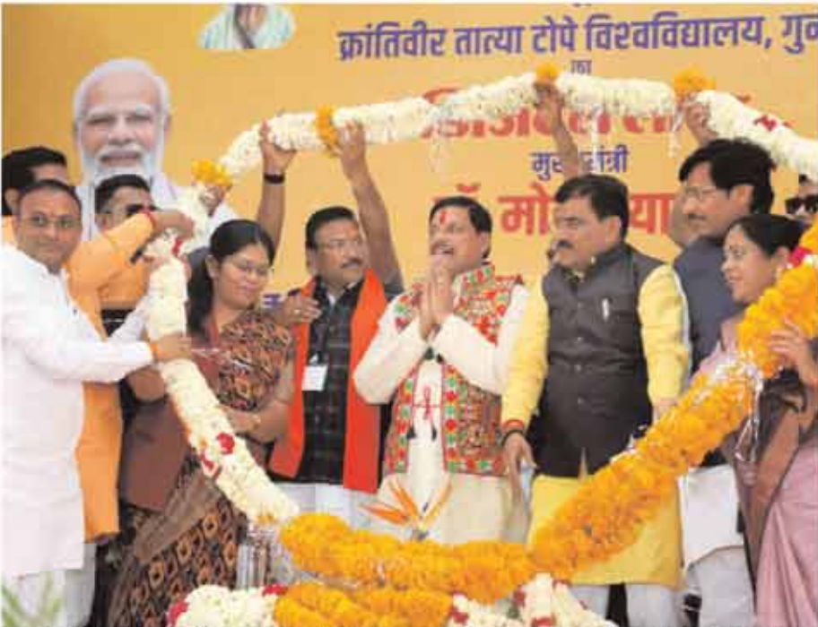
Madhya Pradesh Chief Minister Mohan Yadav during digital launching of Krantsurya Tantiya Bhil Vishwavidyalaya, Khargone and Krantiveer Tantiya Tope Vishwavidyalaya Guna, during a programme in Khargone on Thursday.

Mantri Krishak Mitra Surya Yojana' will be done as per the guidelines issued by the Madhya Pradesh Urja Vikas Yojana under the Kusum 'B' scheme of the Central Government. For the entire ropeway project proposed in Madhya Pradesh, approval was given to authorize the Managing Director, Madhya Pradesh Road Development Corporation on behalf of Madhya Pradesh Government for approval of alignment of the project. Approval was given to authorize the Principal Secretary, M.P. Government, Public Works Department for notifying the Geo coordinates of all ropeway project alignments in the Gazette of the State Government, approving all actions related to land acquisition, signing the Definitive Agreement and appointing NHLML as Promoter for implementing the projects.