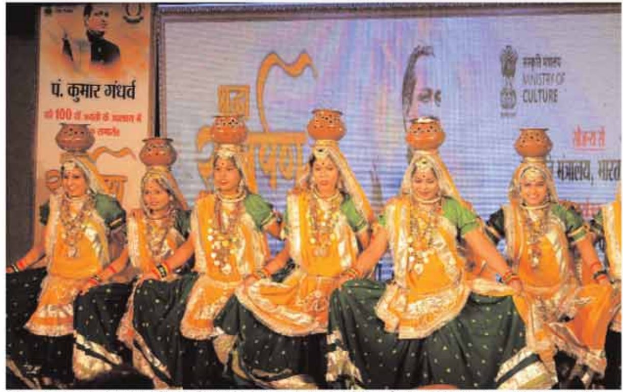
Artists perform in a cultural programme 'Shradha Samarpani' during Indian classical singer Pt Kumar Gandharva birth centenary year celebration organised by Kalinga Bharati Foundation, at Ravindra Bhawan in Bhopal on Sunday.