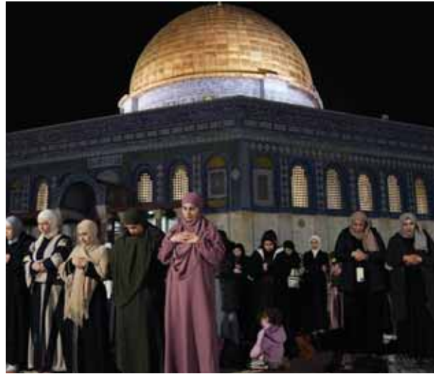
Muslim worshippers perform "tarawih," an extra lengthy prayer held during the Muslim holy month of Ramadan, next to the Dome of Rock at the Al-Aqsa Mosque compound in the Old City of Jerusalem on Saturday.

Israeli Prime Minister Benjamin Netanyahu railed on Sunday against growing criticism from the United States against his leadership amid the devastating war with Hamas, saying the pressure won't stop Israel from achieving "total victory."