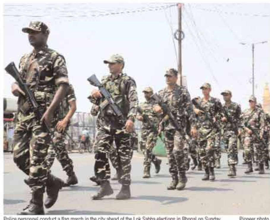
Police personnel conduct a flag march in the city ahead of the Lok Sabha elections in Bhopal on Sunday.

Road 1, Arjun Nagar Tiraha, Arjun Nagar Tiraha, Staff No. 5, Subhash School No. 6. From here, Rachna Nagar via Gautam Nagar, Subhash Nagar, back to Prabhat Square, via Over Bridge, Maida Mill, in front of DB Mall, via Old Jail and ended at Lal Parade Ground. The scope of this march was 35 kilometers. About 70 vehicles including Rudra, Vajra, police station mobile, gypsy, bus took part in the flag march. District Police Force, QRF, SAF personnel were traveling in these vehicles. The main objective of the flag march was to make the common people feel safe from goons, miscreants and anti-social elements while voting. So that citizens can vote fearlessly and impartially.