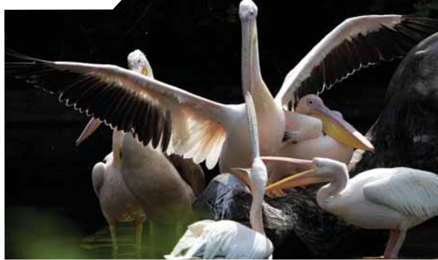
Rosy Pelicans on the banks of a pond at the National Zoological Park, in New Delhi