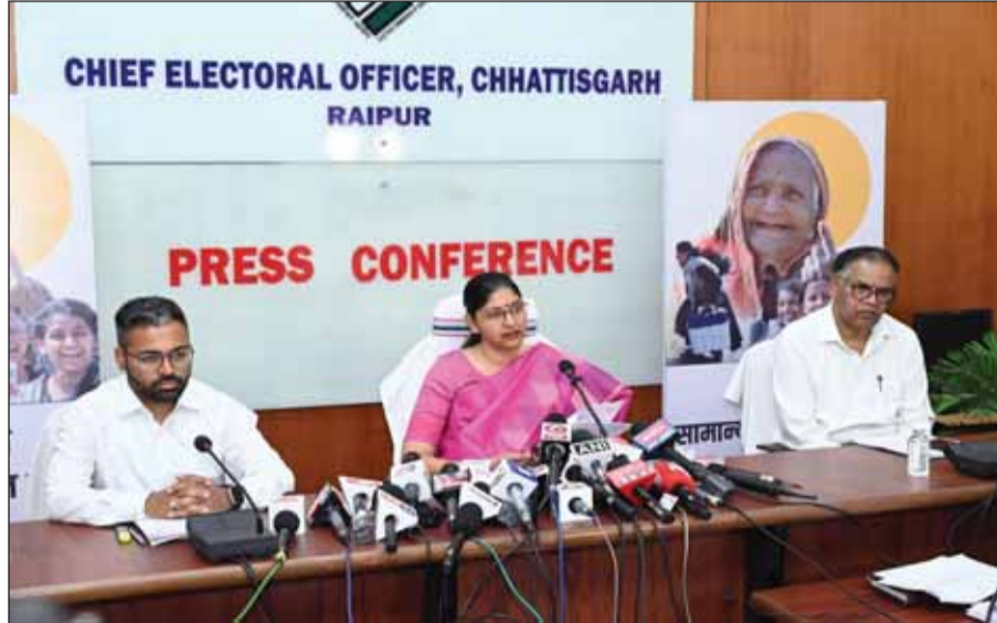
Chhattisgarh will see elections in three phases on April 19 and 26, and May 7, and the results will be announced nationally on June 4.

There are 82,476 voters over the age of 85 and 2,855 over the age of 100.