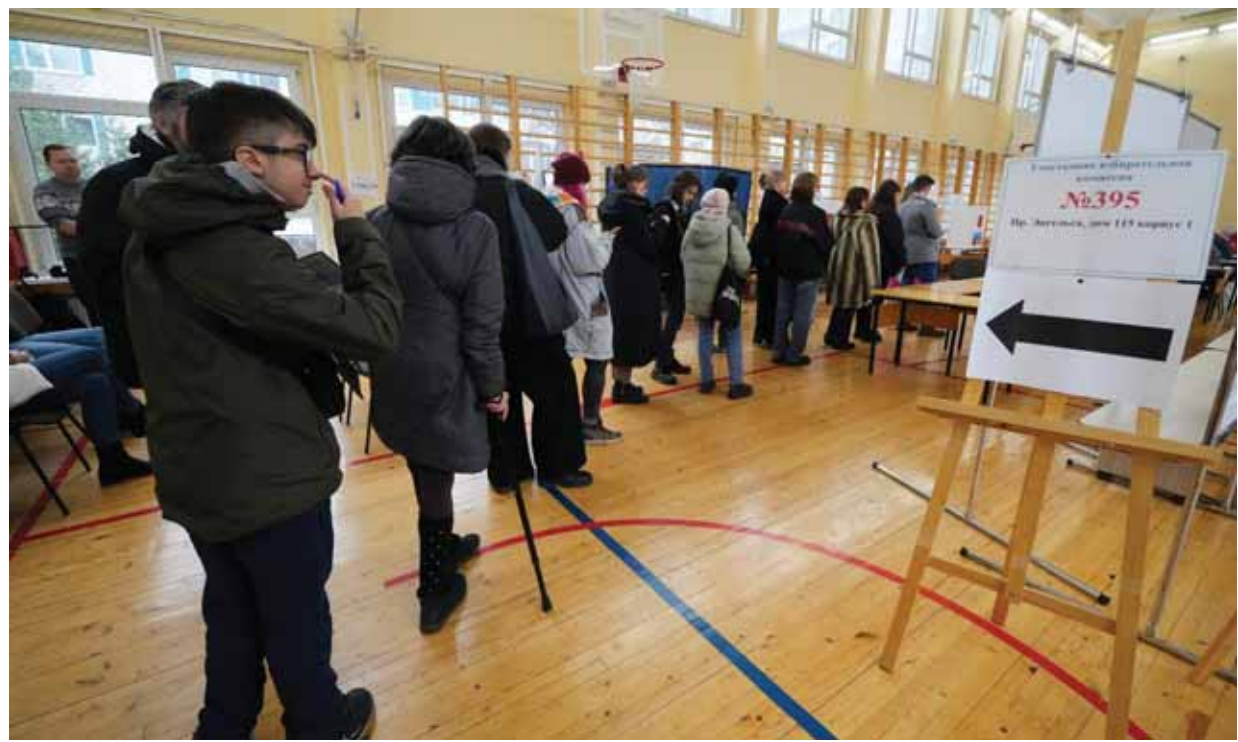
Voters queue at a polling station in St Petersburg, Russia, at noon local time on Sunday

military personnel with civilians and continue the operations of two helicopters and a Dornier aircraft provided to the country for humanitarian and medical evacuation services. Muizzu's administration has also said that it would review more than 100 agreements signed with India by the previous governments. Muizzu "affirmed the importance of the Maldives navigating its course towards self-reliance and remaining an independent and sovereign nation in every aspect," the press release said on Friday. Muizzu said that Maldives' independence and sovereignty "must be in the common interest of the entire populace, despite varying ideologies". He added that this would not impede the Maldives' close relations with all countries. Muizzu has affirmed that no Indian military personnel, not even those in civilian clothing, would be present inside his country after May 10.