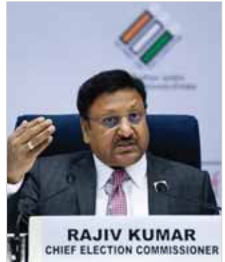
RAJIV KUMAR CHIEF ELECTION COMMISSIONER

India, the world's largest democracy, is gearing up once again for its general elections, a monumental event that not only captures the attention of the nation but also echoes globally. On Saturday Chief Election Commissioner Rajiv Kumar disclosed the schedule for the forthcoming Lok Sabha elections. The electoral process will unfold in 7 phases, commencing on April 19 and concluding on June 1, with the results slated for announcement on June 4. Notably, simultaneous polls will not be conducted. The Election Commissioner emphasised its commitment to addressing the challenges posed by the "4Ms" — muscle power, financial influence, misinformation, and violations of the Model Code of Conduct — which pose obstacles to the conduct of free and fair elections. With the announcement of election dates, the nation is now abuzz with political fervour and anticipation, as preparations kick into high gear. However, amid the excitement, challenges loom, including completing the exercise peacefully, ensuring free and