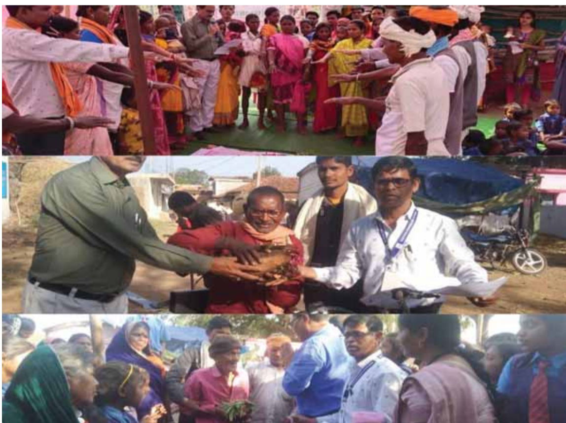
Highlights of voter education programmes organised for members of the special backward tribe Baiga and voters with disabilities in Chhattisgarh's Khairagarh-Chhukhadan-Gandai district on Sunday.