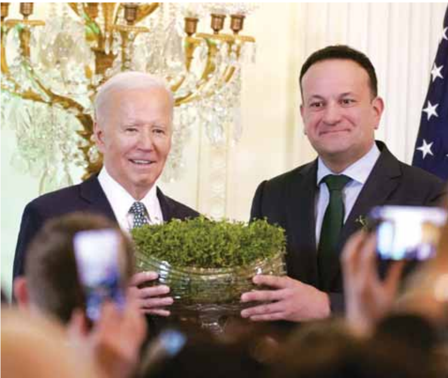
Ireland’s Prime Minister Leo Varadkar, right, presents President Joe Biden with a bowl of Shamrocks during a St. Patrick’s Day reception in the East Room of the White House, Sunday.