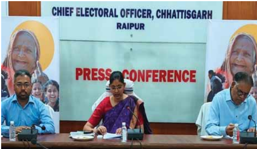
like ramps, drinking water, electric lighting, toilets and more, she said. Chhattisgarh will see balloting on April 19 and 26, and May 7, and the results

A voter support centre will be set up at each polling station. All polling stations have ensured basic facilities