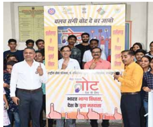
strengthen democracy through street drama. Women in Dantewada district created rangolis and urged others to exercise their franchise.

The students of Pt. Ravishankar Shukla University in Raipur educated people about the importance of voting to