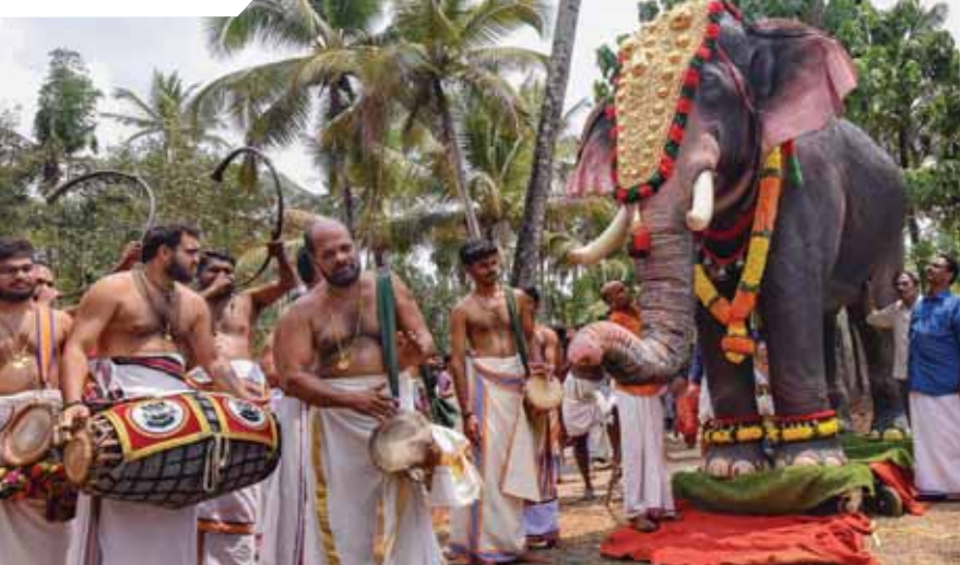
A realistic mechanical elephant, gifted to Thirikkayil Mahadeva temple by PETA India, in Kochi