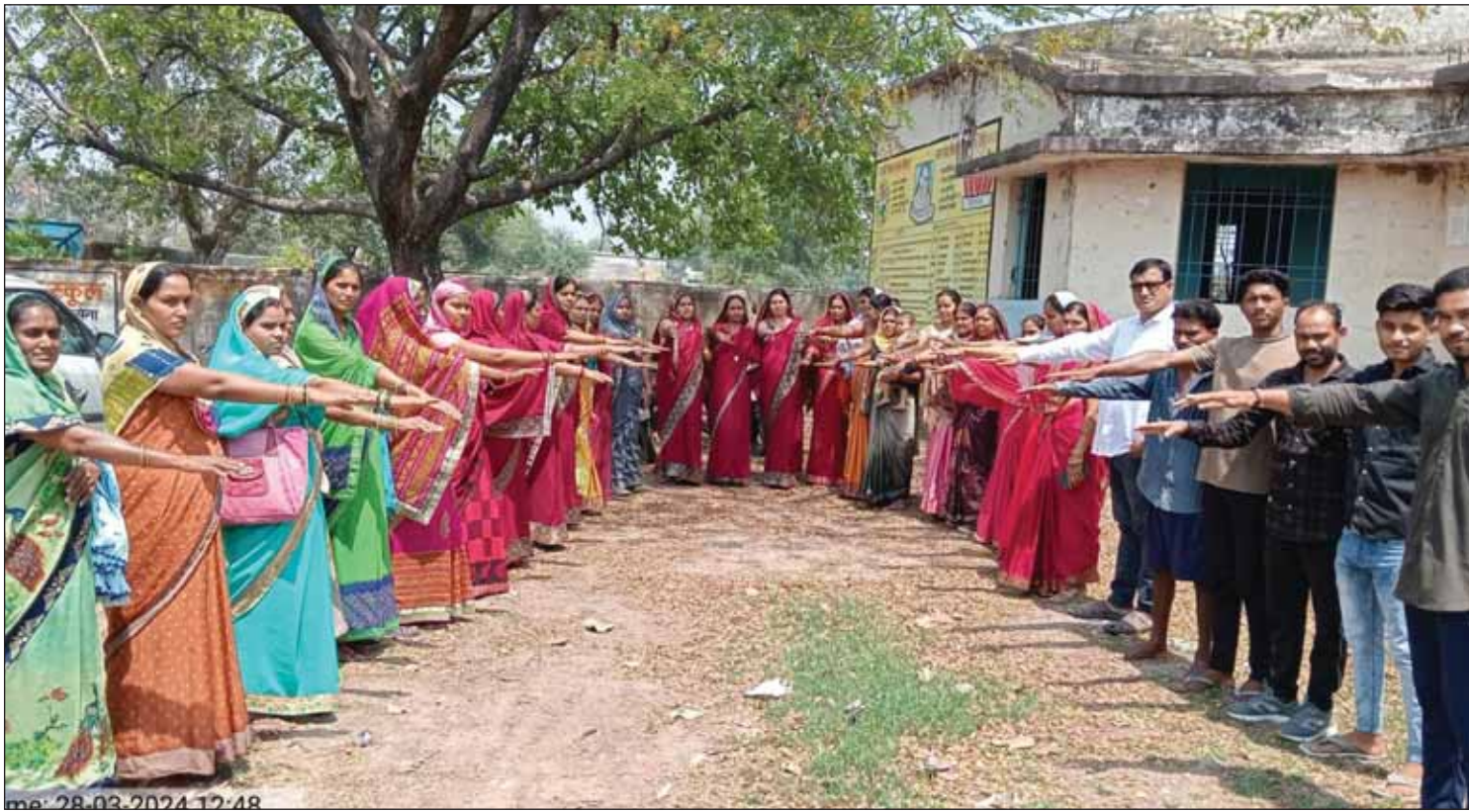
Women members of a Self-Help Group in Chhattisgarh's Bilaspur conducting awareness campaign to spread the importance of voting in elections.

Elections to the 11 Lok Sabha seats in the state will be held on April 19 and 26 and May 7.