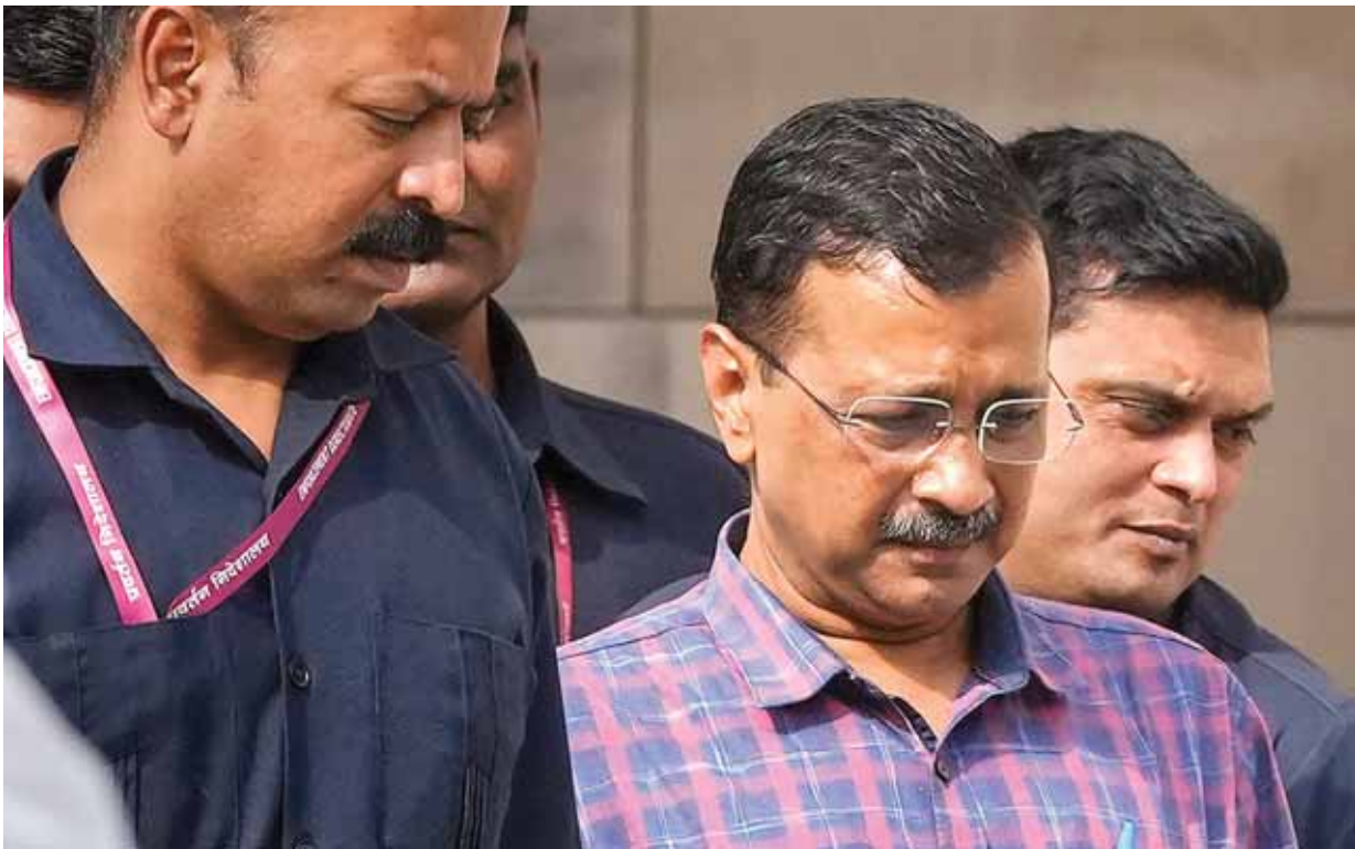
Delhi Chief Minister and AAP convenor Arvind Kejriwal comes out of the Rouse Avenue Court after he was produced by the Enforcement Directorate in the excise policy-linked money laundering case, in New Delhi, on Thursday