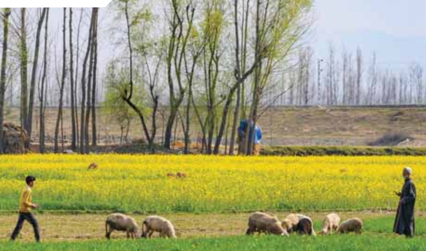
A shepherd with his sheep near a mustard field on the outskirts of Srinagar