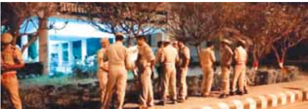
Security personnel stand guard at Government Medical College where gangster-turned-politician Mukhtar Ansari was admitted, in Banda, on Thursday