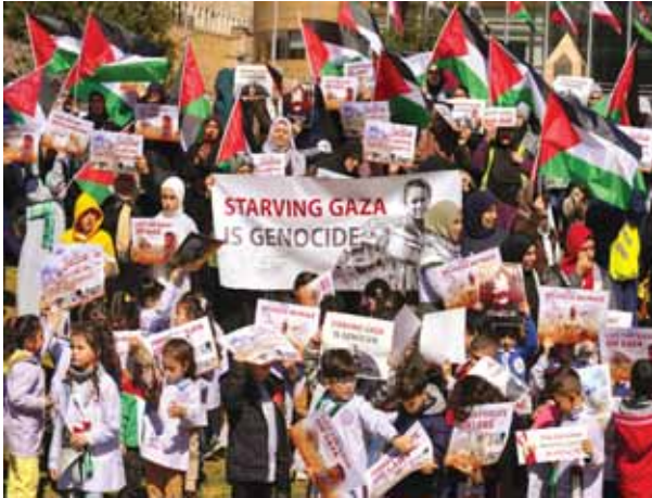
Palestinians living in Lebanon hold placards and their national flags during a protest to demand a ceasefire and support Palestinians in the Gaza Strip, in front of the headquarters of U.N. Economic and Social Commission for Western Asia (ESCWA) in Beirut, Lebanon on Thursday.

Israeli troops fired on a crowd of Palestinians waiting for aid in Gaza City on Thursday, witnesses said. More than 100 people were killed, bringing the death toll since the start of the Israel-Hamas war to more than 30,000, according to health officials. Hospital officials initially reported an Israeli strike on the crowd, but witnesses later said Israeli troops opened fire as people pulled flour and canned goods off of trucks. Israeli officials acknowledged that troops opened fire, saying they did so after the crowd approached in a threatening way. The officials insisted on anonymity to give details about what happened, after the military said in a statement that “dozens were killed and injured from pushing, trampling and being run over by the trucks.” Gaza City and the surrounding areas in the enclave’s north were the first targets of Israel’s air, sea and ground offensive, launched in response to Hamas’ Oct 7 attack. The area has suffered widespread devastation and has been largely isolated during the conflict. Trucks carrying food reached northern Gaza this week, the first major aid delivery to the area in a month, officials said