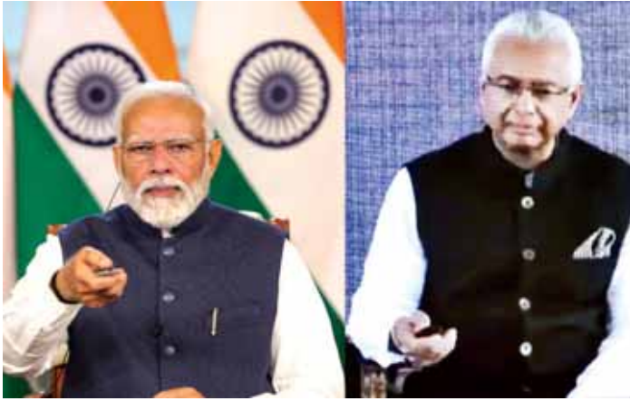
Prime Minister Narendra Modi and his Mauritian counterpart Pravind Jugnauth jointly inaugurate several India-assisted development projects at the Agalega Island in Mauritius, via a video conference, on Thursday

announced that Mauritius will be the first country to join India's Jan Aushadhi scheme, which is an initiative aimed at providing quality medicines at affordable prices. In his remarks, Modi flagged concerns over challenges in the Indian Ocean region and said India and Mauritius are "natural partners" in the maritime domain to deal with them. "Many traditional and non-traditional challenges are emerging in the Indian Ocean Region. All these challenges affect our economy. India and Mauritius are natural partners in the field of maritime security to deal with the challenges," he said at the virtual ceremony. "We are actively working to ensure