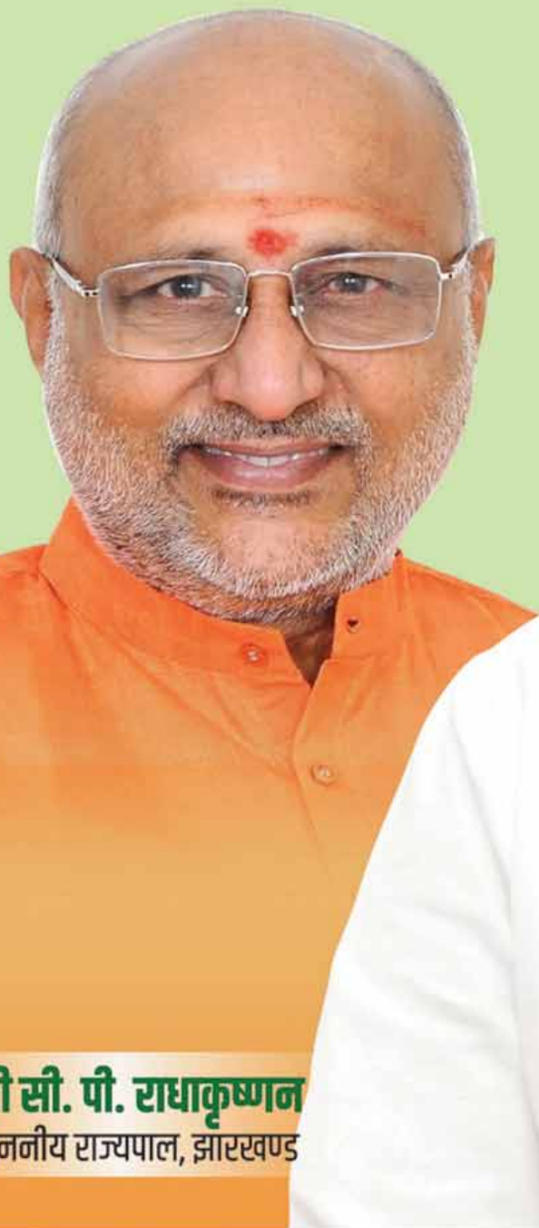
श्री सी. पी. राधाकृष्णन माननीय राज्यपाल, झारखण्ड