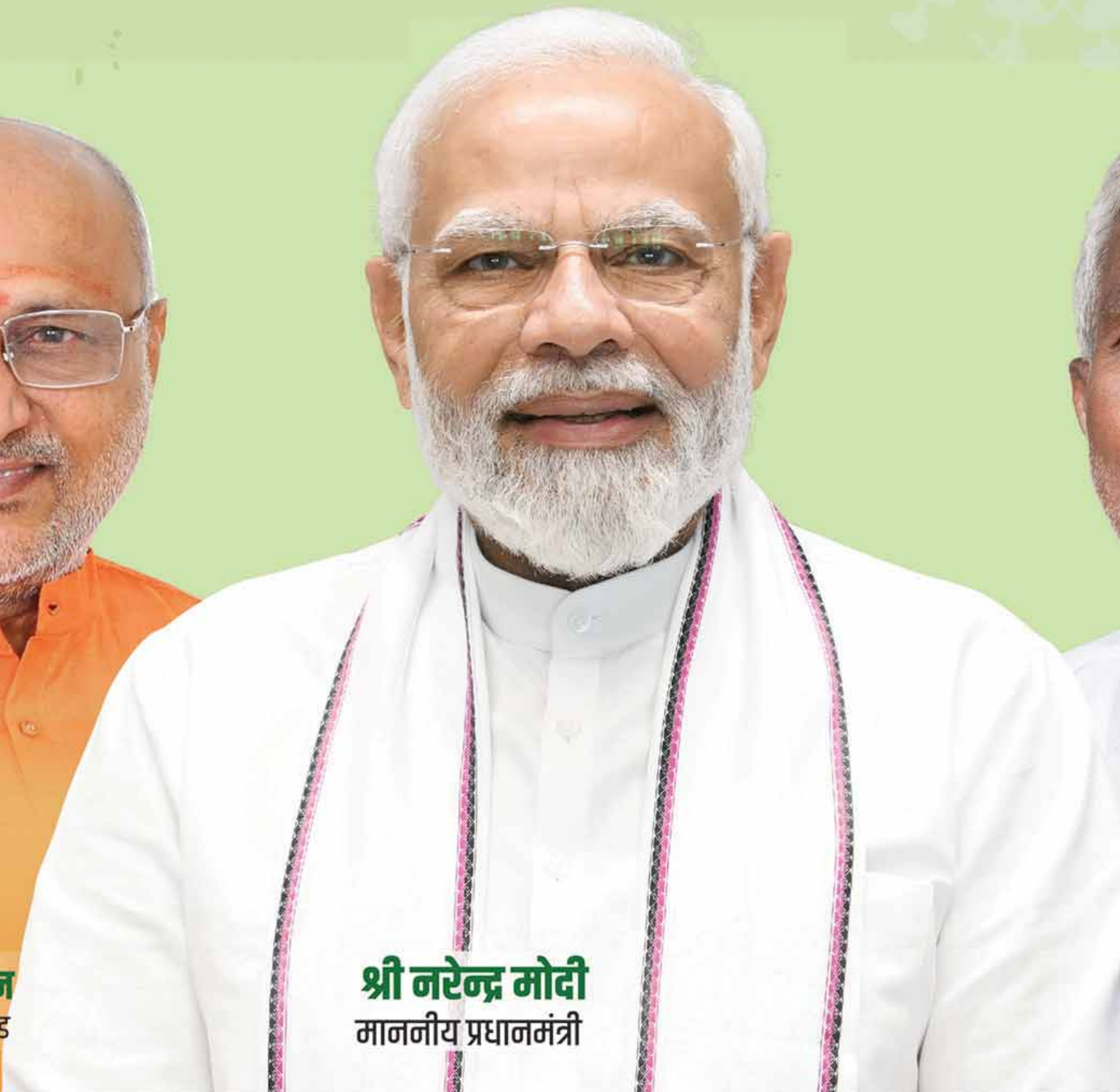
श्री नरेन्द्र मोदी माननीय प्रधानमंत्री