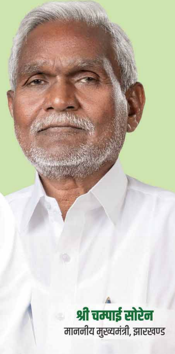
श्री चम्पाई सोरेन माननीय मुख्यमंत्री, झारखण्ड