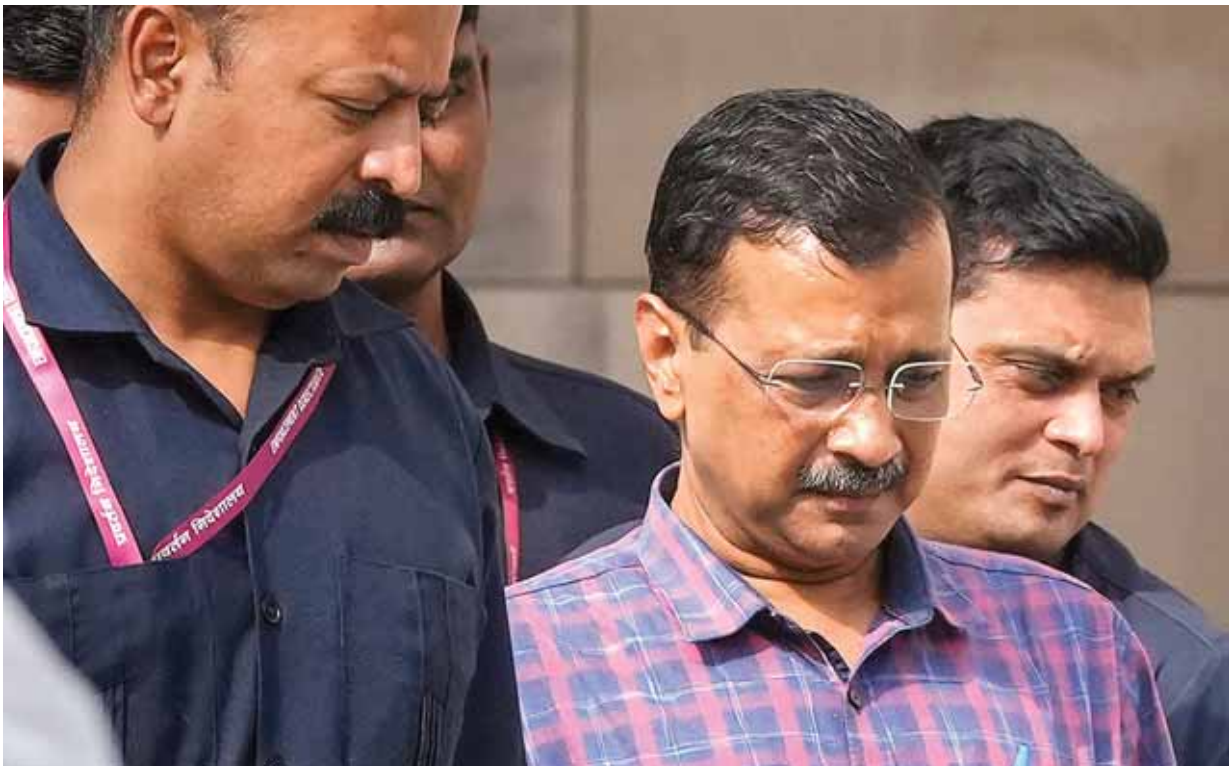
Delhi Chief Minister and AAP convener Arvind Kejriwal comes out of the Rouse Avenue Court after he was produced by the Enforcement Directorate in the excise policy-linked money laundering case, in New Delhi, on Thursday