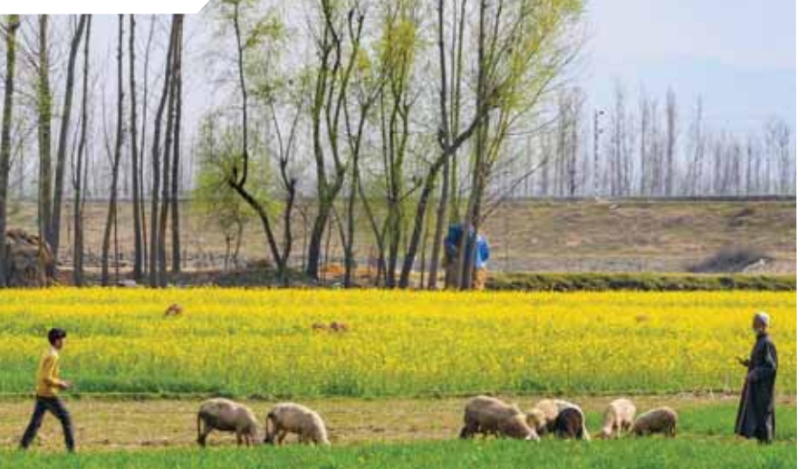
A shepherd with his sheep near a mustard field on the outskirts of Srinagar