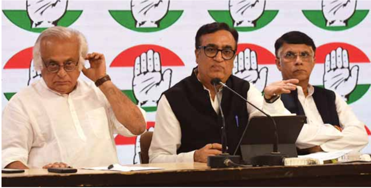
Congress leaders Jairam Ramesh, Ajay Maken and Pawan Kherra during a Press conference in New Delhi on Friday