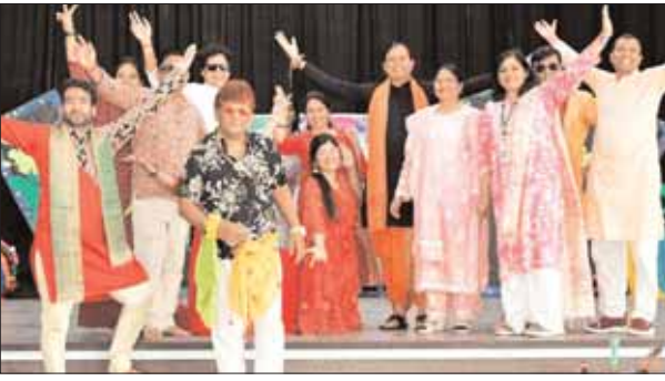
PNS : BOKARO

DPS Bokaro embraced the essence of Holi with a twist, hosting a 'Holi Milan Samaroh' that delighted attendees with a floral extravaganza instead of traditional chemical dyes. With the theme 'Phoolon Ki Holi', the school staff and teachers came together to celebrate in a sustainable and joyous manner, adding a new dimension to the festival.