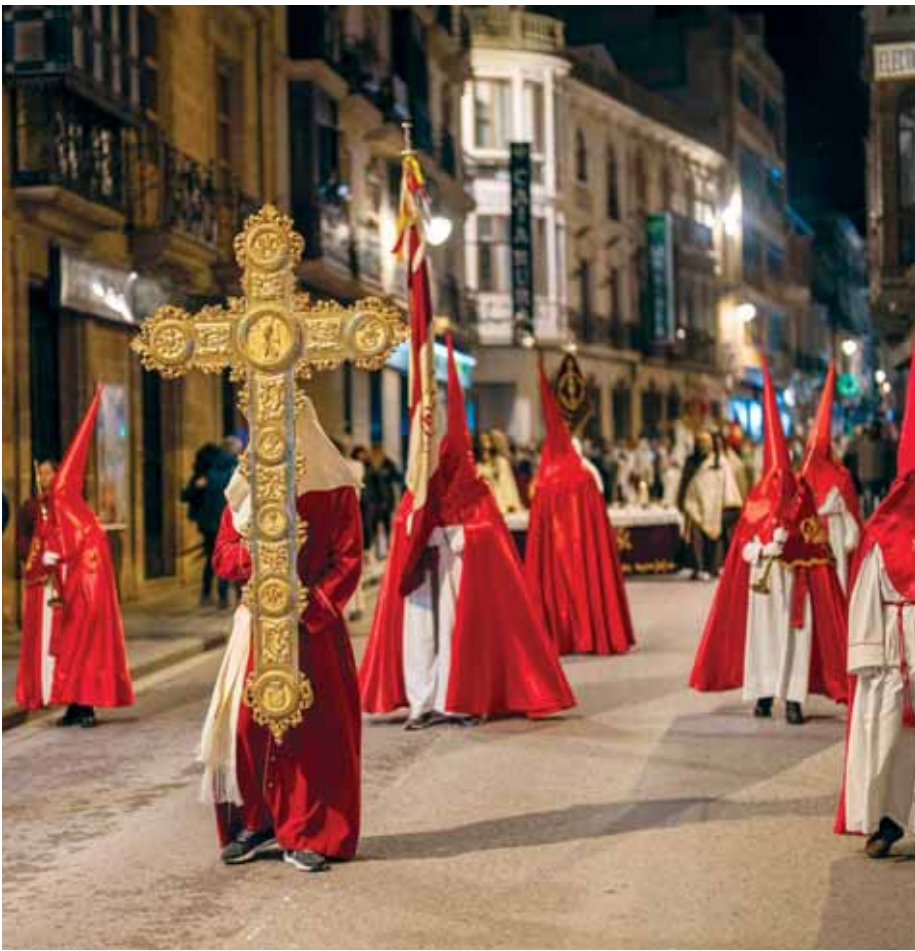
Members of “Muy Antigua Hermandad del Señor de la Humildad y María Santísima de los Dolores” Catholic brotherhood walk during a Holy Week procession in the southern city of Alcalá la Real, Spain, on Thursday