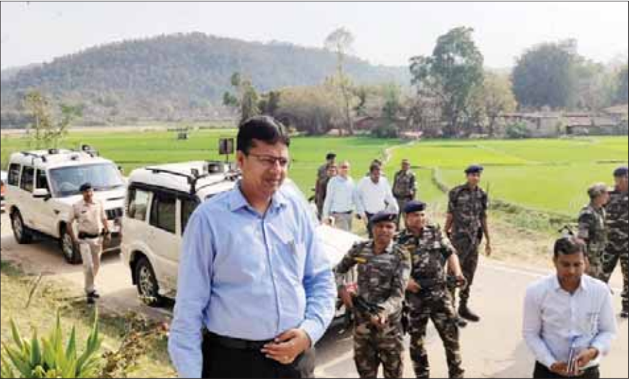
District Election Officer-Cum Deputy Commissioner Ranchi Rahul Kumar Sinha taking stock of preparations for Lok Sabha Elections 2024 at Tamar, in Bundu on Friday.

This act of compassion and swift action not only saved two precious lives but also exemplified the unwavering commitment of the Bokaro Police to uphold humanity above all else. In a world often clouded by chaos, their selfless dedication serves as a beacon of hope and inspiration for all.