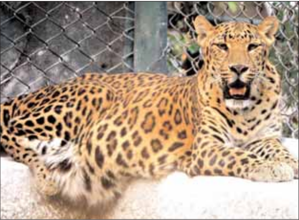
PNS : JAMSHEDPUR

In a startling development, a stray leopard has been sighted within the vicinity