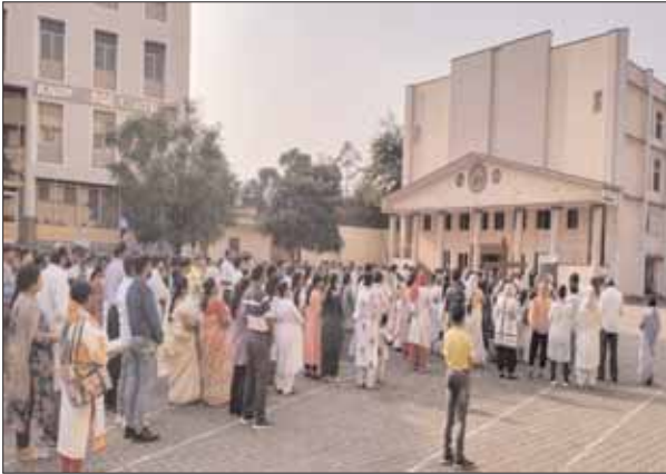
JAMSHEDPUR

Good Friday, a solemn occasion commemorating the crucifixion of Jesus Christ, was observed with reverence and devotion by Christians in Jamshedpur. The faithful congregated at Loyola School Church to participate in special services marking this significant day in the Christian calendar.