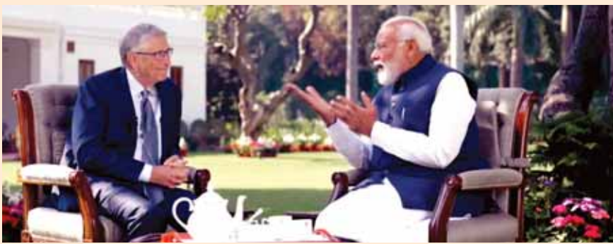
Prime Minister Narendra Modi with Microsoft co-founder Bill Gates during a meeting at his residence in New Delhi on Friday

“frontal organisation”. He said the Supreme Court will soon hear the Congress’s plea on the I-T department’s demands from it. Maken alleged that the “BJP-ruled I-T department” has so far forcibly taken out ₹135 crore from the Congress’s bank accounts due to an alleged ₹14 lakh non-compliance demand against the party. “This amount was recovered by freezing more than ₹270 crore of the Congress’s bank balance across several accounts,” he said. During this period of several weeks, the bank accounts of the Congress were effectively “frozen” in an illegal attempt to paralyse the party’s functioning during the Rahul Gandhi-led Bharat Jodo Nyay Yatra, Maken alleged. In the history of India, why is the Congress, a tax-exempt political party like others, being “forced” to pay income tax during the 2024 Lok Sabha election, he asked. “Why have the BJP or its alliance partners not been dealt with similarly? Why has the I-T department not taken cognisance of the Yediyurappa diaries, Jain diaries, Sahara diaries, Birla diaries, Bangaru Lakshman convictions and penalised the BJP?” he asked. The CPI on its part said the Left party is consulting its lawyers to challenge the notice of the tax authorities.