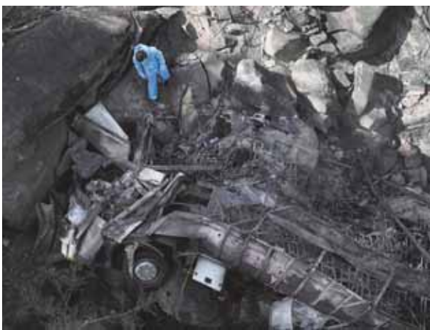
The wreckage off a bus lays in a ravine a day after it plunged off a bridge on the Mmamatlakala mountain pass between Mokopane and Marken, around 300km (190 miles) north of Johannesburg, South Africa on Friday.

Hours after the Thursday afternoon crash, smoke seeped from the mangled, burned wreck underneath the concrete bridge. Authorities said it appeared that the driver lost control and the bus ploughed into the barriers along the side of the bridge and then over the edge. The driver was among the dead. The crash happened in a mountainous region near the town of Mokopane, which is about 200 kilometres (125 miles) north of the South African capital, Pretoria. The Limpopo provincial government said the bus, which was carrying pilgrims from Botswana, veered off the Mmamatlakala bridge and