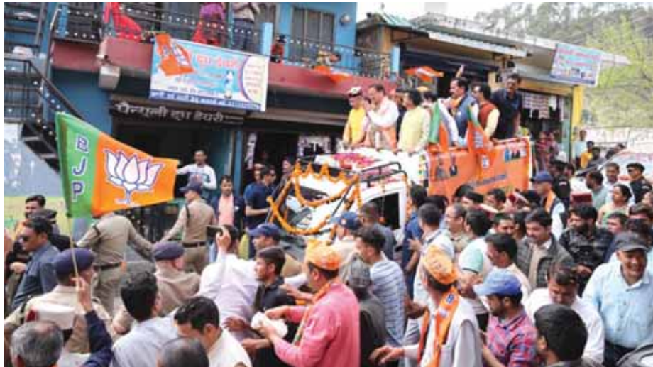
Uttarakhand Chief Minister Pushkar Singh Dhami conducting road show campaign in Garhwal on Friday for party nominees for the Lok Sabha polls

Though Uttarakhand boasts for the first State to pass the Uniform Civil Code and the BJP hopes to retain all five Lok Sabha seats but the local issues like unemployment and health care is on top of the mind of voters and the Congress is attempting to regain the ground on the above subjects dominating the mind of youths to upset the ruling party here. Though the traditional voters will rally behind the Congress and the BJP, Panwar who is contesting the Lok Sabha as an Independent seems to have emerged the choice and voice of youths of Uttarakhand, particularly in the Garhwal (Tehri and Pauri) region and making inroads in Kumaon landscape above Ramnagar