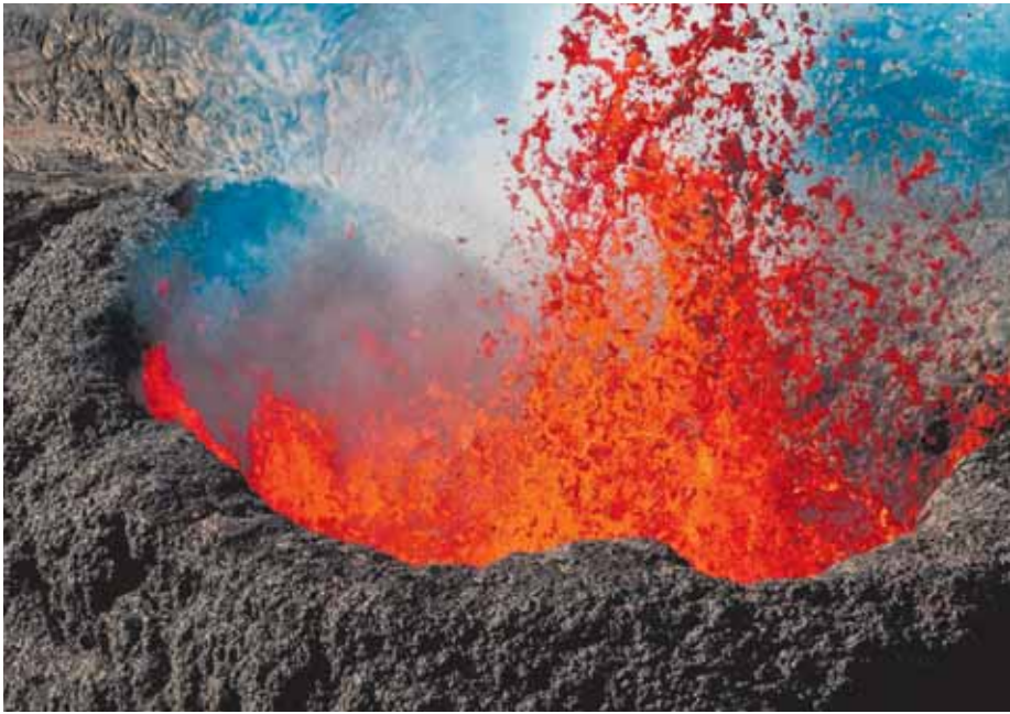
Lava erupt near the town of Grindavik, Iceland on Thursday.

cers, who had him lean against the car and made him open the trunk while they called the car rental agency before letting him go. "Though I understood that I had no choice but to put up with this abuse, it was a terrible way to be treated, a humiliating way to feel," Gossett wrote in his memoir. "I realized this was happening because I was Black and had been showing off with a fancy car — which, in their view, I had no right to be driving." After dinner at the hotel, he went for a walk and was stopped a block away by a police officer, who told him he broke a law prohibiting walking around residential Beverly Hills after 9 p.m. Two other officers arrived and Gossett said he was chained to a tree and handcuffed for three hours. He was eventually freed when the original police car returned.