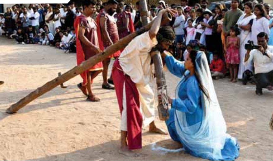
Christian devotees during a play on crucifixion of Jesus Christ on the occasion of Good Friday, in Hyderabad