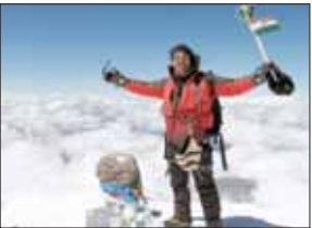
PNS : RANCHI

Siddhanta, a Guinness World Record Holder has completed 7 Summits, 7 Volcanic Summits & South Pole expedition