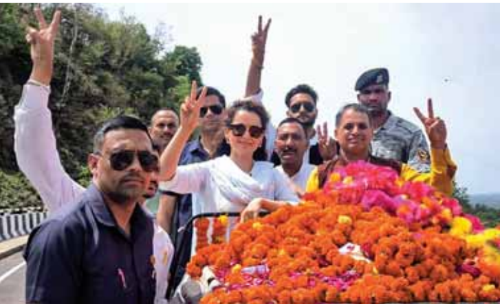
BJP candidate actor Kangana Ranaut during a roadshow ahead of Lok Sabha elections, in Mandi

“Development is BJP's main agenda and we will spare no effort to win the elections under the guidance of Prime Minister Modi,” she said, adding that the “people of Mandi will tell what is in their hearts”. This was Ranaut's first public appearance in her constituency after getting the BJP ticket on March 24. In October 2022, Ranaut had said she was open to contesting from Mandi if the BJP offered her a ticket. Crediting PM Modi with a “change in the country” since 2014, Ranaut had said a feeling of pride and nationalism prevails among every Indian. At present, the Mandi Lok Sabha seat is being represented by Himachal Pradesh Congress Committee president Pratibha Singh, wife of former chief