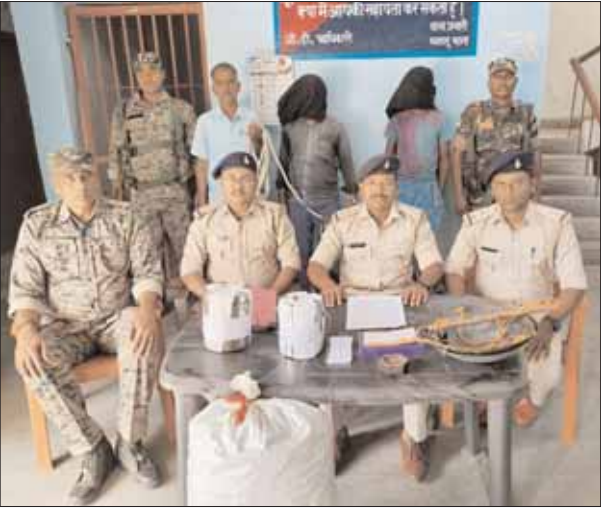
Police in Palamu with seized narcotics