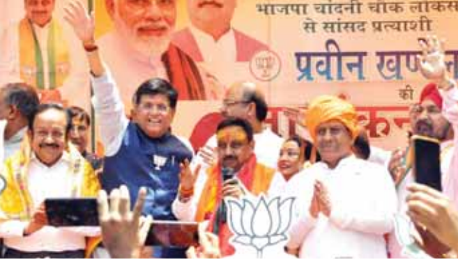
Union Minister Piyush Goyal, former Union Minister and BJP leader Harsh Vardhan with others during a 'Jansabha' in support of the party candidate from Chandni Chowk constituency Praveen Khandelwal, ahead of the third phase of Lok Sabha elections, at Chandni Chowk, in New Delhi, on Friday

works not for individuals but for organisational development, and each candidate is a symbol of the organisation. We will ensure the victory of BJP candidate Khandelwal by ensuring maximum voter turnout on election day.