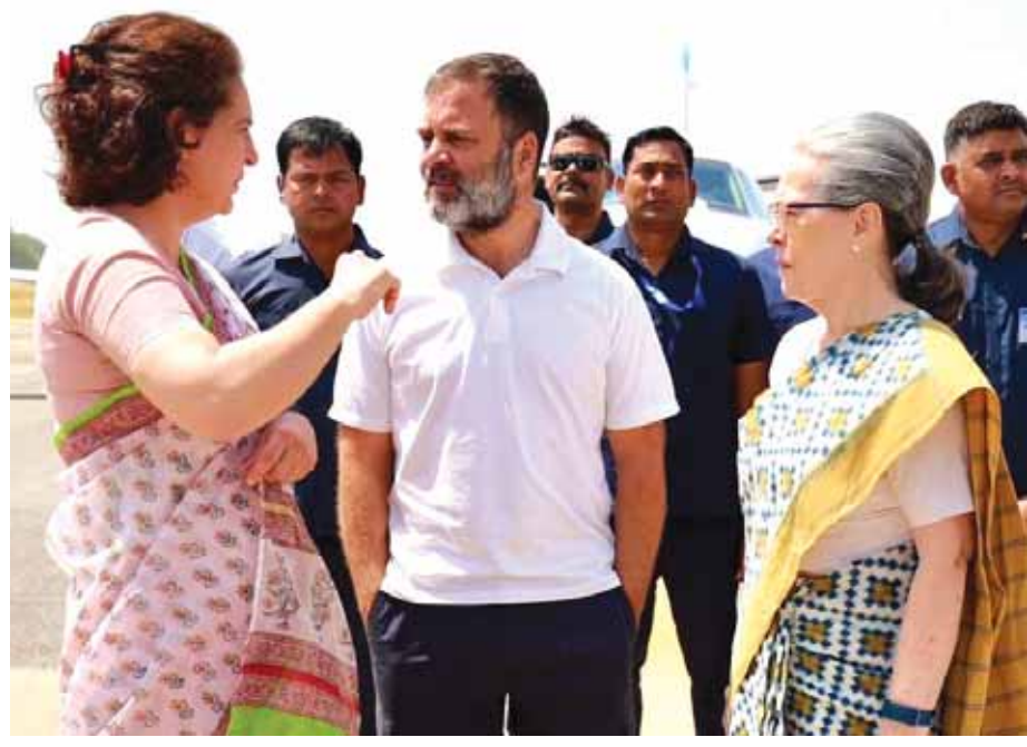
Congress leaders Rahul Gandhi, Sonia Gandhi and Priyanka Gandhi Vadra upon their arrival before the nomination filing of Rahul ahead of the third phase of the Lok Sabha elections, in Raebareli

On deciding to contest from Raebareli Lok Sabha constituency, former Congress president Rahul Gandhi apparently made a calculated risk to solve several anomalies within and outside the party and hence retaining the legacy of Gandhi-Nehru family.