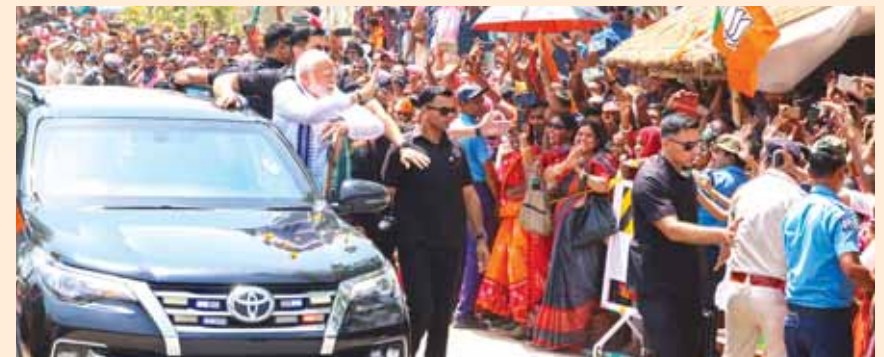
Prime Minister Narendra Modi waves at supporters on his arrival for a public meeting for Lok Sabha elections, in Krishnanagar, West Bengal, on Friday

to the leader of the largest political party. On the other hand, winning would have tarnished his image with the people of Amethi if he had chosen to leave after securing a victory. The party leadership which has fielded KL Sharma who is household name in Amethi as well Raebareli and is confident enough to wrest the seat from Irani, wants to send a message that even a simple Congress worker successfully ran down the BJP candidate.