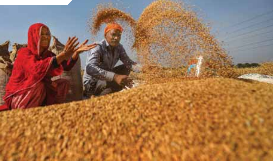
Farmers harvest wheat at a village near the Indo-Pak border, on the outskirts of Jammu