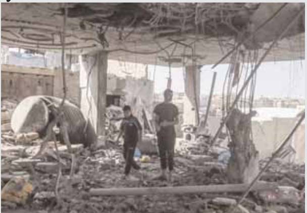
Palestinians stand in the ruins of the Chahine family home, after an overnight Israeli strike that killed at least two adults and five boys and girls under the age of 16 in Rafah, southern Gaza Strip, Friday. An Israeli strike on the city of Rafah on the southern edge of the Gaza Strip killed several people, including children, hospital officials said Friday.

Turkiye on Thursday suspended all imports and exports to Israel citing the country's ongoing military action in Gaza and vowed to continue to impose the measures until the Israeli government allows the flow of humanitarian aid to the region. A Turkish Trade Ministry statement said "export and import transactions in relation to Israel have been stopped, covering all products." Turkish officials would coordinate with Palestinian authorities to ensure that Palestinians are not affected by the suspension of imports and exports, the ministry said. The ministry described the step as the "second phase" of measures against Israel, adding that the steps would remain in