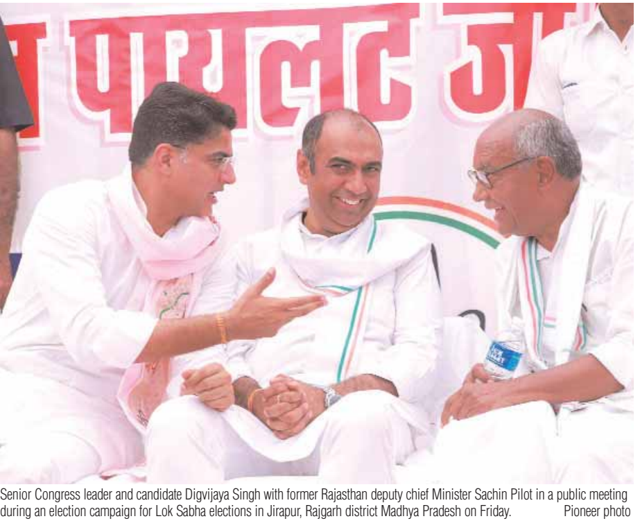
Senior Congress leader and candidate Digvijaya Singh with former Rajasthan deputy chief Minister Sachin Pilot in a public meeting during an election campaign for Lok Sabha elections in Jirapur, Raigarh district Madhya Pradesh on Friday.