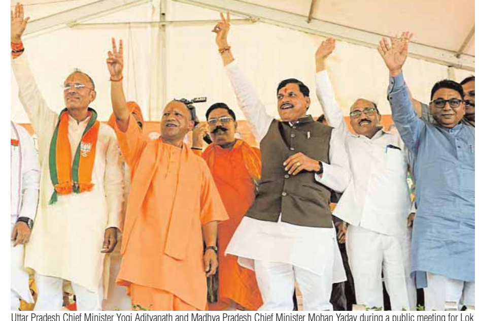
Uttar Pradesh Chief Minister Yogi Adityanath and Madhya Pradesh Chief Minister Mohan Yadav during a public meeting for Lok Sabha elections in Sambhal, Uttar Pradesh on Friday.

There is also a warehouse in the factory premises which was also damaged. It is being told that the fire broke out in the weeds of a field.