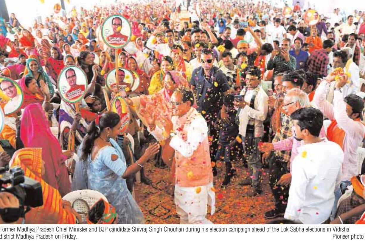
Former Madhya Pradesh Chief Minister and BJP candidate Shivraj Singh Chouhan during his election campaign ahead of the Lok Sabha elections in Vidisha district Madhya Pradesh on Friday.