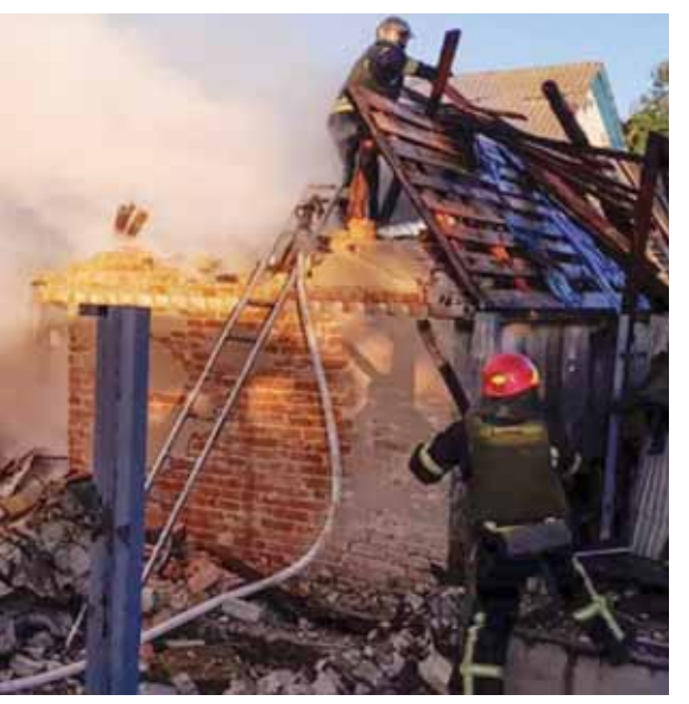
Wednesday's attacks occurred on the day that Ukraine observes the end of European fighting in World War II. "Massive missile attack by Nazi Putin on the Day of Remembrance and Victory over Nazism in the Second World War," Zelenskyy said.

Russia launched aerial attacks on energy facilities throughout Ukraine early Wednesday, targeting seven regions with more than 50 missiles as well as drones, President Volodymyr Zelenskyy said.