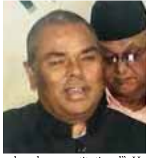
Upendra Yadav, Deputy Prime Minister and Chairperson of the Janata Samajbadi Party-Nepal (JSP-N).

Deputy Prime Minister and Chairperson of the Janata Samajbadi Party-Nepal (JSP-N) Upendra Yadav on Wednesday said that he will approach the court against the "unconstitutional move" to divide his party when he was abroad as he insisted that the split would not affect the stability of the coalition government.