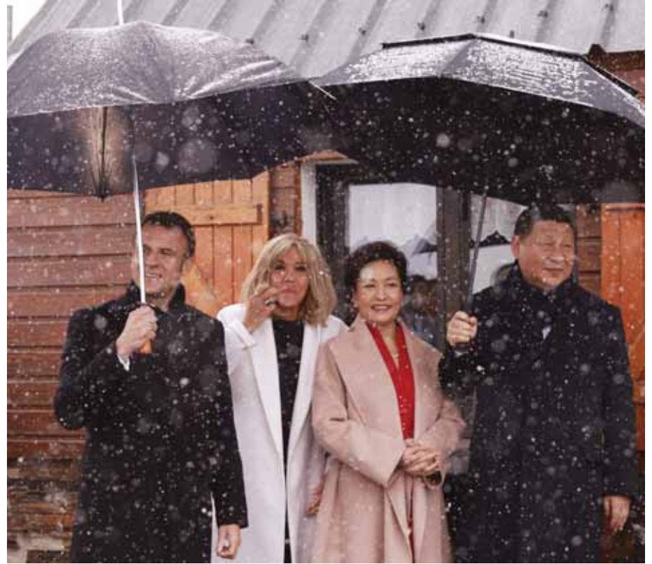
French President Emmanuel Macron and his wife Brigitte Macron, Chinese President Xi Jinping, and his wife Peng Liyuan watch folklore dancers on Tuesday at the Tourmalet pass, in the Pyrenees mountains.

Beijing (PTI): China's former defence minister Gen. Wei Fenghe whose prolonged absence from the public view sparked speculation about his fate has resurfaced, suggesting that he was politically safe, a media report said on Wednesday.