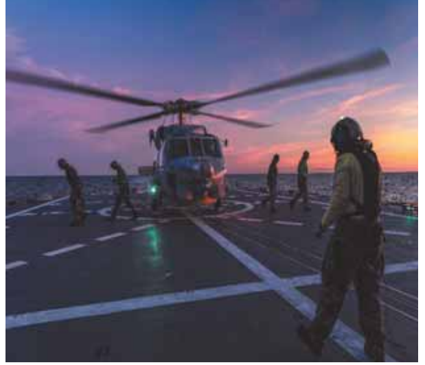
In this undated photo provided by the Australian Defence Force, a Seahawk helicopter prepares to take off from the deck of HMAS Hobart during flying operations while on a regional presence deployment off northern Australia.

China's account blaming Australia for a dangerous clash between their military aircraft in international airspace over the Yellow Sea failed to undermine Australian objections, Prime Minister Anthony Albanese said Wednesday.