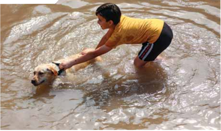
A child bathes his dog in a waterbody on a hot summer day, in Jammu