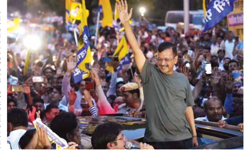
Delhi Chief Minister Arvind Kejriwal addresses supporters after coming out of Tihar Jail as the Supreme Court (SC) granted him interim bail in a money laundering case, amid the ongoing Lok Sabha elections, in New Delhi, on Friday

He has been asked to surrender to the prison authorities by June 2. June 1 is the last day of the seven-phase elections. The votes will be counted on June 4.