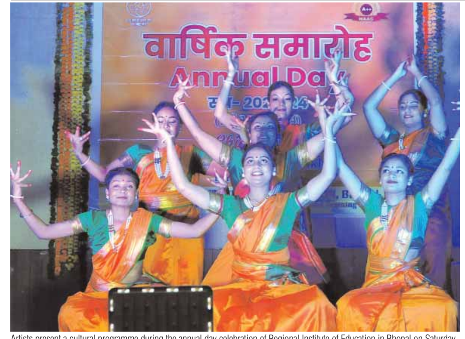
Artists present a cultural programme during the annual day celebration of Regional Institute of Education in Bhopal on Saturday.