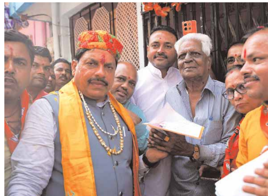
Madhya Pradesh Chief Minister Mohan Yadav distributes voter slips to the voters during door-to-door campaign in ward no 35 of Ujjain South State Assembly constituency, ahead of the fourth phase of Lok Sabha elections in Ujjain, Madhya Pradesh on Saturday.

Congress and its leader Rahul Gandhi are saying that if BJP comes to power, they will destroy democracy. They do not know that BJP is already in power and the work of saving this democracy has been done by Prime Minister Narendra Modi. He has protected the honor and dignity of the country, the democracy of the country, the democracy of the country and the people of the country and has brought respect to India in the world. When Pakistan killed Indian soldiers while they were sleeping, the whole world saw what happened after that. Twice he has entered Pakistan's house and taught him a lesson. Congress party and its leaders love terrorists, they address them as Osamaji, but one whose roots are from enemies outside the country can never deserve respect.