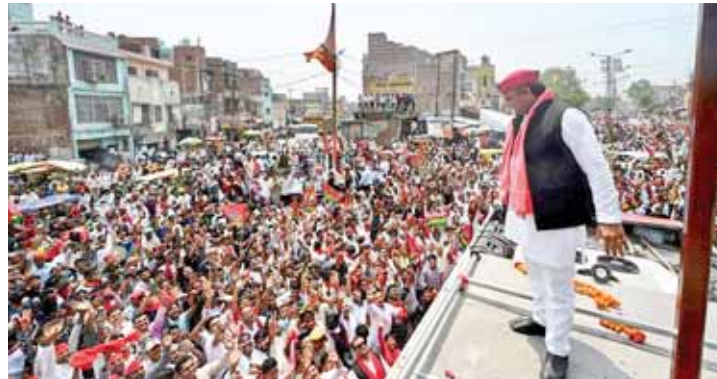
Samajwadi Party President Akhilesh Yadav during his campaign for Lok Sabha elections, in Kannauj district, on Saturday

In the heartland of Uttar Pradesh, the stage is set for a political spectacle as former Chief Minister Akhilesh Yadav braces himself for an electoral showdown in Kannauj. This battleground holds more than just electoral significance; it is a symbolic arena where familial legacies clash, and political destinies are determined. At the core of this unfolding drama lies a deeply personal quest for redemption. Akhilesh's decision to contest from Kannauj is not merely a strategic move but a poignant attempt to avenge his wife Dimple Yadav's defeat in the previous elections. The sting of that loss still resonates, propelling Akhilesh with a fervent resolve to reclaim Kannauj for the Samajwadi Party (SP), a stronghold nurtured by his father, Mulayam Singh Yadav. "The wounds of defeat run deep, but so does our determination," declares Akhilesh, his voice echoing with unwavering resolve. "Kannauj embodies our legacy, and we will not allow it to slip away." In the 1990s, Mulayam strategically expanded his influence in Kannauj, a constituency dominated by Yadavs and Muslims, transforming it into a bastion for the SP's first family. Over 16 elections held in Kannauj since 1967, Mulayam-affiliated candidates emerged victorious 10 times, while non-Yadav candidates