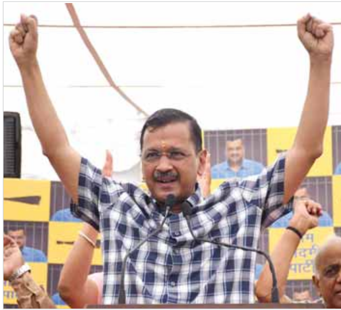
Delhi Chief Minister Arvind Kejriwal addresses a press conference

Filled with energy and high political spirit ever since he walked out from Tihar Jail on Saturday, Delhi Chief Minister Arvind Kejriwal while addressing his enthused party workers launched a scathing attack at the BJP and Prime Minister Narendra Modi, accusing him of crushing his and other Opposition parties. Kejriwal, who has launched his Lok Sabha campaign for the May 25 Delhi schedule, alleged that the BJP is on a mission to bring about dictatorship in the country. Besides the "one nation, one leader" jibe, the AAP convenor also accused the BJP of shielding corrupt leaders and asked them if they would live up to the rule of retirement at the age of 75 that was brought about by Prime Minister Narendra Modi. Kejriwal further claimed that the Prime Minister wants Amit Shah to succeed in his acknowledgement that the party is set to retain power for a third straight term. At the same time Kejriwal also asserted the BJP will not return to power and said the INDIA Bloc will form the Government on June 4. "In the last 20 hours after release from jail, I talked to poll experts and people and got to know the BJP is not going to form the Government. The AAP will be part of the Government at the Centre. We will get full Statehood for Delhi and it shall have a people's Governor, not a man from Gujarat," he said, while adding that according to his assessment that the BJP is not getting more than 220-230 seats.