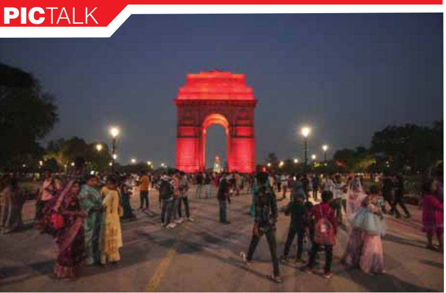
India Gate lit in red to raise awareness on World Thalassaemia Day, in New Delhi