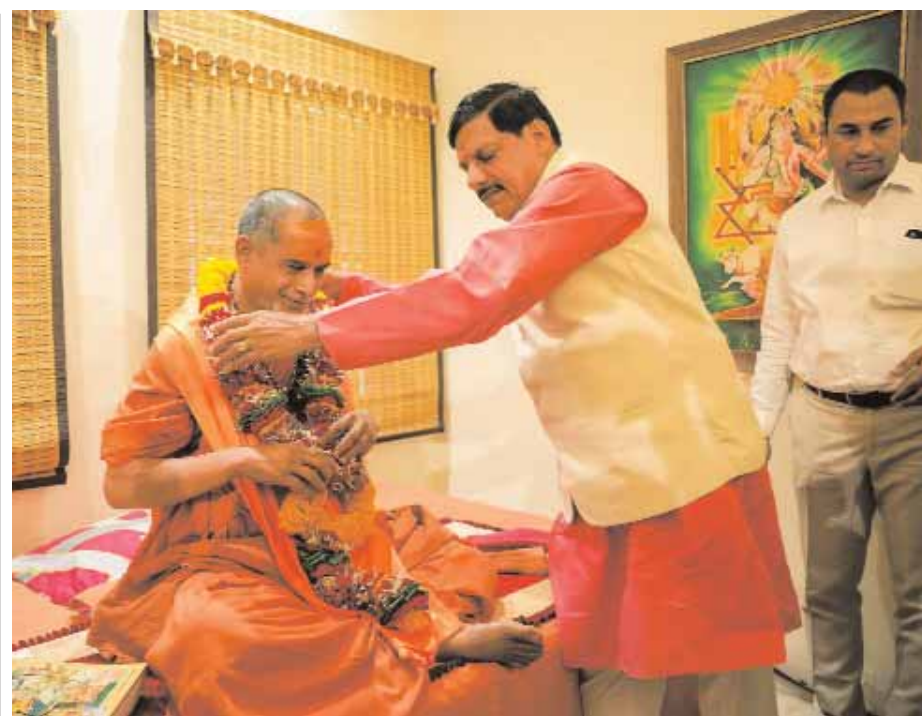
Madhya Pradesh Chief Minister Mohan Yadav with Dwarika Sharda Peethadheeshwar jagadguru Shankaracharya Swami Sadanand Saraswati during a meeting in Bhopal on Sunday.