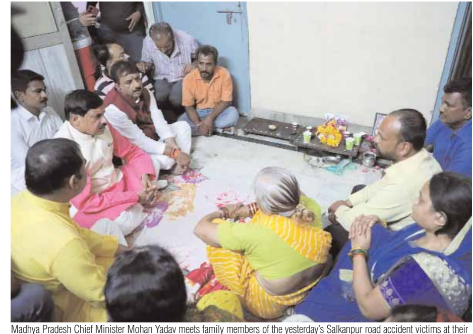
Madhya Pradesh Chief Minister Mohan Yadav meets family members of the yesterday's Salkanpur road accident victims at their residence in Chouksey Nagar in Bhopal on Sunday. Seven persons of a family were died in the accident.