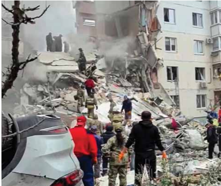
In this photo taken from video released by the Russian Emergency Ministry Press Service on Sunday, May 12, 2024, Russian emergency services work at the scene of a partially collapsed block of flats authorities said was hit during an attack by Russia.

Thousands more civilians have fled Russia's renewed ground offensive in Ukraine's northeast that has targeted towns and villages with a barrage of artillery and mortar fire, officials said on Sunday. The intense battles have forced at least one Ukrainian unit to withdraw in the Kharkiv region, capitulating more land to Russian forces across less defended settlements in the so-called contested "gray zone" along the Russian border. By Sunday afternoon, the town of Vovchansk, with a prewar population of 17,000, emerged as a focal point in the battle. Volodymyr Tymoshko, the head of the Kharkiv regional police, said Russian forces were in the outskirts of the town and approaching from three directions. A Russian tank was spotted along a major road leading to the town, Tymoshko said, illustrating Moscow's confidence to deploy heavy weaponry.