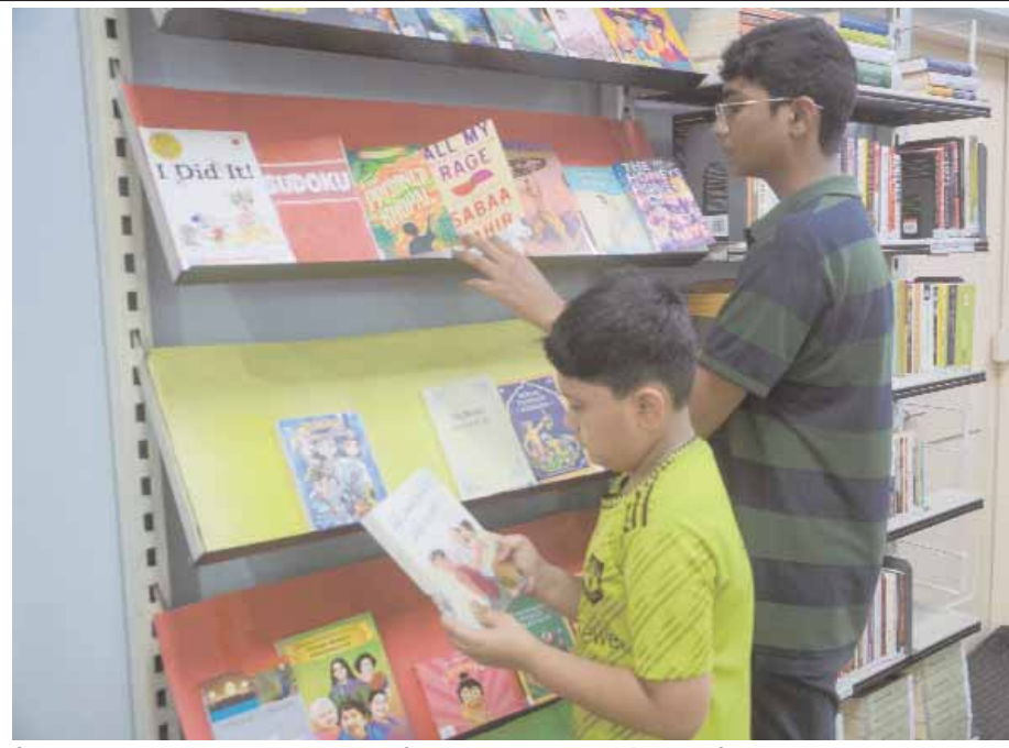
Children go through a new collection of books at Swami Vivekanand library in Bhopal on Sunday.