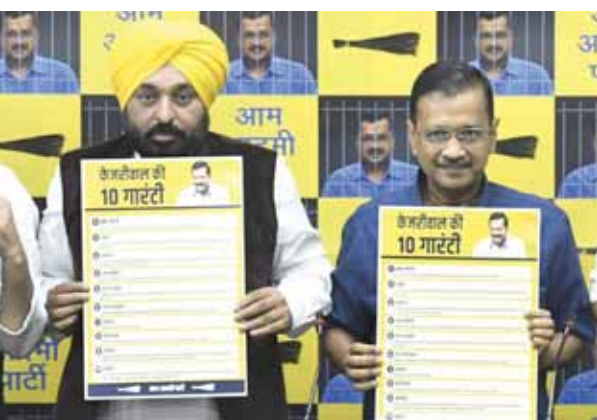
Delhi Chief Minister and AAP convener Arvind Kejriwal with party leaders Bhagwant Mann during a Press conference, in New Delhi, on Sunday. Kejriwal on Sunday announced 'Kejriwal ki Guarantee' — a list of promises for Lok Sabha elections