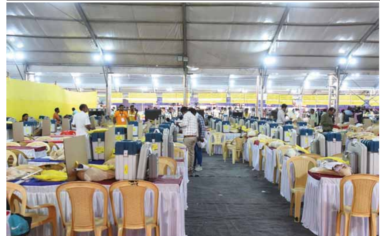
EVMs and other election material kept for distribution at a center on the eve of the fourth phase of Lok Sabha elections in Indore on Sunday.

days. Similar weather will continue for the next few days. The system will start weakening from May 15. Senior Scientist of the Meteorological Department, Bhopal, said that there is a Western Disturbance over the North West. Another Western Disturbance is becoming active in North India. Due to cyclonic circulation and passing of trough line, there is hail-storm, rain, storm and lightning in Madhya Pradesh. For the next 24 hours Met has issued warning of thunder storms and gusty winds in Bhopal, Vidisha, Rajgarh, Narmadapuram, Harda, Burhanpur, Khandwa, Shajapur, Agarmalwa, Neemuch, Singrauli, Sidhi, Mauganj, Shahdol, Umaria, Dindori, Katni, Jabalpur, Narsinghpur, Mandla, Balaghat, Patna, Damoh, Chhatarpur, Tikamgarh, in Niwari, Guna, Ashoknagar, Gwalior, Datia, Morena districts. The Met has issued an alert of hail storm, thunder storms and gusty winds in In Raisen, Sehore, Alirajpur, Bhand, Betul, Khargone, Barwani, Jabua, Dhar, Indore, Udaipur, Dewas, Mandasaur, Shivpuri, Ratlam districts.