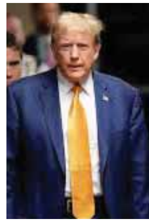
Trump, the presumptive Republican presidential nominee, drew what his team called a "mega crowd" to a Saturday evening rally in the southern New Jersey resort town of Wildwood, 150 miles (241

Blasting the Democratic president "a total moron," Trump before a crowd of tens of thousands repeatedly characterized the cases against him as politically motivated and timed to harm his ability to campaign. "He's a fool. He's not a smart man," Trump said of Biden. "I talk about him differently now because now the gloves are off."