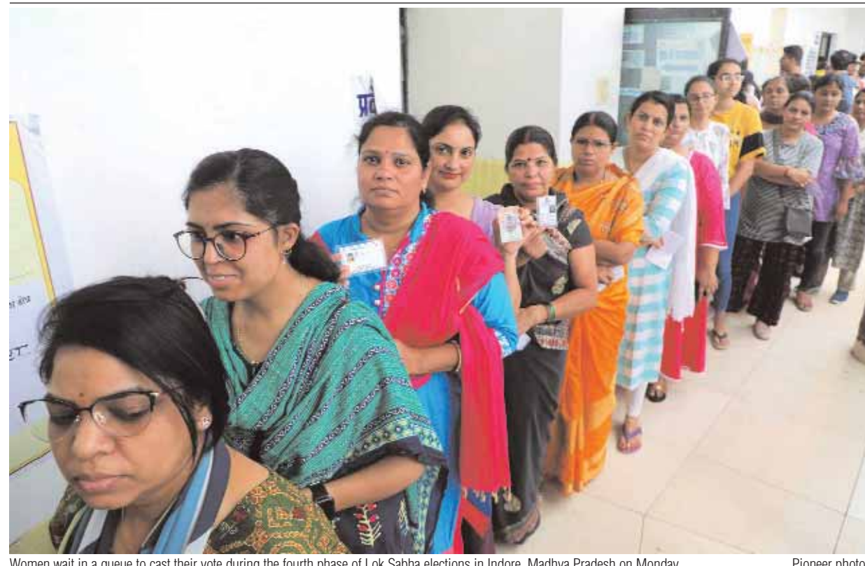
Women wait in a queue to cast their vote during the fourth phase of Lok Sabha elections in Indore, Madhya Pradesh on Monday.