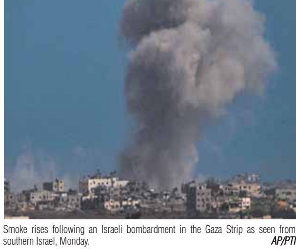
Smoke rises following an Israeli bombardment in the Gaza Strip as seen from southern Israel, Monday.

35,000 people in Gaza, mostly women and children, according to Gaza's Health Ministry, which doesn't distinguish between civilians and combatants. The small student protest Sunday at Duke's graduation in Durham, North Carolina, was emblematic of campus events across the US Sunday after weeks of student protests resulted in nearly 2,900 arrests at 57 colleges and universities. Students at campuses across the US responded this spring by setting up encampments and calling for their schools to cut ties with Israel and businesses that support it. Students and others on campuses whom law enforcement authorities have identified as outside agitators have taken part in the protests from Columbia University in New York City to UCLA. Police escorted graduates' families past a few dozen pro-Palestinian protesters who tried to block access to Sunday