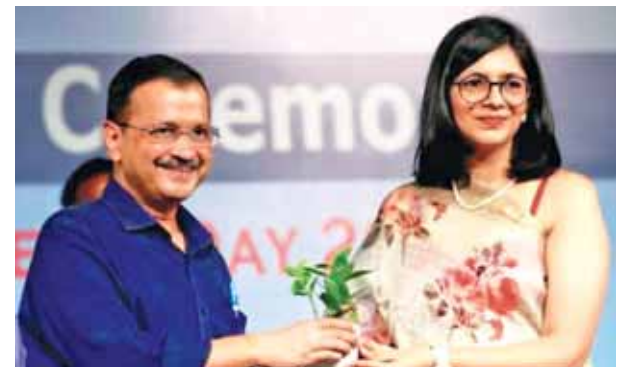
Delhi Chief Minister Arvind Kejriwal with Rajya Sabha MP Swati Maliwal