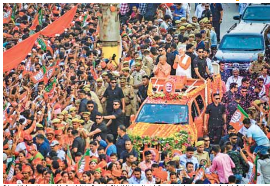
Prime Minister Narendra Modi with Uttar Pradesh Chief Minister Yogi Adityanath during a road show for Lok Sabha elections, in Varanasi, on Monday