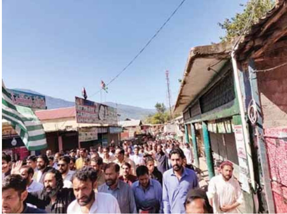
The situation remained tense as strike in PoK entered fourth day

left for Muzaffarabad, the capital of Pakistan-occupied Kashmir, on Monday as the wheel-jam strike entered its fourth day.