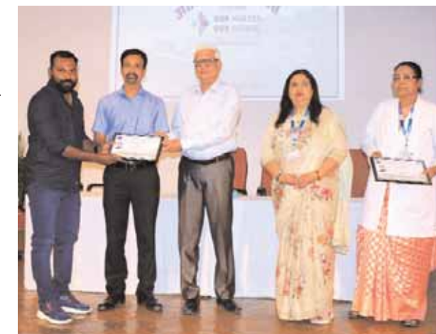
BMHRC for choosing this sacred profession. He said that imagining any hospital without a nurse is impossible. The reputation of any hospital is established because of its nursing and paramedical staff. Nurses also