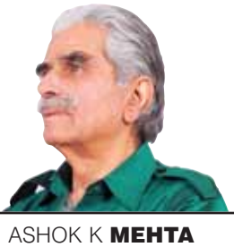
ASHOK K MEHTA

Amid strained India-Nepal relations, speculation swirls around a potential regime change in Nepal