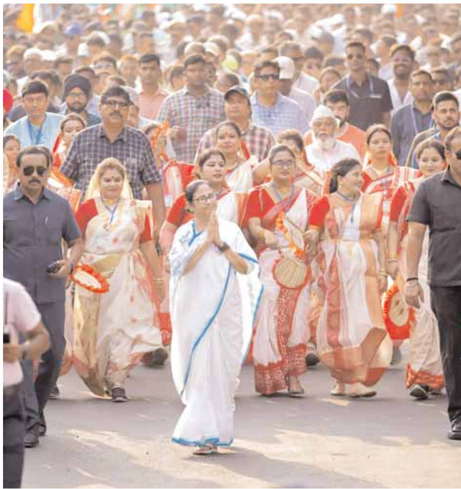
West Bengal Chief Minister Mamata Banerjee greets supporters during an election roadshow for the Lok Sabha polls, in Howrah, on Wednesday

Notwithstanding her "outside support" pledge for INDIA Bloc, Mamata said by INDIA she did not mean the Left and the Congress of Bengal. "I don't mean the