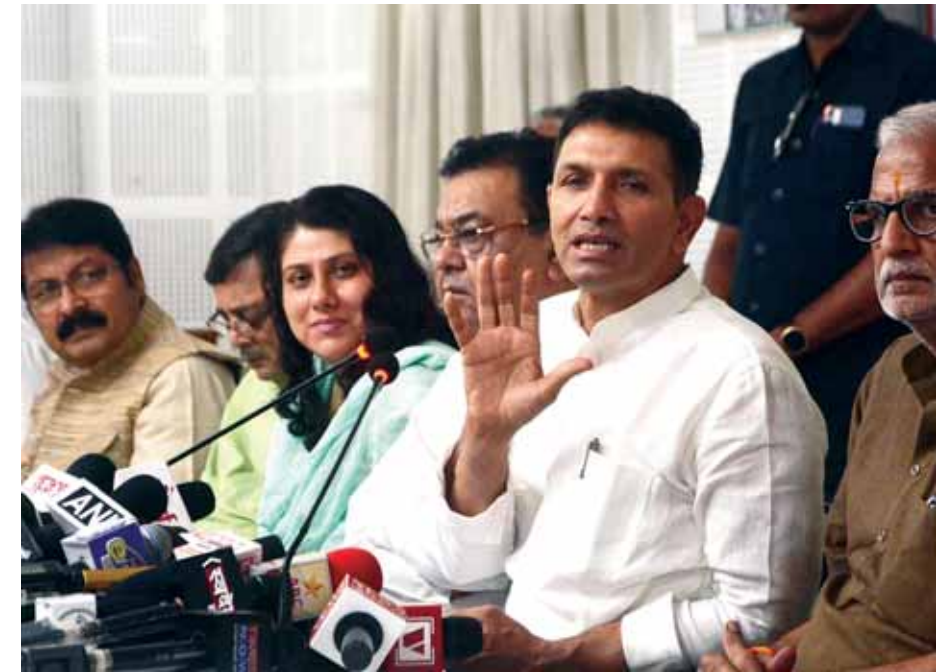
Congress State President Jitu Patwari talking to media persons at PCC headquarters in Bhopal on Wednesday.