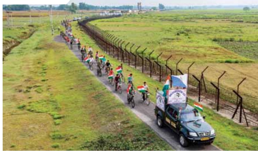
BSF personnel with a youth cycle rally to raise awareness for water, education and clean environment, in Dinajpur