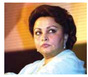
In this April 23, 2002 photo, Union Minister Jyotiraditya Scindia's mother Madhavi Raje Scindia attends an event in New Delhi. She died on Wednesday morning at AIIMS in Delhi

Rajmata, who hailed from Nepal's Royal family, got married to former Union Minister Madhavrao Scindia in 1966. She is survived by her son Jyotiraditya Scindia and daughter Chitrangada Raje Singh.