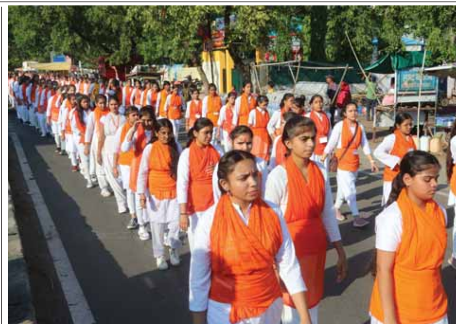
Vishwa Hindu Parishad's women wing Durga Vahini activists take part in a rally during a week-long 'Shaurya Prashikshan Varg' in Bhopal on Wednesday.

ture through initiatives like the Ather Grid, demonstrating its dedication to establishing the EV ecosystem in India. Ather Energy marked their transition into the family scooter segment with the Ather Rizta, a recent addition to the product lineup. The Rizta offers unparalleled convenience, safety, and comfort as a family scooter, featuring advanced safety technologies like SkidControl and FallSafe, and a generous range of up to 160 kilometres. Through Tanishq's experience, it's evident that Ather Energy has relentlessly worked towards enhancing commute, and has inspired a community of passionate enthusiasts dedicated to driving change one ride at a time. Join the EV revolution and share your unique Ather story today.