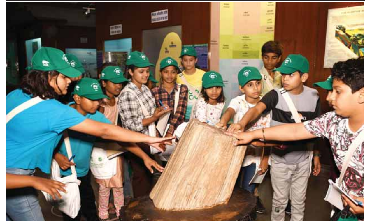
Children take part during the inauguration of the Summer Nature Study Programme, at the Regional Museum of Natural History in Bhopal on Wednesday.

wells will also be repaired. People are also wandering about many things like Samagra ID, Aadhar Card, Caste Certificate, Ayushman Card, Ration Card, Eligibility Slip, Ujjwala Yojana, Jan Dhan Account. These will also be dealt with. Officers will also focus on the status of payment in pension cases, revenue collection, wheat purchase, advance storage of fertilizers and seeds. There are many cases pending in SDM-Tehsil court also. These are related to nomination, demarcation, division etc. Due to the officers being busy in elections, they could not attend the hearing. To settle these cases, officers will sit in their court at the scheduled time. So that they can be settled.