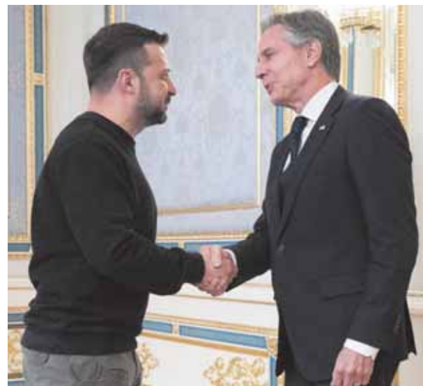
US Secretary of State Antony Blinken (right) shakes hands with Ukrainian President Volodymyr Zelenskyy (left) in Kyiv, Ukraine, on Wednesday.

Russian troops are pressing a fresh offensive in northeast Ukraine's Kharkiv region. It began last week, marking the most significant border incur-