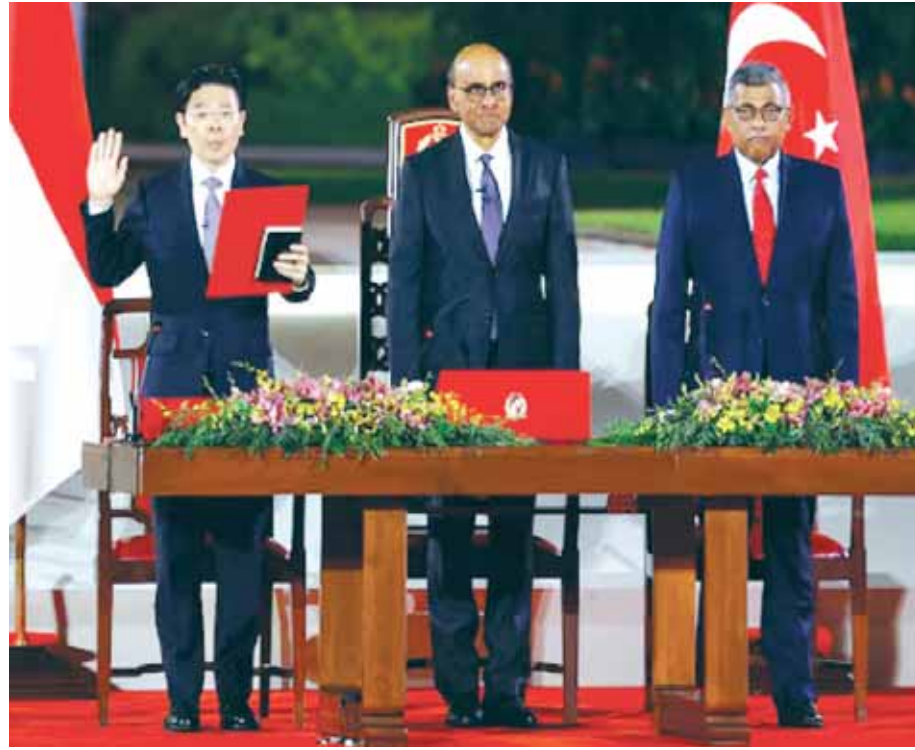
Singapore's Deputy Prime Minister and Minister of Finance Lawrence Wong is sworn in as Singapore's fourth Prime Minister next to Singapore's President Tharman Shanmugaratnam and Chief Justice Sundaresh Menon at the Istana, in Singapore.

Wong is retaining Heng Swee Keat, 63, and promoting