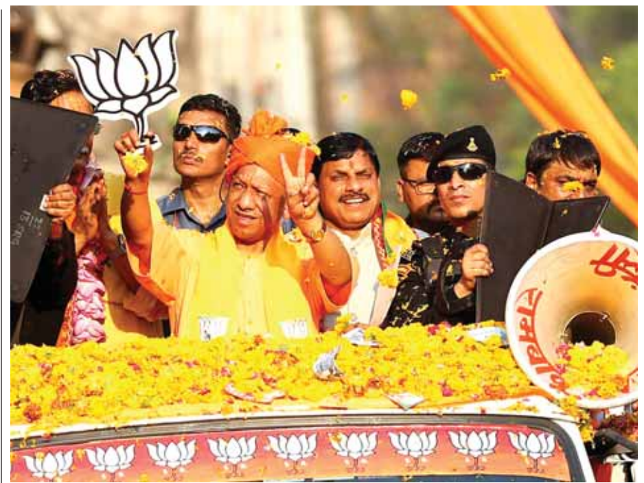
Madhya Pradesh Chief Minister Mohan Yadav with Uttar Pradesh Chief Minister Yogi Adityanath during a road show for Lok Sabha elections in Jhansi, Uttar Pradesh on Wednesday.

deny Bapuji's contribution, but we have forgotten Maharani Lakshmi Bai, we have forgotten Taty Tope, Nana Saheb Peshwa, Vasudeo Balwant Kharge, Amar Shaheed Kunwar Singh, Lala Lajpat Rai, Lokmanya Tilak. To Khudi Ram Bose, to Amar Shaheed Udhham Singh, to Shaheed Azam Bhagat Singh, to Chandrashekhar Azad, to Sukhdev, to Raj Guru, to Durga Bhabhi, to Ashfaq Ullah Khan, to Netaji Subhash Chandra Bose, to Veer Savarkar. forgot. Congress has committed the sin of not teaching us about these brave warriors. Congress taught this country the wrong history of independence and gave the wrong direction to the country. Chauhan said that three things are seen in the Lok Sabha elections.