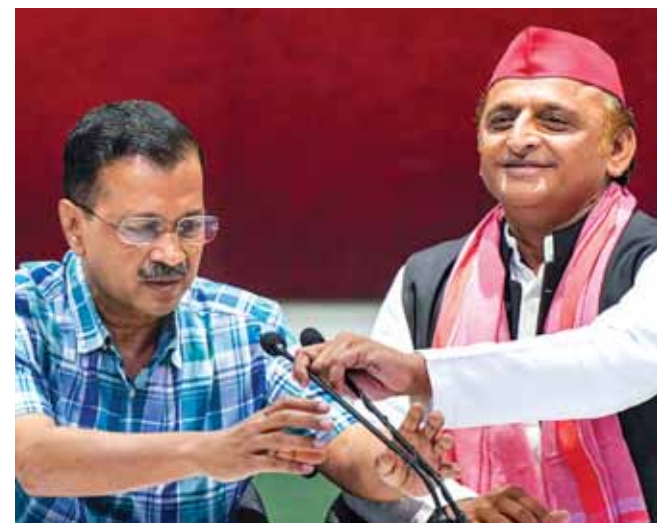
LUCKNOW PIONEER NEWS SERVICE

Minister said, "Your enthusiasm shows that you have made it difficult for the INDIA alliance to win even a single seat in Uttar Pradesh." Attacking SP chief Akhilesh Yadav, Modi said, "SP's shehzade also makes fun of Kashi. They are crossing every limit to please their vote bank. I am surprised that it is the 21st century and they are roaming around with the flag of triple talaq." Accusing the leaders of the INDIA Bloc of advocating reservation on the basis of religion, Modi said, "They advocate reservation on the basis of religion. They want to take away the right of reservation of the SCs, STs and OBCs by changing the Constitution of the country."