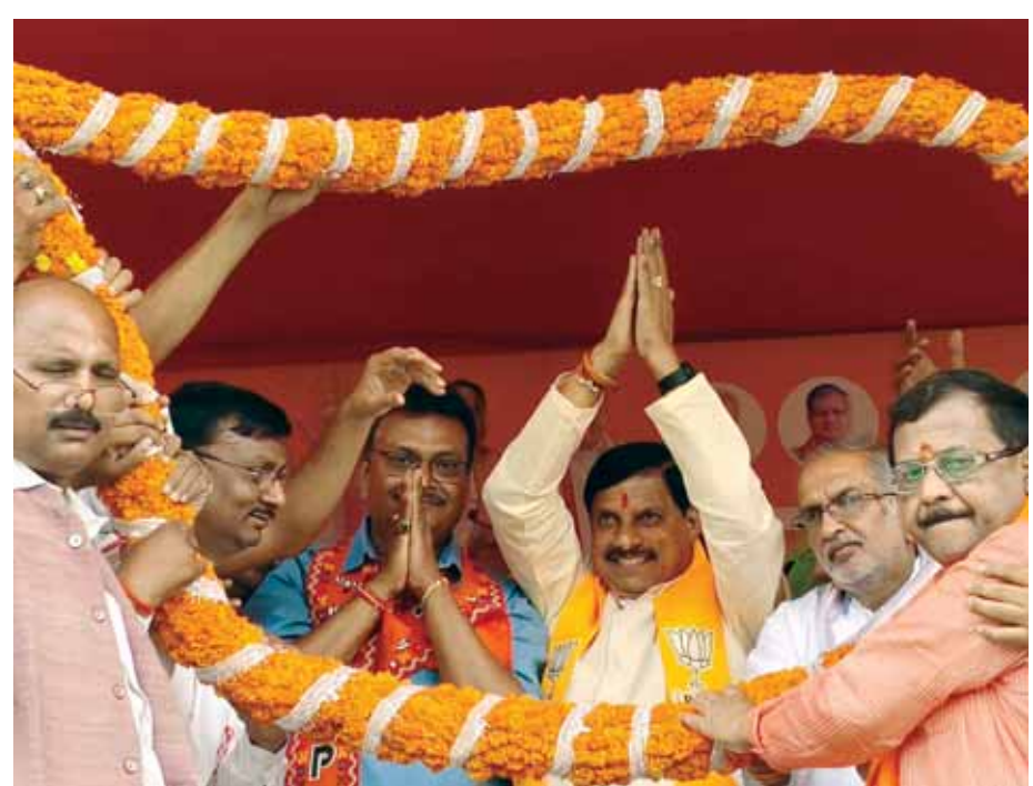
Madhya Pradesh Chief Minister Mohan Yadav during an election campaign for Lok Sabha elections in Jharkhand on Thursday.

2014, bombs used to explode anywhere in the country, but now it does not happen. Pakistan had committed a mistake once and was taught a lesson by entering the house twice. When the second vote was cast in 2019, Article 370 was removed from Kashmir, laws like triple talaq were implemented, Shri Ram temple was constructed and now Lord Shri Ram is smiling in the sanctum sanctorum. This time the vote has to be cast for the prosperity of the country as well as for Lord Krishna. Chief Minister Yadav said that Jharkhand is such a rich state that if its mineral wealth is properly utilized then this state can become the number one state in the country. This is the land of Lord Birsa Munda. Here there is a desire to break all the barriers and come among you.