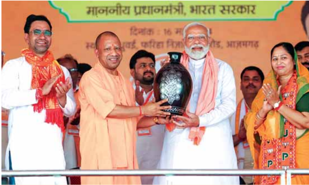
JAUNPUR/AZAMGARH PIONEER NEWS SERVICE

credit for the free ration scheme by putting his photograph on the papers related to the scheme, saying it was the Congress-led UPA Government that brought the Right to Food Act. The Congress leader also lambasted the BJP over frequent question papers leak in UP and promised stringent laws to stop such leaks. She promised to do away with GST on education and scrap the Agni-Veer scheme for recruitment in the armed forces if her party comes to power at the Centre. She said her party will restore the earlier method of permanent appointment with pension provision for the army personnel. The Congress general secretary also spoke about creating a Rs 5,000 crore fund to help small entrepreneurs. Voting in both the constituencies is scheduled in the fifth phase on May 20.