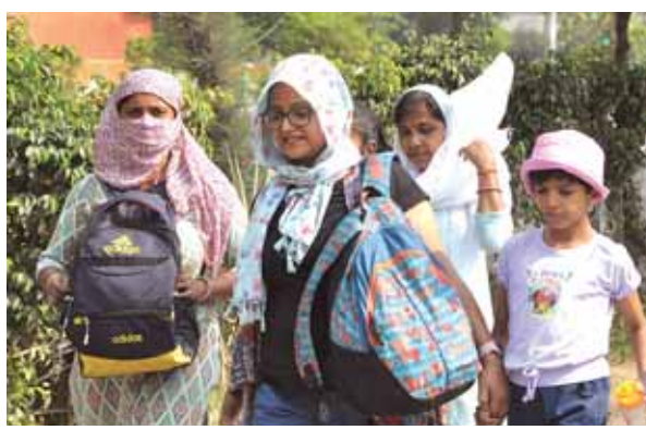
People use scarves to shield themselves from the hot summer

If you're residing in northwest India, brace yourself for intense heatwaves ahead. Days after predicting thunderstorms and rain spells in the region, the India Meteorological Department (IMD) on Thursday issued warnings of impending heatwave conditions, notably in Punjab, Haryana, Rajasthan, and Delhi. By Saturday, in fact, temperatures in the national Capital could soar to 45 degrees Celsius, exacerbating the already intense heat conditions. For the next five days, the Northwest region is expected to bear the brunt of heatwaves, owing to westerly and northwesterly winds, said the IMD, flagging heightened health concerns, particularly for vulnerable populations such as infants, the elderly, and those with underlying