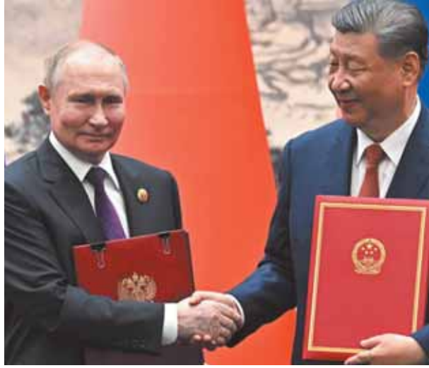
Chinese President Xi Jinping, right, and Russian President Vladimir Putin attend a signing ceremony in Beijing, China, on Thursday.

Chinese President Xi Jinping on Thursday hinted at a political settlement to end the Ukraine war, saying he expects peace and stability will return to the European continent, shortly after his talks with Russian counterpart Vladimir Putin as the two leaders vowed to counter any attempt by the US to hinder their strategic ties. Xi said at a joint press conference with Putin after their talks. A joint statement issued after Putin-Xi talks said that both sides believe that for "a sustainable settlement of the Ukrainian crisis, it is necessary to eliminate its root causes." In a veiled criticism of the US, which is pressuring Beijing to end its strategic ties with Russia, the joint statement said relations between China and Russia do not target any third countries, therefore they will counter any attempts to hinder such cooperation. "The two sides note that the relationship between Russia and China has progressed to a more advanced interstate cooperation compared to the mili-