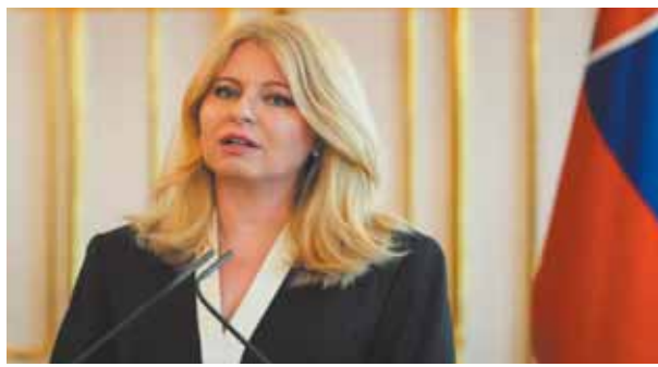
Slovakia's incumbent President Zuzana Caputova speaks during joint press statements with President elect Peter Pellegrini at the presidential palace in Bratislava, Slovakia, on Thursday. Slovak Prime Minister Robert Fico was in serious but stable condition Thursday, a hospital official said, after the populist leader was shot multiple times in an assassination attempt.