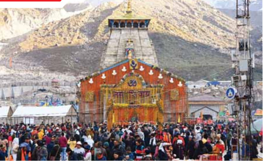
Devotees at the Kedarnath temple during the 'Char Dham Yatra,' in Rudrapurag