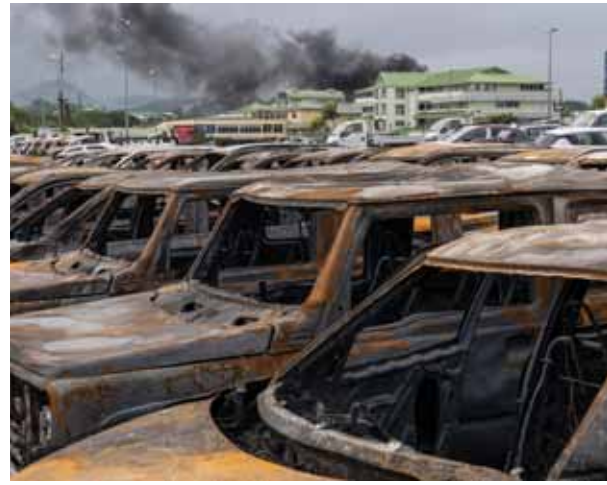
Burnt cars are lined up after unrest in Noumea, New Caledonia, Wednesday. France has imposed a state of emergency in the French Pacific territory of New Caledonia.