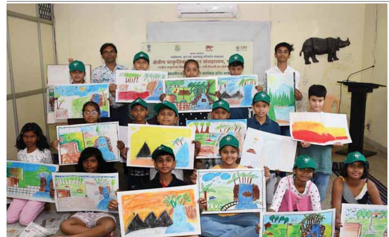
Students take part in a painting workshop during the Summer Nature Study Programme, at the Regional Museum of Natural History in Bhopal on Thursday.

monsoon. After this, La Nina conditions are likely to develop in the second half of the monsoon. Hail-rain alert has been issued in many districts of Madhya Pradesh in the next few hours. The Meteorological Department has predicted the possibility of lightning and winds blowing at a speed of 70 kilometers per hour. The weather is expected to change in more than 12 districts including Indore, Ujjain and Ratlam. According to the Meteorological Department, lightning may occur in Betul, South Jabalpur, Seoni, Chhindwara, Pandhurna and Mandla. The weather may also change in Burhanpur, Narmadapuram's Pachmarhi, Raisen, Indore, Dhar, Barwani, South Khargone, Ujjain, Ratlam, Jhabua, South Narsinghpur, Balaghat and Dindori districts. Earlier, it rained in Ratlam on Wednesday.