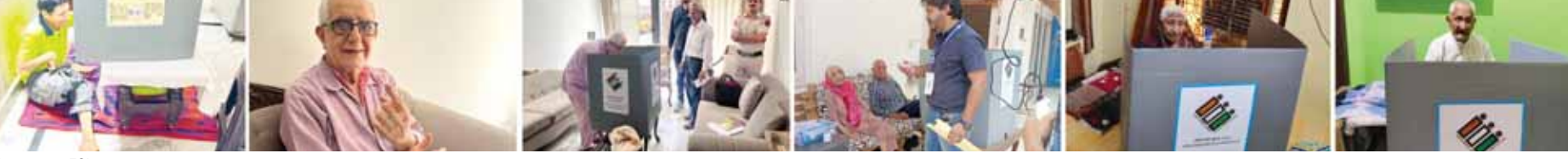
Despite the EC's best efforts to engage the elderly and specially-abled, along with all other eligible voters, the polling so far has not seen a significant increase in voter turnout