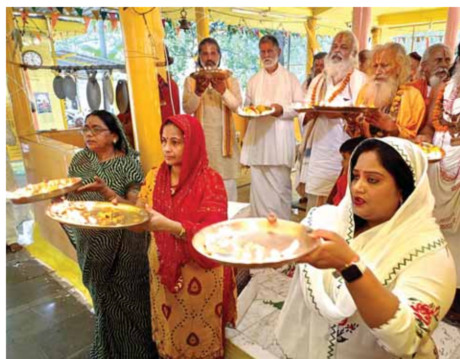
Priests and devotees offer prayers to Goddess Baglamukhi on the occasion of Maat Baglamukhi Jayanti in Bhopal on Thursday.

during the summers of 2024. On the other hand, in BYPL area of East and Central Delhi, the peak power demand, which had reached 1670MW and 1752 MW during the summers of 2023 and 2022 respectively, is expected to touch around 1857 MW this year.