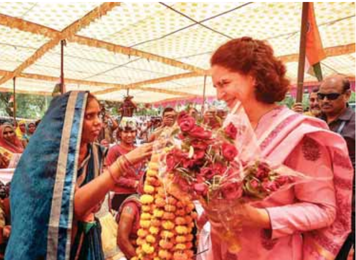
RAEBARELI PIONEER NEWS SERVICE

Congress leader Priyanka Gandhi Vadra, who has been canvassing continuously every day in Amethi and Rae Bareilly simultaneously, is highlighting the strong bond of the Gandhi family with both constituencies since the days of former Prime Ministers Indira Gandhi and Rajiv Gandhi. This effort comes as her sibling Rahul Gandhi contests in Amethi, having taken over from his mother, Sonia Gandhi. Priyanka said the grand old party follows the ideals of Mahatma Gandhi who uttered "Hey Ram" before dying and former Prime Minister Narendra Modi is wrong in accusing it of being anti-religion. She alleged that while the saffron party claims to be a "champion of Hindu religion," the condition of the State-run cowsheds in Uttar Pradesh remains pitiable. She accused the Modi Government of trying to take