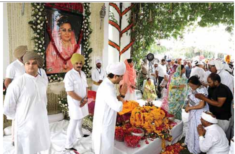
People pay last respects to the mortal remains of Rajmata Madhavi Rajee Scindia, mother of Union Minister Jyotiraditya Scindia at Jai Vilas Palace in Gwalior, Madhya Pradesh on Thursday.

Madhya Pradesh, 100 percent of the calls coming in at 1930 are being picked up, which shows the readiness of the police. DGP Sudhir Kumar Saxena told about the challenges faced by the police to control cyber crime. He said that the police face multiple challenges in the field of cyber. These challenges include adoption of new methods by criminals, high number of cyber crimes, geographical problems like accused committing crime in one district and fleeing to another district, lack of resources to control cyber crime, special training and district This includes lack of experts at the level etc. Apart from these, the biggest challenge is to know how help can be provided to the victim quickly. It is necessary to overcome these challenges. He said that lack of knowledge among the victims is also a big problem, even many policemen do not fully know what to do to control cyber crime, for this it is necessary that all the officers stay on the same platform and know. What to do actively? He said that it is necessary to take such training to the lower level by all the SPs of the district so that the common people suffering from cyber crime can feel relieved.