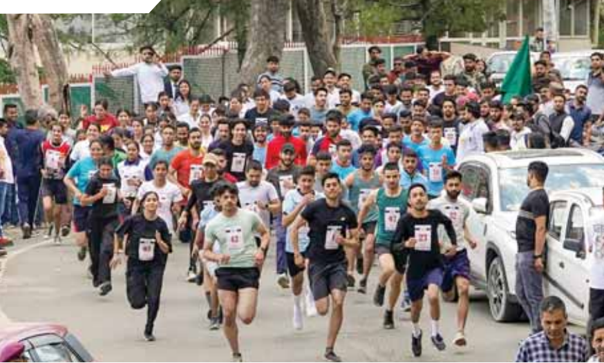
Participants at the 'Run For Vote' marathon for the Lok Sabha election awareness, in Shimla