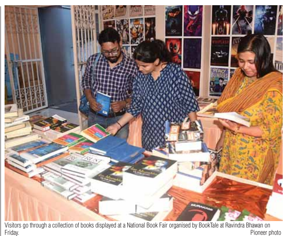
Visitors go through a collection of books displayed at a National Book Fair organised by BookTale at Ravindra Bhawan on Friday.

pany" as contemplated under section 70 of the PMLA. As Arvind Kejriwal was "in-charge of and responsible" for the said company, AAP during the time of offence, he and his party "shall be deemed guilty" of offences mentioned under the anti-money laundering law and liable to be prosecuted and punished, it had said. Earlier, Additional Solicitor General (ASG), SV Raju informed this Supreme Court during the hearing in AAP leader and Delhi Chief Minister Arvind Kejriwal's petition challenging his arrest by the ED, that Kejriwal and his party has been made accused in the excise policy case. After the ED's argument, the Supreme Court on Friday reserved its verdict in Kejriwal's petition challenging his arrest by the Enforcement Directorate (ED) in the Delhi Excise Policy case.