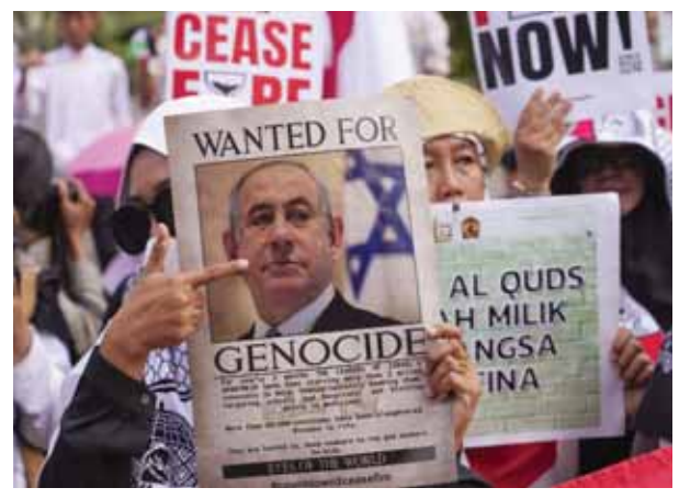
A protester holds a poster of Israeli Prime Minister Benjamin Netanyahu during a rally commemorating the 76th anniversary of the mass expulsion of the Palestinians from what is now Israel in 1948, often called the "Nakba" or Arabic for catastrophe, outside the U.S. Embassy in Jakarta, Indonesia on Friday.

Israel strongly denied charges of genocide on Friday, telling the United Nations' top court it was doing everything it could to protect the civilian population during its military operation in Gaza. The International Court of Justice wrapped up a third round of hearings on emergency measures requested by South Africa, which says Israel's military incursion in the southern city of Rafah threatens the "very survival of Palestinians in Gaza" and has asked the court to order a cease-fire. Tamar Kaplan-Tourgeman, one of Israel's legal team, defended the country's conduct, saying it had allowed in fuel and medication to the beleaguered enclave. "Israel takes extraordinary measures in order to minimize the harm to civilians in Gaza," she told The Hague-based court. A protester shouting "Liars" briefly interrupted Kaplan-