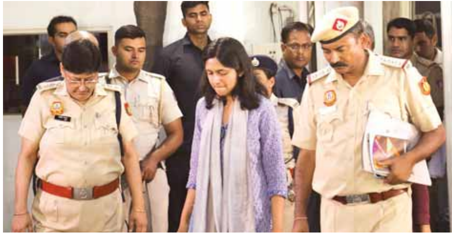
Aam Aadmi Party (AAP) Rajya Sabha MP Swati Maliwal leaves Delhi Chief Minister Arvind Kejriwal's residence at Civil Lines, in New Delhi, on Friday. The Delhi Police on Friday took Maliwal to the CM's residence to recreate the crime scene as it investigates the alleged assault on her there earlier this week, officials said