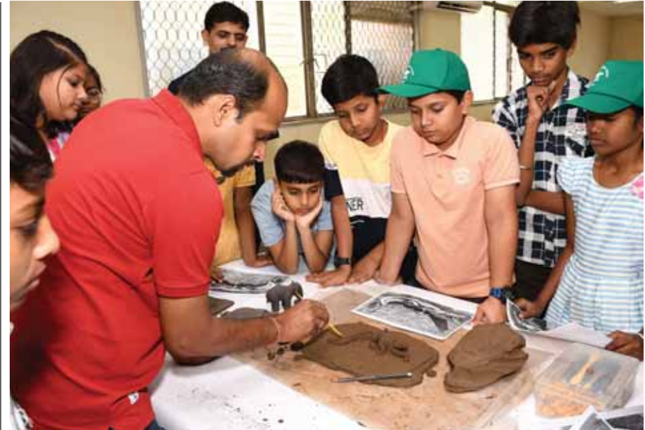
Participants take part in an animal clay model making workshop during summer nature study camp at Regional Museum of Natural History in Bhopal on Friday.