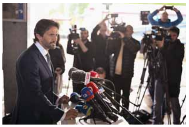
Deputy Prime Minister and Defence Minister of Slovakia Robert Kalinak speaks during a media briefing outside the F. D. Roosevelt University Hospital, where Slovak Prime Minister Robert Fico, who was shot and injured on May 15, is treated, in Banska Bystrica, central Slovakia, Friday.