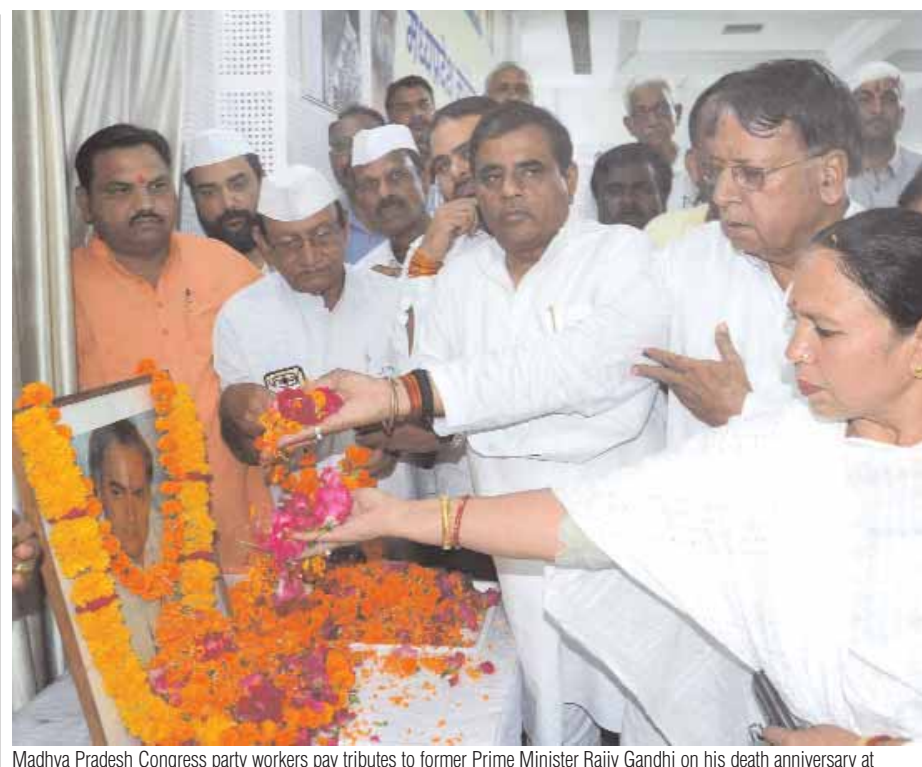
Madhya Pradesh Congress party workers pay tributes to former Prime Minister Rajiv Gandhi on his death anniversary at MPCC headquarters in Bhopal on Tuesday.

INDIA alliance is moving towards giving a clean and stable government to the country." Attacking Shah, he said, "The people of Punjab have formed the government by giving us 92 out of 117 seats, are the people of Punjab Pakistanis? The people of Gujarat gave us 14% votes, are the people of Gujarat also Pakistanis? The people of Goa gave us love, trust, are the people of Goa also Pakistanis? In the Panchayat elections, Municipality elections, in Uttar Pradesh, Assam, Madhya Pradesh and many parts of the country, the Aam Aadmi Party's Panch, Sarpanch, Municipal Mayors, Councillors were elected everywhere, are all the people of this country Pakistanis? What are you saying?"