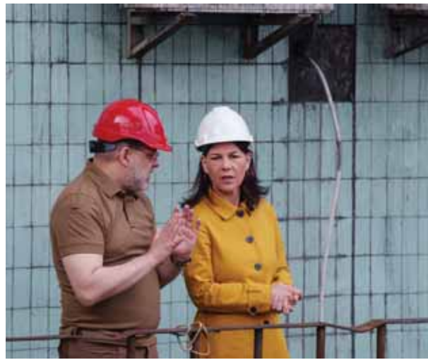
Germany's Foreign Minister Annalena Baerbock speaks to Ukrainian Energy Minister Herman Halushchenko during official visit to a thermal power plant which was destroyed by a Russian rocket attack in Ukraine, Tuesday.

AP ■ KYIV Germany's foreign minister arrived in Kyiv on Tuesday in the latest public display of support for Ukraine by its Western partners, although deliveries of promised weapons and ammunition from NATO countries like Germany have been slow and have left Ukraine vulnerable to a recent Russian push along parts of the front line. Annalena Baerbock renewed Berlin's calls for partners to send more air defense systems, as Russia pounds Ukraine with missiles, glide bombs and rockets. Germany is the second-biggest supplier of military aid to Ukraine after the United States. Ukraine's depleted troops are trying to hold off a fierce Russian offensive along the eastern border in one of the most critical phases of the war, which is stretching into its third year. Germany recently pledged a third US-made Patriot battery for Ukraine, but Kyiv officials say they are still facing an alarming shortfall of air defenses against the Russian onslaught. The Kremlin's forces have used their advantage in the skies to debilitate Ukraine's power grid, hoping to sap Ukrainian morale