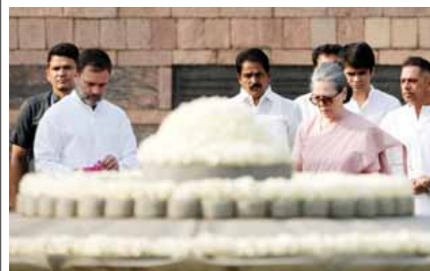
Congress leaders Sonia Gandhi and Rahul Gandhi pay tributes to former Prime Minister Rajiv Gandhi on his death anniversary at Veer Bhumi, in New Delhi, on Tuesday