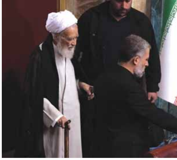
Ayatollah Mohammad Ali Mowahedi Kermani arrives to attend the first session of Assembly of Experts after an election that decided the new assembly, in Tehran, Iran, Tuesday. Under Iranian constitution the 86-member all-cleric assembly has the right to monitor the performance of supreme leader, and choosing or dismissing him. Mowahedi Kermani was picked Tuesday as head of the assembly.

On Wednesday, a funeral presided over by Khamenei will then turn into a procession