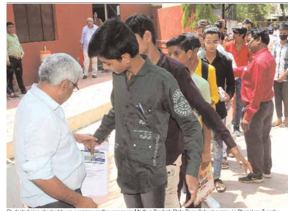
Students being checked by an examiner as they appear in Madhya Pradesh State Open School exams, in Bhopal on Tuesday.