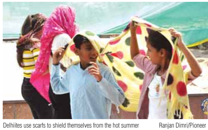
Delhiites use scarfs to shield themselves from the hot summer

The intense heatwave is playing a spoiler for the rallies and roadshows of top political leaders cutting across party lines. The BJP and its star campaigners are holding rallies and roadshows in the evening. The AAP convener