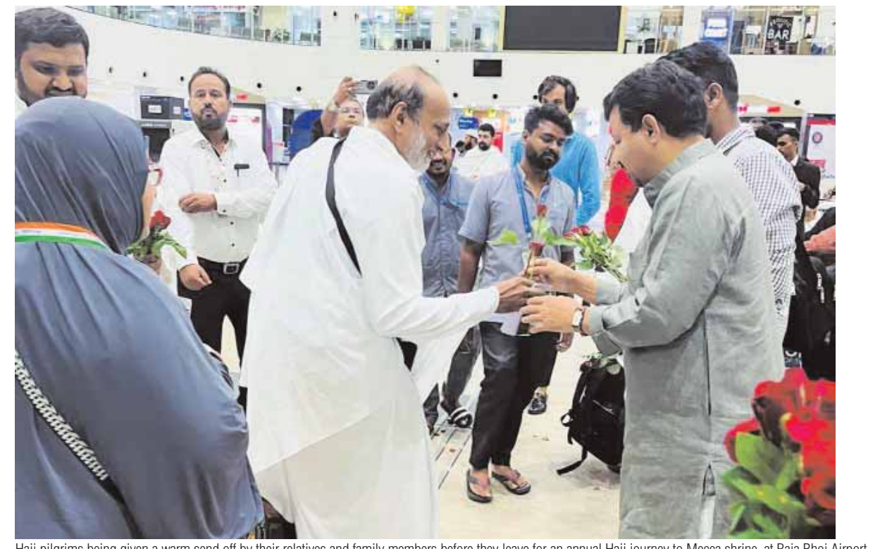
Haj pilgrims being given a warm send off by their relatives and family members before they leave for an annual Hajj journey to Mecca shrine, at Raja Bhoj Airport in Bhopal on Tuesday.