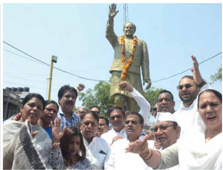
Madhya Pradesh Congress party workers pay tributes to former Prime Minister Rajiv Gandhi on his death anniversary in Bhopal on Tuesday.

at this speed. Which is being considered a big success. Bhopal Metro has a 6.22 km long priority corridor. There are plans to start the commercial run in the next few months. After this, when you enter the station to travel in the metro train, you will see the same picture which is inside an airport. There will also be a food plaza and some shops inside. From where you will be able to buy food and other essential items. Metro Rail Corporation has also started preparations for this. Plans are being prepared through experts. Similar plans will be made for Indore metro stations also. The priority corridor of Metro is between Subhash Nagar to AIIMS. Five stations - RKMP, Subhash Nagar, Central School, in front of DB and MP Nagar - have been completed up to 90 percent.