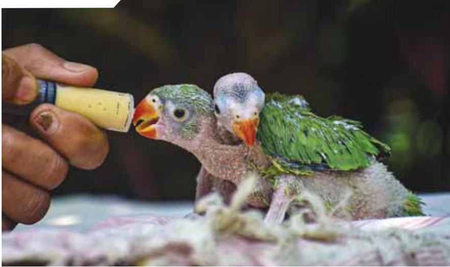
A man feeds a parrot's chick that fell off a tree, in Guwahati

Delhi's Chief Minister, Arvind Kejriwal, has overcome numerous obstacles in the past decade. Yet, his unwavering resilience has been a beacon of inspiration. He and his party are currently facing the biggest crisis in the liquor policy case.