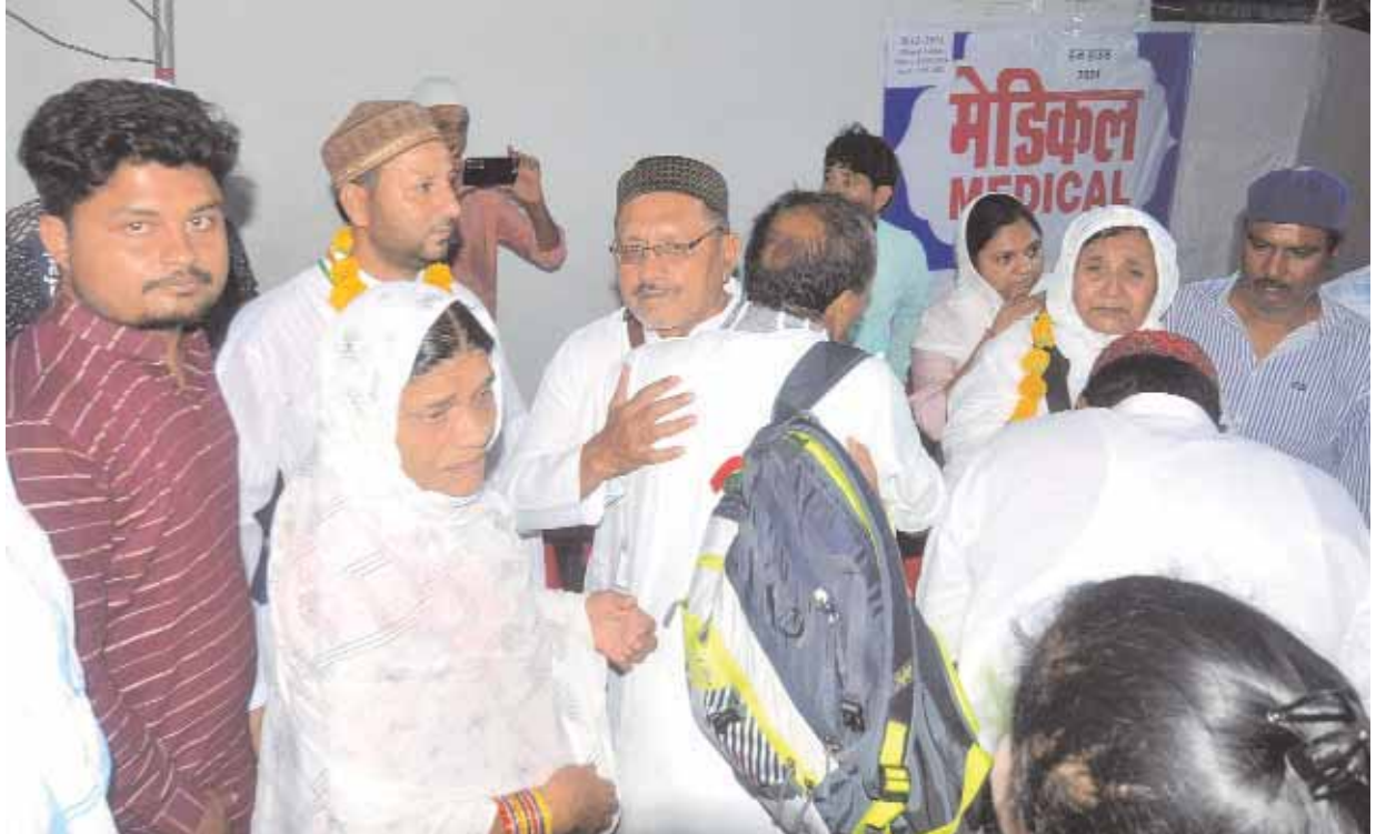
Hajji pilgrims being given a warm send off by their relatives and family members before they leave for an annual Hajj journey to Mecca shrine, at State Haj House in Bhopal on Wednesday.