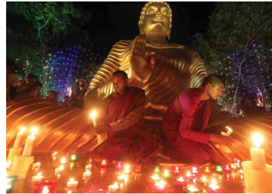
Buddhist monks light lamps on the eve of Buddha Jayanti at Maitreya Buddha Vihar in Bhopal on Wednesday.