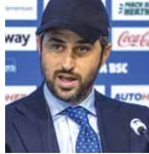
Image rights are part of the payment for footballers.

Vasco executives have said the payment of wages is up to date for all players.