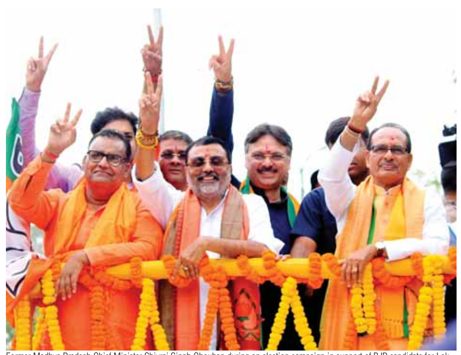
Former Madhya Pradesh Chief Minister Shri Raj Singh Chouhan during an election campaign in support of BJP candidate for Lok Sabha elections in Jharkhand on Wednesday.

Maheshwar of Khargone district, people are flocking to the banks of Narmada as the evening approaches. Getting relief from the heat by taking a bath in the river. The temperature of Jabalpur has been reaching beyond 42 degrees for the last three days, in such a situation, Jabalpur Municipal Corporation has taken initiative to provide relief to the people of Jabalpur. Defogger machines are being run at major intersections of the city. People are being provided coolness through artificial rain i.e. water fogging. In Ratlam's Alot, Shri Govardhan Gausghala is spraying water on the cows to save them from the heat. There are about 470 cows in the cowshed. There is severe heat in the area. The temperature here has been above 43 degrees for three days.