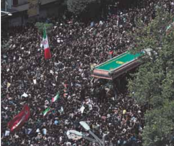
Iransians follow a truck carrying coffins of the late President Ebrahim Raisi and his companions who were killed in a helicopter crash on Sunday in a mountainous region of the country's northwest, during a funeral ceremony for them in Tehran, Iran, Wednesday.

Iran's Shiite theocracy views mass demonstrations as crucial evidence of its legitimacy and the people's support. Still, Wednesday's funeral service for President Ebrahim Raisi and others saw a turnout that onlookers described as noticeably lower than the 2020 procession honouring Revolutionary Guard general Qassem Soleimani, who was killed in a US drone strike in Baghdad. Many of the participants said they came to Tehran for the ceremony from other cities and towns across the Islamic Republic, an indication of how those in Iran's capital viewed Raisi, who won the presidency in a record low turnout and later oversaw repeated crackdowns on all dissent — including in the