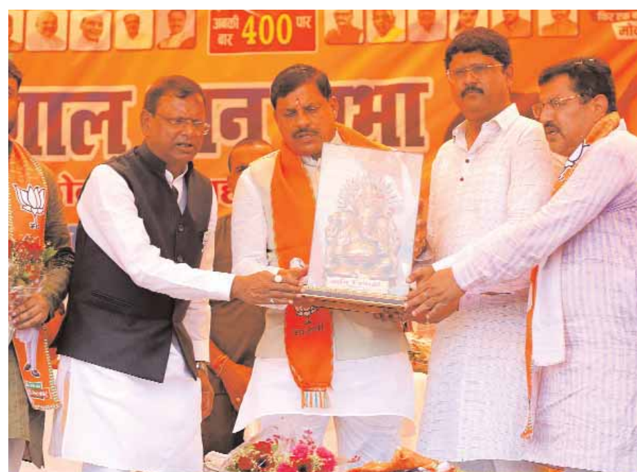
Madhya Pradesh Chief Minister Mohan Yadav during an election campaign in support of BJP candidate Pankaj Choudhary in Maharajganj Lok Sabha constituency Uttar Pradesh on Wednesday.

pening. New scams came to light one after the other. The condition of the entire country was bad. The country's economy had completely collapsed. He was the Prime Minister of the country who was an expert in economics, but Sonia Gandhi was running the government from behind the scenes.