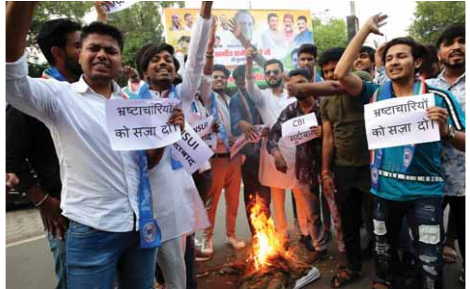
NSUI activists burn an effigy of CBI during a demonstration against the state's nursing college scam, at PCC headquarters in Bhopal on Wednesday.