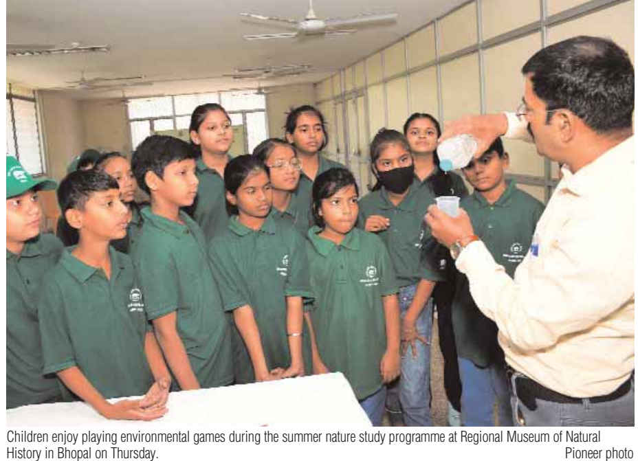
Children enjoy playing environmental games during the summer nature study programme at Regional Museum of Natural History in Bhopal on Thursday.

to snatch away OBC reservation and give it to a particular class just for your vote bank. In a strong slap on Mamata Banerjee's vote bank politics in West Bengal, the Calcutta High Court has decided to cancel all the OBC certificates issued after 2010. He said that as soon as she assumed power, Mamata Banerjee, playing vote bank politics, issued OBC certificates to Bangladeshis and Rohingyas, without following any rule, included 118 castes in OBC and also issued OBC certificates to minorities. The Calcutta High Court has decided to cancel it, calling it unconstitutional. Chouhan said that the truth of Mamata Banerjee, who only does vote bank politics, has been exposed before the public.