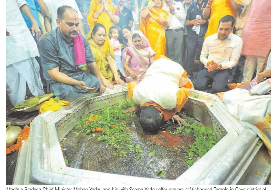
Madhya Pradesh Chief Minister Mohan Yadav and his wife Seema Yadav offer prayers at Vishnupad Temple in Gaya district of Bihar on Thursday.