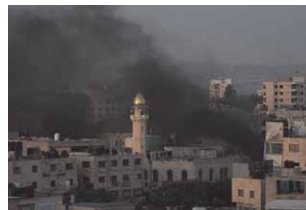
Black smokes rise to the sky during clashes between Israeli forces and Palestinian demonstrators in the West Bank city of Jenin, Wednesday.