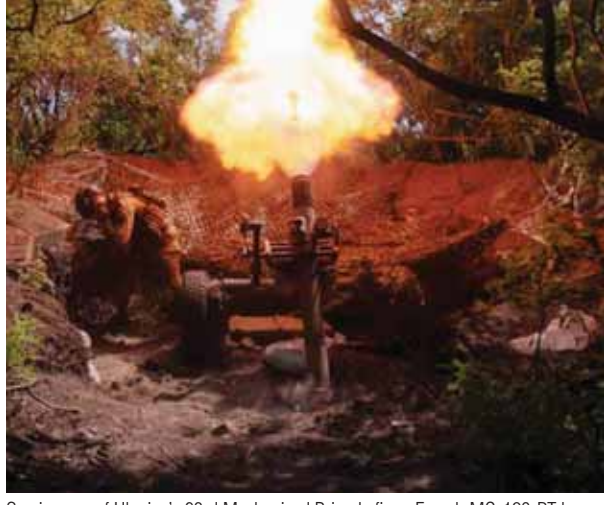
Servicemen of Ukraine's 93rd Mechanised Brigade fire a French MO-120-RT heavy mortar at the Russian forces on the front line near the city of Bakhmut in Ukraine's Donetsk region on Wednesday.

The city of Kharkiv, which is the capital of the region of the same