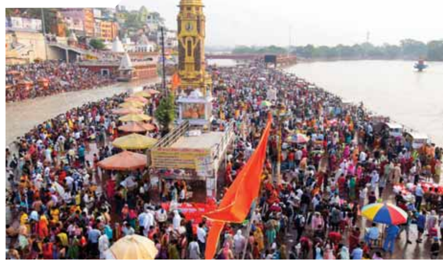
Devotees at Har Ki Pauri on the occasion of Buddha Purnima, in Haridwar