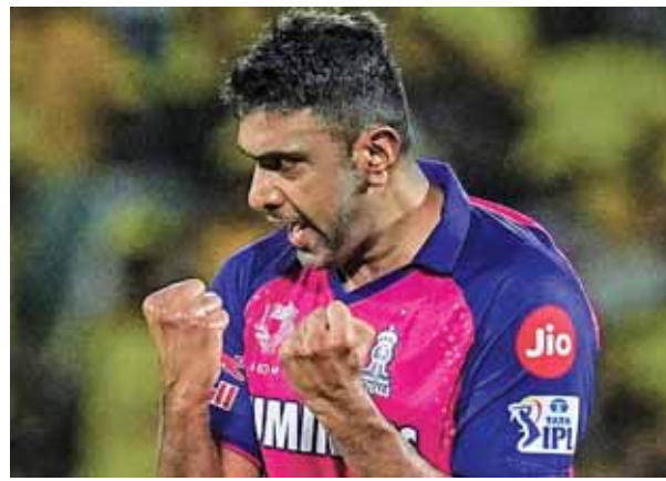
Mushtaq Ali Trophy domestic T20s. The BCCI secretary Jay Shah recently said the impact player rule was implemented on a 'test case' basis and is not

IPL Eliminator, here on Wednesday. "In my opinion, batters have more confidence and pitches everywhere have been standardised." "In the future, all bowlers will need to be hitters because we know that no matter how well we bowl, we also need to be able to bat. The game is headed in that direction," he said. While Indian captain Rohit Sharma has criticised the rule, arguing that it hampers the development of all-rounders in the country, star batter Virat Kohli has opined that it disrupts the balance of the game. The rule was formally adopted in the 2023 edition of the IPL after a trial in the Syed