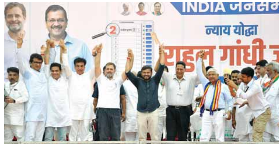
Congress leader Rahul Gandhi with party leader and INDIA Bloc Lok Sabha candidate from North East Delhi constituency Kanhaiya Kumar during a public meeting at Dilshad Garden in New Delhi on Thursday.

Just days before the Lok Sabha elections in Delhi, Congress leader Rahul Gandhi rode the Delhi Metro on Thursday to connect with voters. Congress candidate from North East Delhi, Kanhaiya Kumar, shared photos of Rahul interacting and posing with passengers. En route to a rally in Mangolpuri with Kumar on the last day of campaigning, Rahul engaged with commuters. Delhi will vote on May 25 under Phase VI. Speaking at an election meeting at the DDA ground, GTB Nagar, Dilshad Garden in northeast Delhi, Rahul said the BJP always wanted to "tear and throw away" the Constitution, and asserted that the Lok Sabha elections this time is a fight to safeguard it. Thursday was the last day of campaigning for the seven Lok Sabha seats in Delhi. This is Rahul's second rally in Delhi where he notably avoided mentioning Arvind Kejriwal's AAP, despite their alliance with Congress in the region. The Congress has fielded former JNU Student Union president Kanhaiya Kumar, who is locked in a fierce contest against BJP's Manoj Tiwari for the Northeast Delhi Lok Sabha seat. Earlier in the day, former