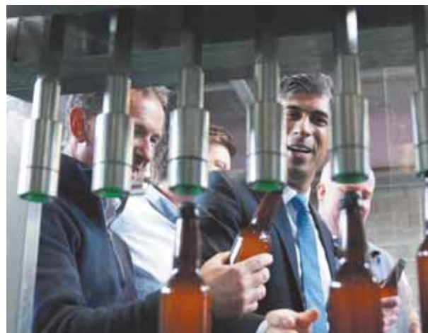
Britain's Prime Minister Rishi Sunak, centre, watch beer being bottled at the Vale of Glamorgan Brewery, in Barry, south Wales, while on the General Election campaign trail, Thursday.