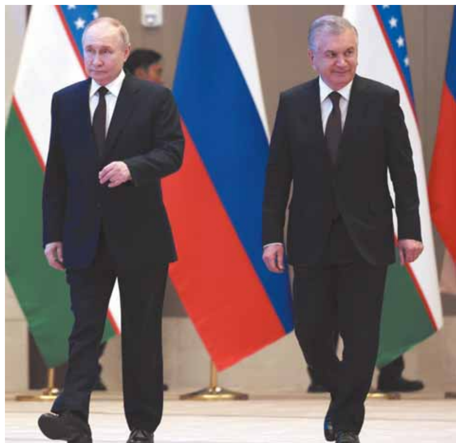
Russian President Vladimir Putin, left, and Uzbek President Shavkat Mirziyoyev arrive to attend a meeting of the Council of Regions of Uzbekistan and Russia in Tashkent, Uzbekistan, Monday.

qualification of the party supremo and his elder brother Nawaz Sharif from the PM Office. Shehbaz, 72, said that it was time for the latter to "resume his rightful place as the president of the Pakistan Muslim League-Nawaz party." The February 8 general elections had delivered a fractured mandate and the PML-N did not get a clear majority. It joined hands with the Pakistan Peoples Party (PPP) led by Bilawal Zardari Bhutto and other smaller parties to form the government at the federal level when Nawaz relinquished the post of prime minister in favour of Shehbaz. Much before that, in 2017, Nawaz had stepped down as the country's prime minister after the Supreme Court disqualified him for life from holding public office for not declaring a receivable salary. Following his trial in the Panama Papers case, the apex court, in February 2018, disqualified the PML-N supremo as the party's president.