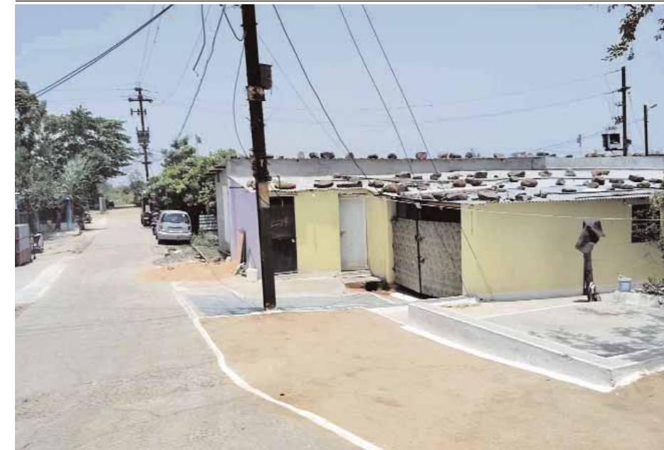
A deserted view nearby locality of SoS Balgram children's village where a Tiger was spotted by the villagers in Bhopal on Tuesday.