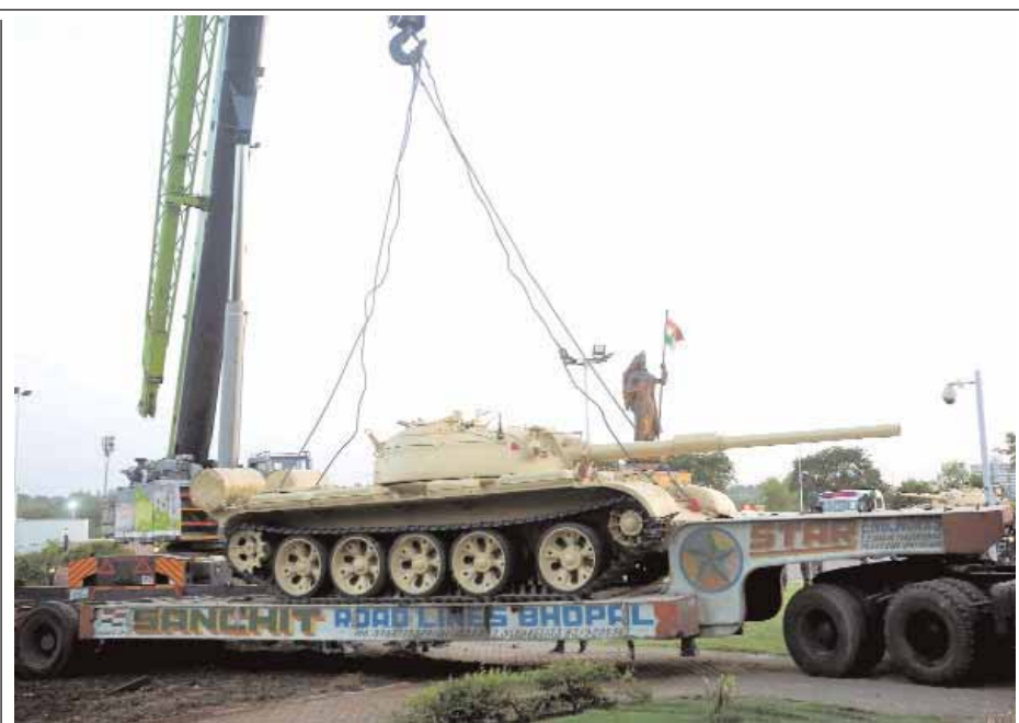
An Indian army war tank is being lifted by a crane to be installed at Shaurya Smarak to view for the public, in Bhopal on Tuesday.