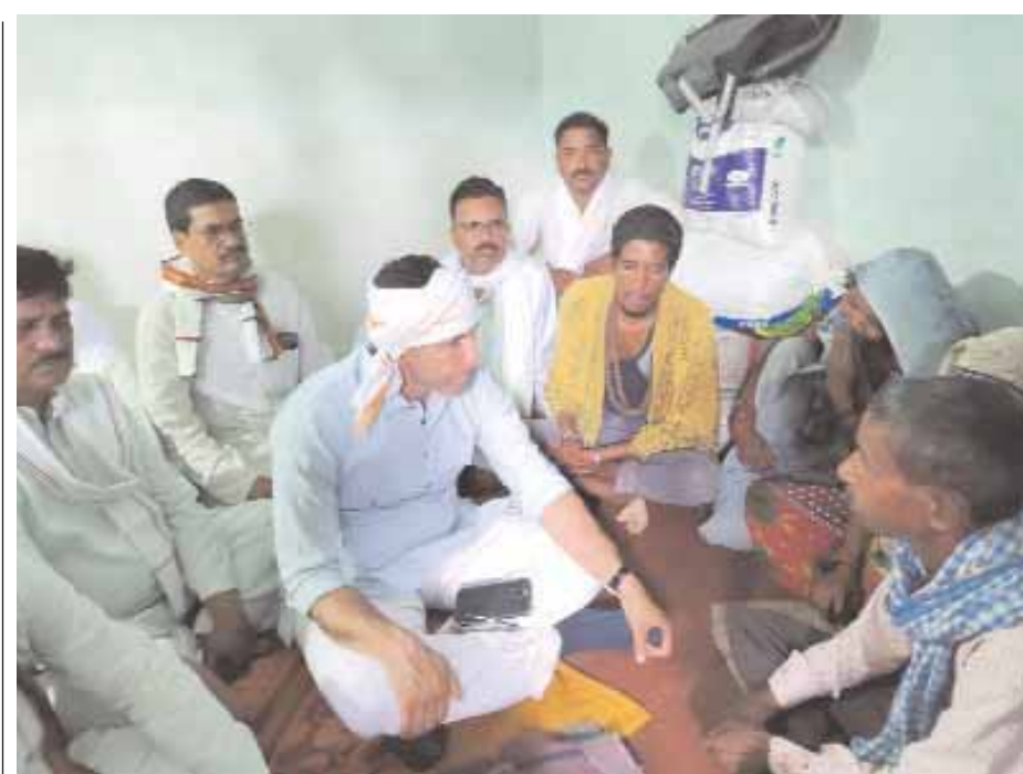
Congress State President Jitu Patwari visits the family members of a Dalit who was killed in Barodiya, Nounagir Sagar district Madhya Pradesh on Tuesday.

Art and Commerce College, Gwalior, Government Polytechnic College, Datia, Shrimant Madhavrao Scindia Government Post Graduate College, Shivpuri, Government Post Graduate College, Guna, Law College, Ashoknagar, Government Indira Gandhi Engineering College, Sagar, Government Polytechnic College, New Campus Tikamgarh, Amar Shaheed Chandrashekhar Azad Government Post Graduate College, Niwari, Government Higher Secondary Excellence School No. 1, Chhatarpur, Government Polytechnic College, Damoh, Government Polytechnic College Panna, Government Excellent Higher Secondary School Vyankat No. 1, Satna, Government Engineering College, and other places.