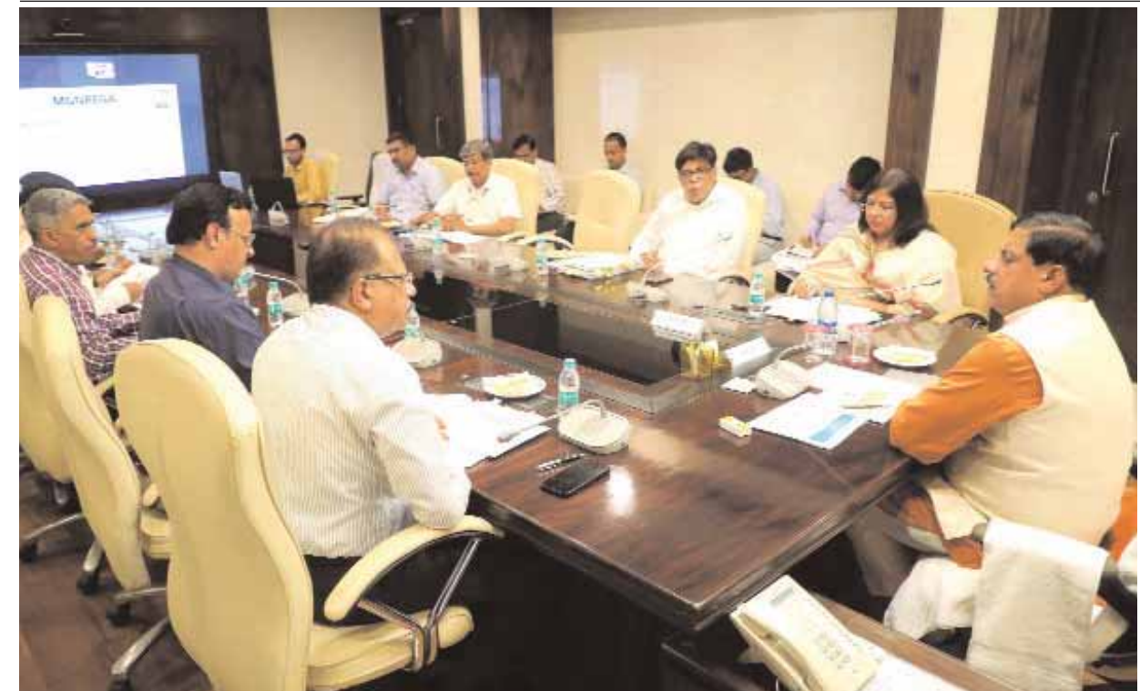
Madhya Pradesh Chief Minister Mohan Yadav reviews a meeting of the state government officials ahead of the water conservation campaign scheduled from June 05, at State Mantralaya in Bhopal on Tuesday.