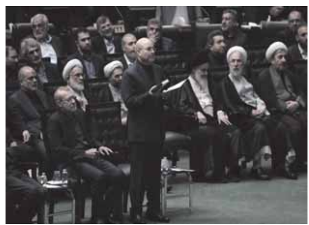
Mohammad Bagher Qalibaf, center, takes an oath during the opening ceremony of the new parliament term in Tehran, Iran.

Iran's parliament re-elected hard-liner Mohammad Bagher Qalibaf on Tuesday as its speaker, reaffirming its hard-right makeup in the wake of a helicopter crash that killed the country's president and foreign minister. Of 287 lawmakers voting, 198 backed Qalibaf to retain the position he first took in 2021. He initially became speaker following a string of failed presidential bids and 12 years as the leader of Iran's capital city, in which he built onto Tehran's subway and supported the construction of modern high-rises. Many, however, know Qalibaf for his support, as a Revolutionary Guard general, for a violent crackdown on Iranian university students in 1999. He also reportedly ordered live gunfire to be used against Iranian students in 2003 while serving as the country's police chief. In Tuesday's