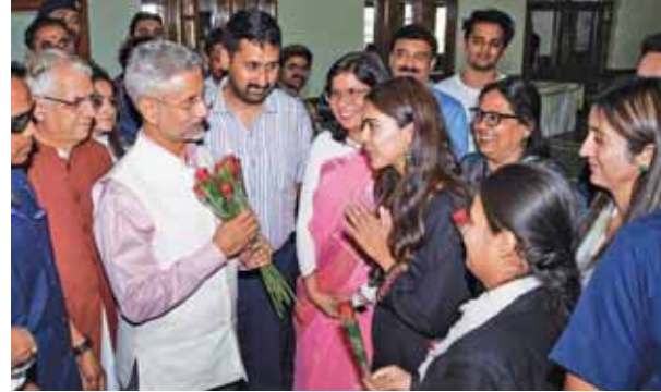
External Affairs Minister S. Jaishankar during a discussion on 'Viksit Bharat @2047', in Shimla, Tuesday

China is constructing roads, bridges and model village at the border on the land it took in 1962 and had made a road to Siachen with the coordination of Pakistan and India has also deployed forces,