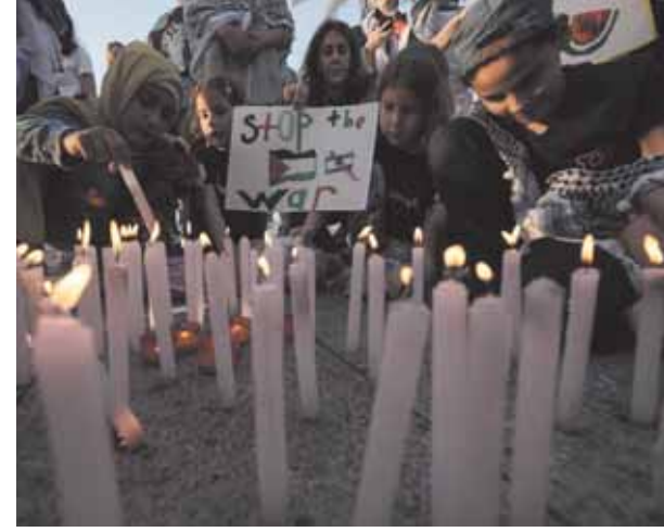
Children light candles during a march against Israel and in solidarity with Palestinians in the southern Gaza city of Rafah, on the Mediterranean Sea corniche in Beirut, Lebanon, Monday. Israeli Prime Minister Benjamin Netanyahu acknowledged Monday that a "tragic mistake" had been made after an Israeli strike in the southern Gaza city of Rafah set fire to a tent camp housing displaced Palestinians and killed at least 45 people, according to local officials.