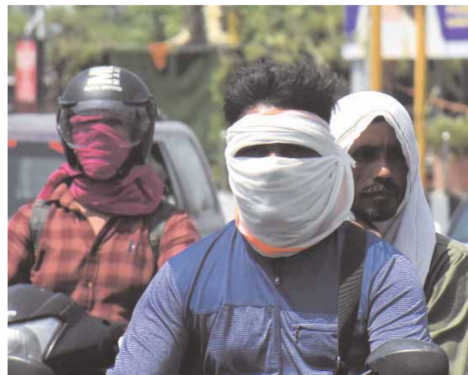
Commuters travel on the road amid intense heat waves in Bhopal on Tuesday.

Associate Professor in the Department of AIIMS Medicine, says that generally the symptoms of heat stroke include nausea or nervousness. In severe conditions, foaming comes out of the mouth along with shock. On Tuesday, the fourth day of Nautapa, the temperature was recorded at 43.6 degrees Celsius at 2.30 pm. This is lower than the temperature of 44 degrees Celsius recorded at the same time (2.30 pm) on Monday. At the same time, Sunday, the second day of Nautapa, had the highest temperature compared to all four days. On this day, a temperature of 44.8 degrees was recorded at 2.30 pm. On the other hand, on the first day at the same time i.e. at 2.30 pm the temperature was 42 degrees Celsius. Which is less than four days.