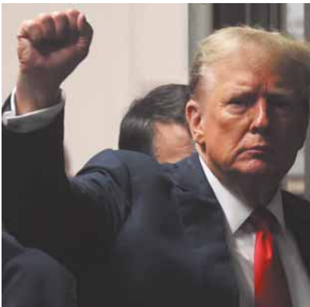
Former President Donald Trump reacts as he walking back into the courtroom after a break during closing arguments in his hush money trial at Manhattan criminal court in New York on Tuesday.