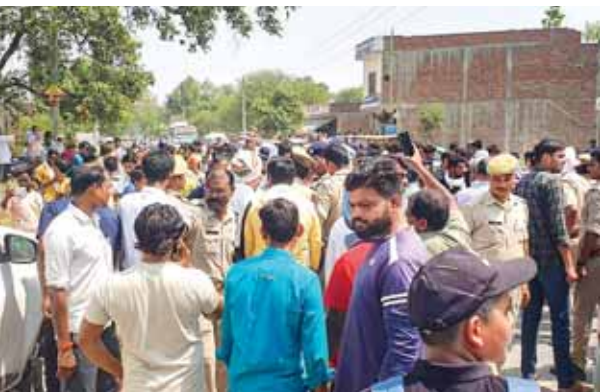
Police personnel and civilians near the escort vehicle, part of the convoy of Brij Bhushan Sharan Singh's son and BJP leader Karan Bhushan Singh, that allegedly hit a biker, in Gonda, on Wednesday. At least two people were killed in the accident, according to officials

The SIT is maintaining vigil at the Kempegowda Airport to arrest him as soon as he lands. The MP, who is seeking re-election as the NDA candidate from Hassan Lok Sabha segment, fled to a foreign country as soon as the news broke out that the Karnataka State Commission for Women requested Chief Minister Siddaramaiah to order an investigation into the huge cache of explicit videos showing several women being sexually assaulted allegedly by him.