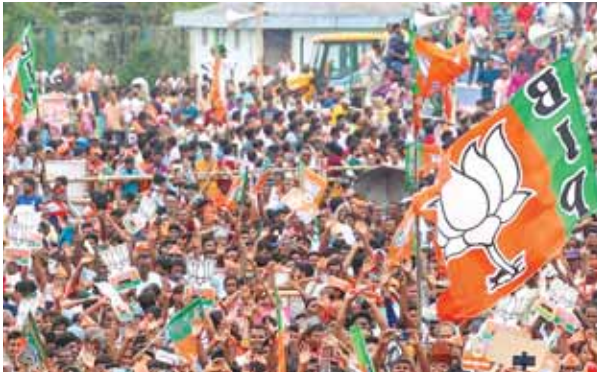
BJP supporters during Prime Minister Narendra Modi's campaign rally for Lok Sabha polls, in Mathurapur, West Bengal, on Wednesday

Interesting slogans ranged from "God of the Gods" to "Lord Jagannath" and Mujra, 'disco', 'Bhangra', 'Bharatnatyam' to Minimum Support Price (MSP) to farm loan waiver and Muslim appeasement dominated in