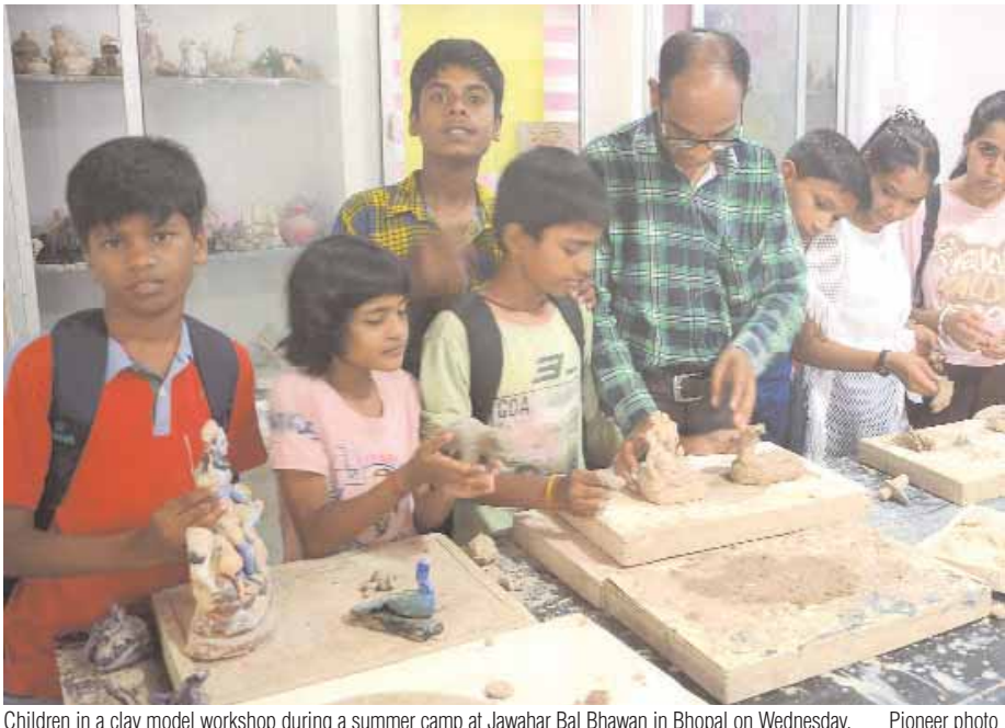
Children in a clay model workshop during a summer camp at Jawahar Bal Bhawan in Bhopal on Wednesday.