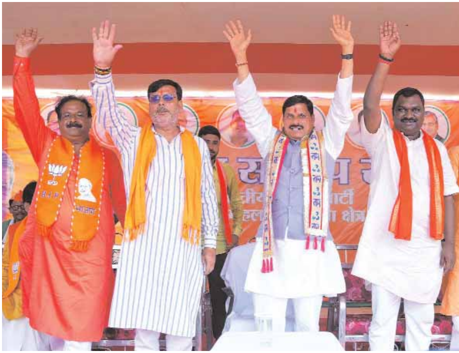
Madhya Pradesh Chief Minister Mohan Yadav during an election campaign in support of BJP candidate for Lok Sabha elections in Jharkhand on Wednesday.

dence. The British promoted western culture by removing gods and goddesses from our school-college curriculum. Lord Macaulay distanced us from our gods and goddesses, but after gaining independence in 1947, changes could have been made in the education policy, which the Congress did not do. They have also furthered the power of the British. After this, when BJP came to power under the leadership of Prime Minister Narendra Modi, a new education policy was introduced in 2020. We got an opportunity through Prime Minister Modi and included the incidents of our gods and goddesses in the curriculum. If we do not include the incidents of Lord Rama-Krishna, then how will we get the education and sanskar of good deeds.