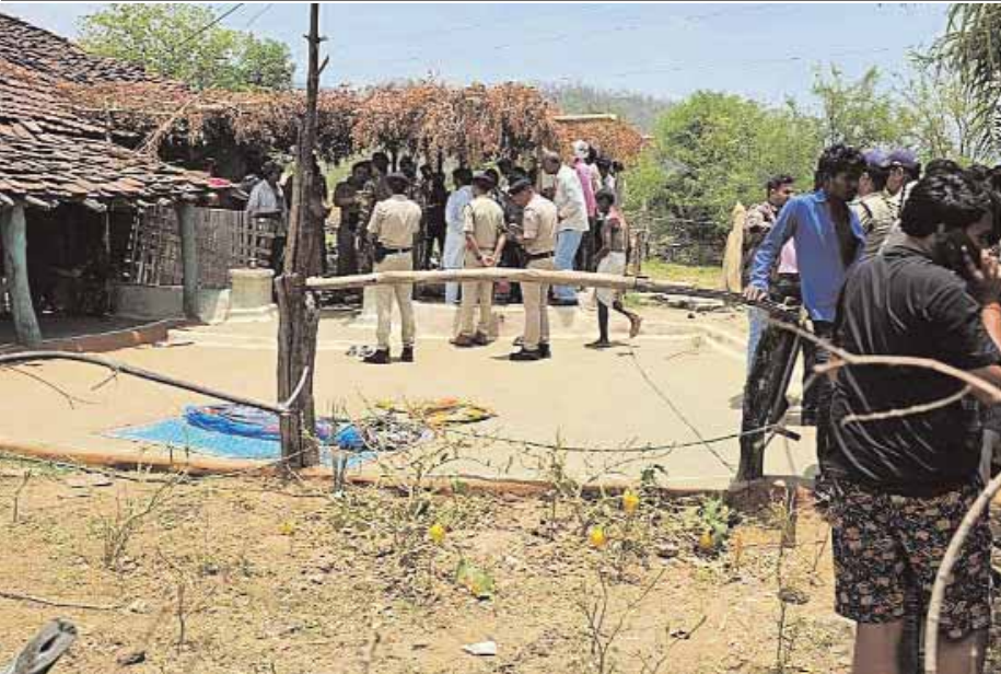
Police personnel investigate the crime scene as locals gather at the incident site after a man hacked to death eight members of his family with an axe and later died by suicide in tribal village of Bodal Kachhar, Chhindwara district Madhya Pradesh on Wednesday.