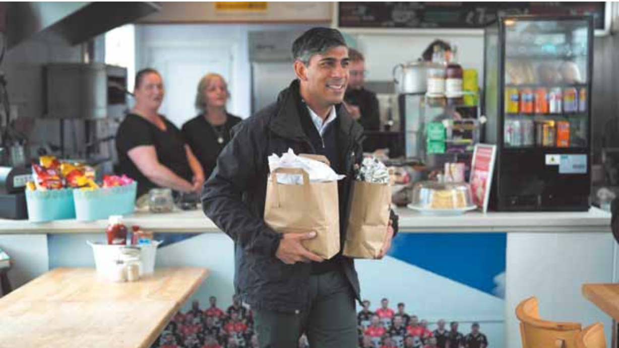
Britain's Prime Minister Rishi Sunak buys breakfast for the travelling media as he arrives at a railway station for a Conservative general election campaign event in the South West of England on Wednesday.

At least 28 people, including women and children, were killed on Wednesday in Pakistan after a speeding passenger bus veered off the road and fell into a ravine in the remote Balochistan province, according to media reports. The bus, heading from Turbat to Quetta, fell into the ravine near Washuk town, around 700 kilometres from Quetta, the capital of Balochistan province. The accident was a result of overspeeding, according to the report, which said that women and children were among the deceased. The accident took place after the tyre of the passenger bus burst, Geo News reported quoting rescue officials. About 22 people sustained injuries in the accident.