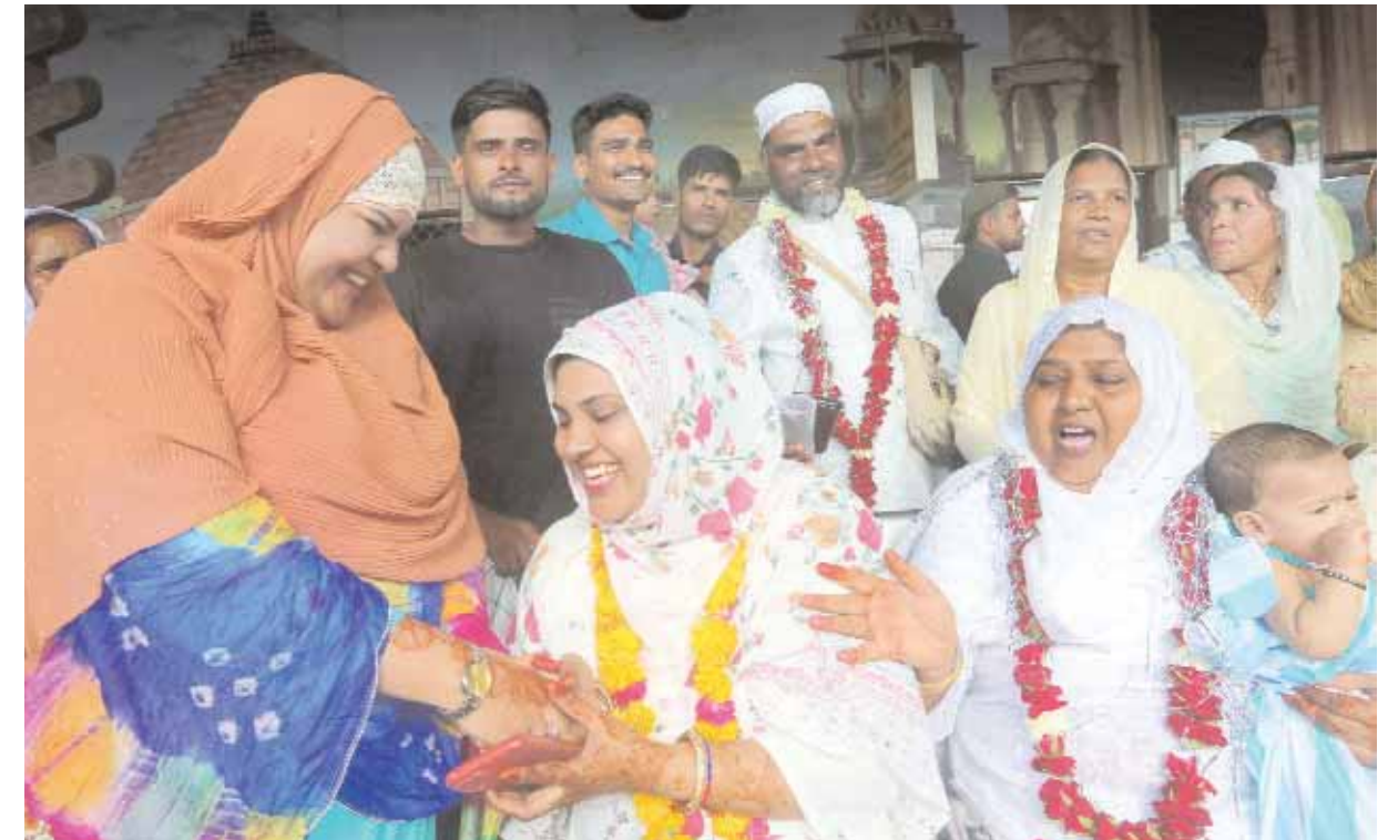
Hajj pilgrims being given a warm send off by their relatives and family members as they board a train to leave for an annual journey to Mecca shrine, at railway station in Bhopal on Thursday.