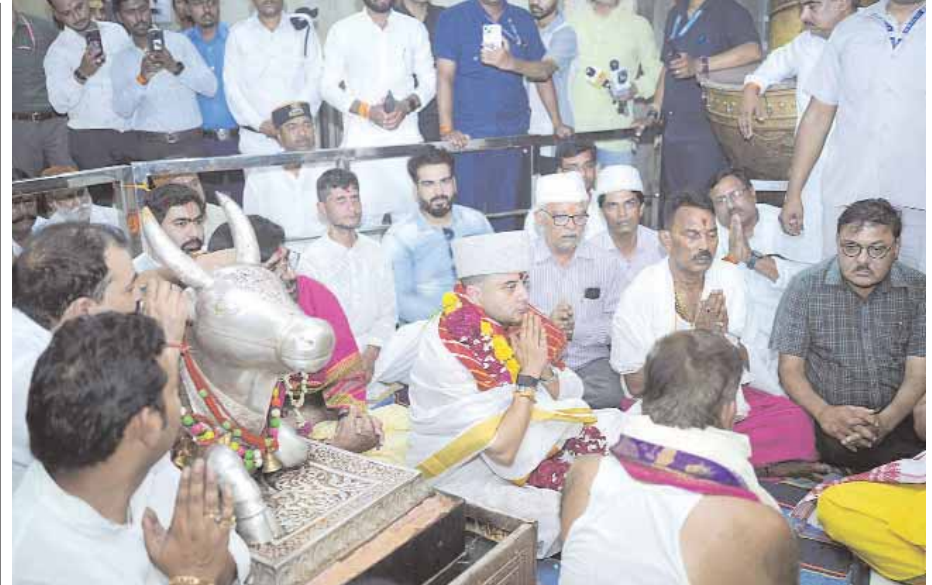
Union Minister for Civil Aviation Jyotiraditya Scindia offers prayer at Mahakaleswar temple in Ujjain, Madhya Pradesh on Thursday.