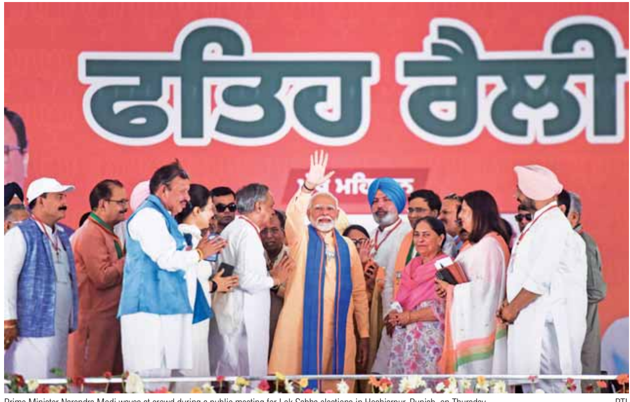
Prime Minister Narendra Modi waves at crowd during a public meeting for Lok Sabha elections in Hoshiarpur, Punjab, on Thursday

Prime Minister Narendra Modi ended his whirlwind Lok Sabha poll campaign with a rally in Punjab's Hoshiarpur on Thursday, closing out his electioneering the way he began — by focussing on a region where he has invested heavily over the years for the BJP to make a mark outside its strongholds. Modi notched up a total of 206 public-outreach programmes, including rallies and roadshows, since the Election Commission (EC) announced the poll schedule on March 16. The Prime Minister surpassed his nearly-145 public engagements on the stump during the 2019 polls by a big margin. The campaign period this time was of 76 days, compared to the 68 days in the polls held five years ago. When the EC announced the polls, Modi was on a political tour of southern India, covering all five states in the three days between March 15 and March 17. The Bharatiya Janata Party (BJP) is eyeing to boost its fortunes in Tamil Nadu, Kerala and Andhra Pradesh — three states where it won no seat in 2019 — and