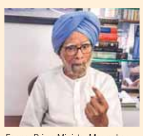
Former Prime Minister Manmohan Singh

Commission's direction of no appeal for votes on caste and religion. Earlier in an appeal to voters, particularly Punjab ahead of the seventh-phase of Lok Sabha polls on Saturday, Singh asserted that only the Congress can ensure growth-oriented progressive future where democracy and Constitution will be safeguarded. The senior Congress leader also hit out at the BJP Government for imposing an "ill-conceived" Agniveer scheme on the Armed forces. "The BJP thinks that the value of patriotism, bravery and service is only four years. This shows their fake nationalism," he said in a letter to voters of Punjab.