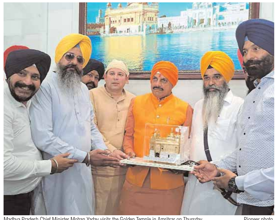
Madhya Pradesh Chief Minister Mohan Yadav visits the Golden Temple in Amritsar on Thursday.

not even gone to see Lord Shri Ram till now. Yadav said that when Narendra Modi got the first vote of the countrymen in 2014, he ended terrorism from the country. He taught a lesson to the enemy country Pakistan by entering its home. He did this work twice. When the second vote was cast, Article 370 was abolished from Kashmir, a law like triple talaq was implemented, a temple of Lord Shri Ram was built in Ayodhya and now he is smiling in the sanctum sanctorum. Earlier, one had to go by ship to visit Bhent Dwarka, but now a bridge has been built there and now one can go by one's own vehicle. This time the vote is to make India the number one country in the world and also to make Lord Krishna smile in Mathura.