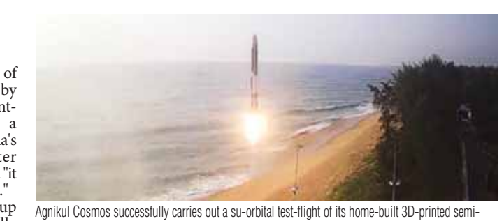
Agnikul Cosmos successfully carries out a su-orbital test-flight of its home-built 3D-printed semi-cryogenic rocket Agnibaan from its own launch pad at Sriharikota, on Thursday

Describing successful launch of a rocket Agnibaan powered by world's first single-piece 3D printed semi-cryogenic engine as a "momentous occasion" for India's space sector, Prime Minister Narendra Modi on Thursday said "it is a testament to our yuvashakti". Chennai-based space start-up Agnikul Cosmos successfully carried out a sub-orbital test-flight of its home-built 3D-printed semi-cryogenic rocket — Agnibaan — from its own launch pad at Sriharikota, making it India's second private entity to do so. Modi, in a post on X, said, "A remarkable feat which will make the entire nation proud!" "The