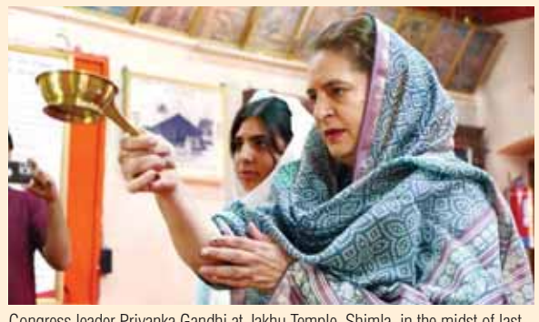
Congress leader Priyanka Gandhi at Jakhru Temple, Shimla, in the midst of last day of campaign in Himachal Pradesh on Thursday

In his first statement in the fag-end of ensuing Lok Sabha elections, former Prime Minister Manmohan Singh on Thursday accused his successor Narendra Modi of lowering the dignity of public discourse and the gravity of the office of the PM by giving "hateful speeches" during the poll campaign. Singh also took the opportunity to make his stand clear after the controversy erupted when Modi had accused Singh of saying that Muslims have the first right on the country's resources.