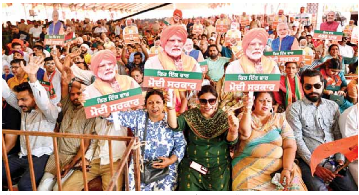
NDA supporters at Prime Minister Narendra Modi's public meeting for the last phase of Lok Sabha elections, in Hoshiarpur, Punjab, on Thursday

Addressing his final rally of the back-to-back hectic 2024 Lok Sabha polls campaign, which spanned about two months, Prime Minister Narendra Modi on Thursday attacked the Congress for 'ranting' about the Constitution. He accused them of 'strangling' it during the Emergency and not caring about it when Sikhs were killed in the 1984 riots.