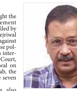
Appearing for ED, Additional Solicitor General (ASG) SV Raju sought time to file response to the pleas. The agency claimed he suppressed many facts. Kejriwal, who had been campaigning from the day

A city court on Thursday sought the response of the Enforcement Directorate (ED) to a bail plea filed by Delhi Chief Minister Arvind Kejriwal in the money laundering case against him in relation to the Delhi excise policy. Kejriwal is currently out on interim bail, granted by the Supreme Court, in the case till June 1. Kejriwal on Thursday campaigned in Punjab, the last day of campaigning for the seven phases Lok Sabha polls.