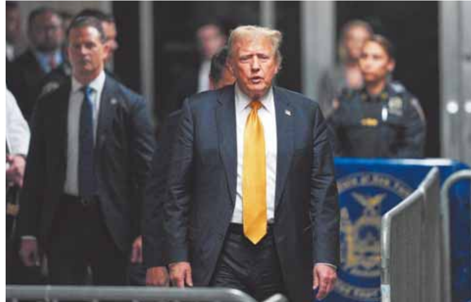
Former President Donald Trump speaks to the media as the jury deliberates in this trial at Manhattan Criminal Court on Wednesday in New York.

In an agreed statement of facts between the crown and the defence, Greene outlined a common pattern based on victim testimony.