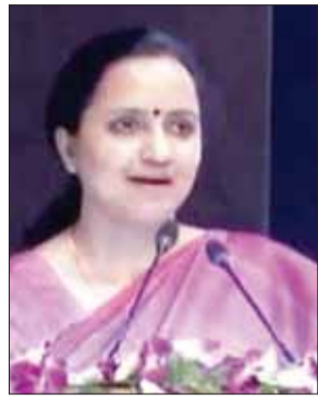
ter taking voluntary retirement from the All India Civil Services in October 2023.