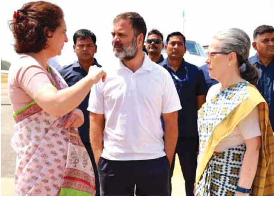
Congress leaders Rahul Gandhi, Sonia Gandhi and Priyanka Gandhi Vadra upon their arrival before the nomination filing of Rahul ahead of the third phase of the Lok Sabha elections, in Raebareli

On deciding to contest from Raebareli Lok Sabha constituency, former Congress president Rahul Gandhi apparently made a calculated risk to solve several anomalies within and outside the party and hence retaining the legacy of Gandhi-Nehru family.