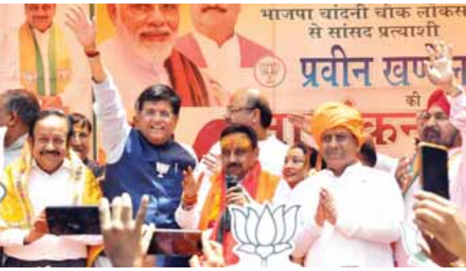
Union Minister Piyush Goyal, former Union Minister and BJP leader Harsh Vardhan with others during a 'Jansabha' in support of the party candidate from Chandni Chowk constituency Praveen Khandelwal, ahead of the third phase of Lok Sabha elections, at Chandni Chowk, in New Delhi, on Friday

works not for individuals but for organisational development, and each candidate is a symbol of the organisation. We will ensure the victory of BJP candidate Khandelwal by ensuring maximum voter turnout on election day." This support adds a stark contrast to the infighting between the Congress in the national Capital, which is now out in the open with the exit of former Delhi Congress Chief Arvinder Singh Lovely. Slamming the INDIA Bloc, Goyal said, "The Congress and the AAP abuse each other in Punjab while they have seat-sharing arrangements in other States. The people of Delhi are intelligent enough not to be misled by such tactics," adding that the grand old