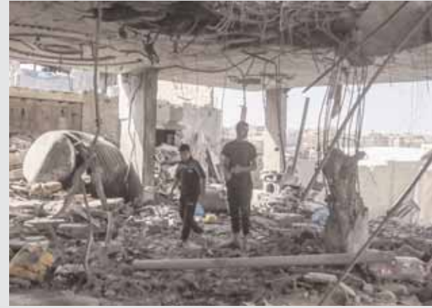
Palestinians stand in the ruins of the Chahine family home, after an overnight Israeli strike that killed at least two adults and five boys and girls under the age of 16 in Rafah, southern Gaza Strip, Friday. An Israeli strike on the city of Rafah on the southern edge of the Gaza Strip killed several people, including children, hospital officials said Friday.

Turkiye on Thursday suspended all imports and exports to Israel citing the country's ongoing military action in Gaza and vowed to continue to impose the measures until the Israeli government allows the flow of humanitarian aid to the region. A Turkish Trade Ministry statement said "export and import transactions in relation to Israel have been stopped, covering all products." Turkish officials would coordinate with Palestinian authorities to ensure that Palestinians are not affected by the suspension of imports and exports, the ministry said. The ministry described the step as the "second phase" of measures against Israel, adding that the steps would remain in