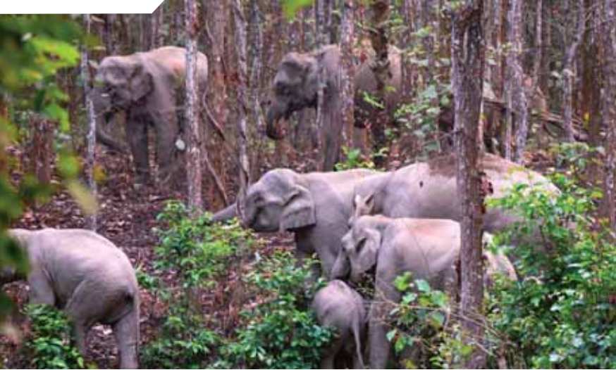
A herd of elephants grazes near a village at Boko, in Kamrup district of Assam