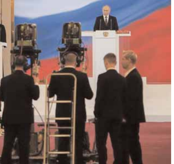
Vladimir Putin takes oath as Russian president during an inauguration ceremony in the Grand Kremlin Palace in Moscow, Russia

Russian President Vladimir Putin reappointed Mikhail Mishustin as the country's prime minister on Friday, a widely anticipated move to keep on a technocrat who has maintained a low political profile.