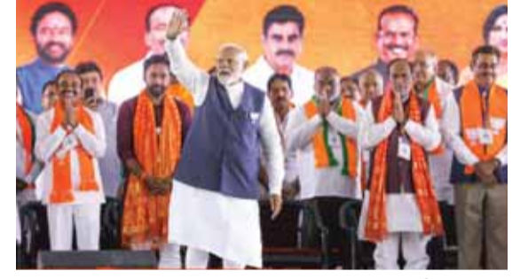
Prime Minister Narendra Modi during a public meeting for Lok Sabha elections, in Hyderabad, on Friday.