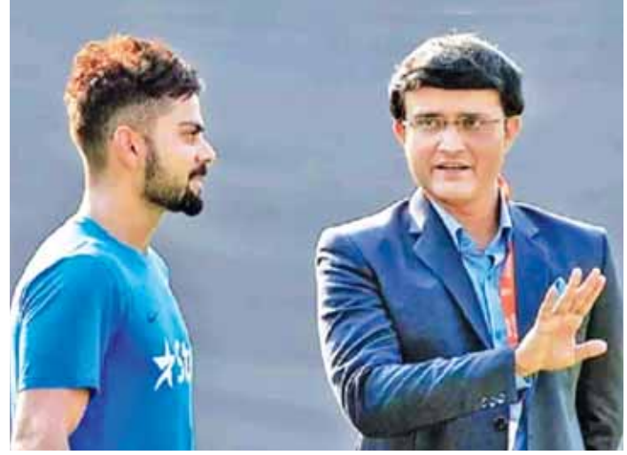
Virat Kohli (left) and Sourav Ganguly (right) during a discussion.

said there's no time to settle down in modern T20s. You just have to hit, and that's the way it is going to be," said Ganguly.