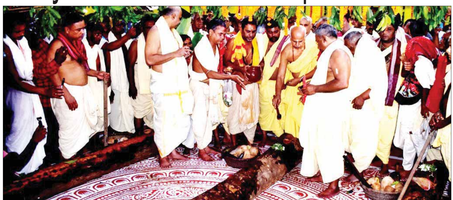
Ratha Anukula: Construction of chariots for the Trinity for this year's Rath Yatra commences at the Grand Road near the Jagannath Temple in Puri on the auspicious day of Akshaya Tritiya on Friday.

The day of Akshaya Tritiya is considered to be auspicious for any new beginnings like weddings, buying property and making investments, etc. The popular agrarian festival was celebrated as per the age-old tradition across Odisha on Friday. The farmers across the State performed the traditional 'Akhi Muthi Anukula', the ritual of sowing seeds in their paddy fields after ploughing their lands. As per the age-old rituals, farmers observe the festival as 'Siddhi and Suddhi Dibasa'. They wear new clothes, carry a basket of seeds and sow those in their fields. These seeds are known as offerings to Goddess Lakshmi which is believed to bring rich harvest.