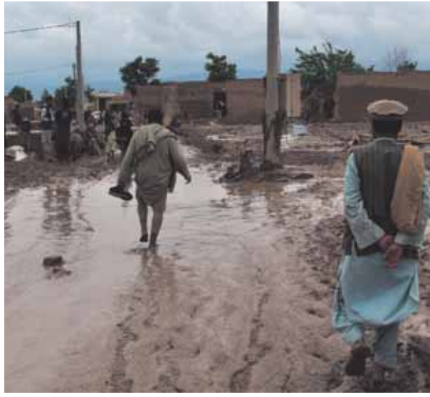
resulted in "significant financial losses." He also said the government had ordered all available resources mobilized to rescue people, transport the injured and recover the bodies of the deceased. The Taliban defence ministry said in a statement Saturday that the country's air force has already begun evacuating people in Baghlan and has so far

Flash floods from seasonal rains in Afghanistan have killed hundreds of people and injured a "substantial number," a Taliban official said Saturday, without giving exact figures. The floods hit mostly the northern region of the country. The province of Baghlan bore the brunt of the deluges Friday with officials preliminary reporting at least 50 people dead and properties destroyed in multiple districts. In neighbouring Takhar province, state-owned media outlets reported the floods killing at least 20 people. Zabihullah Mujahid, the chief spokesman for the Taliban government posted on social media platform X on Saturday, saying that "hundreds... have succumbed to these calamitous floods, while a substantial number have sustained injuries." Mujahid underscored the provinces of Badakhshan, Baghlan, Ghor and Herat as the worst hit. He added that "the extensive devastation" has