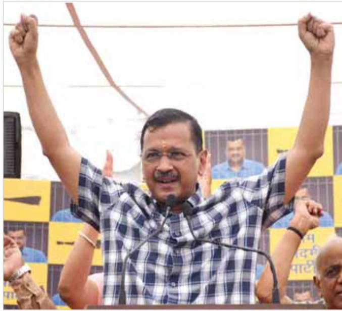
Delhi Chief Minister Arvind Kejriwal addresses a press conference

Filled with energy and high political spirit ever since he walked out from Tihar Jail on Saturday, Delhi Chief Minister Arvind Kejriwal while addressing his enthused party workers launched a scathing attack at the BJP and Prime Minister Narendra Modi, accusing him of crushing his and other Opposition parties. Kejriwal, who has launched his Lok Sabha campaign for the May 25 Delhi schedule, alleged that the BJP is on a mission to bring about dictatorship in the country. Besides the "one nation, one leader" jibe, the AAP convenor also accused the BJP of shielding corrupt leaders and asked them if they would live up to the rule of retirement at the age of 75 that was brought about by Prime Minister Narendra Modi. Kejriwal further claimed that the Prime Minister wants Amit Shah to succeed in his acknowledgement that the party is set to retain power for a third straight term. At the same time Kejriwal also asserted the BJP will not return to power and said the INDIA Bloc will form the Government on June 4. "In the last 20 hours after release from jail, I talked to poll experts and people and got to know the BJP is not going to form the Government. The AAP will be part of the Government at the Centre. We will get full Statehood for Delhi and it shall have a people's Governor, not a man from Gujarat," he said, while adding that according to his assessment that the BJP is not getting more than 220-230 seats.