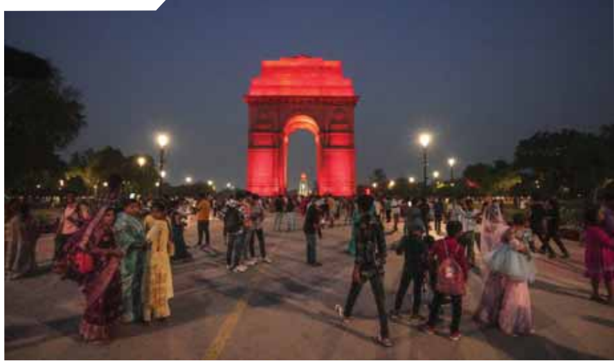
India Gate lit in red to raise awareness on World Thalassaemia Day, in New Delhi