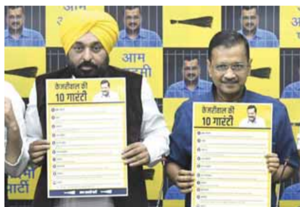
Delhi Chief Minister and AAP convener Arvind Kejriwal with party leaders Bhagwant Mann during a Press conference, in New Delhi, on Sunday. Kejriwal on Sunday announced 'Kejriwal ki Guarantee' — a list of promises for Lok Sabha elections

guarantees have proven track record," Kejriwal said.