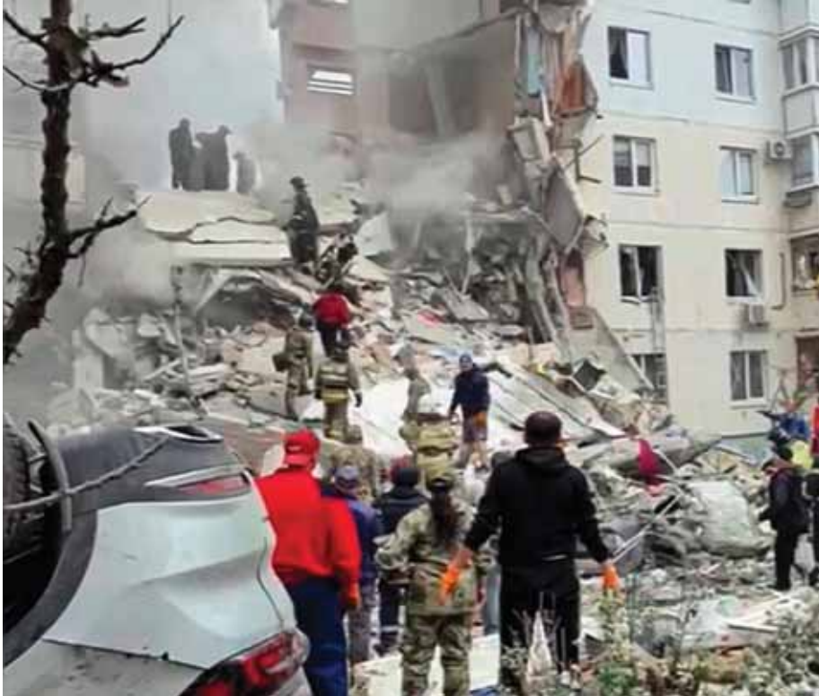
In this photo taken from video released by the Russian Emergency Ministry Press Service on Sunday, May 12, 2024, Russian emergency services work at the scene of a partially collapsed block of flats authorities said was hit during an attack by Russia.