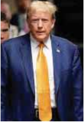
Trump, the presumptive Republican presidential nominee, drew what his team called a "mega crowd" to a Saturday evening rally in the southern New Jersey resort town of Wildwood, 150 miles (241

Blasting the Democratic president "a total moron," Trump before a crowd of tens of thousands repeatedly characterized the cases against him as politically motivated and timed to harm his ability to campaign. "He's a fool. He's not a smart man," Trump said of Biden. "I talk about him differently now because now the gloves are off."