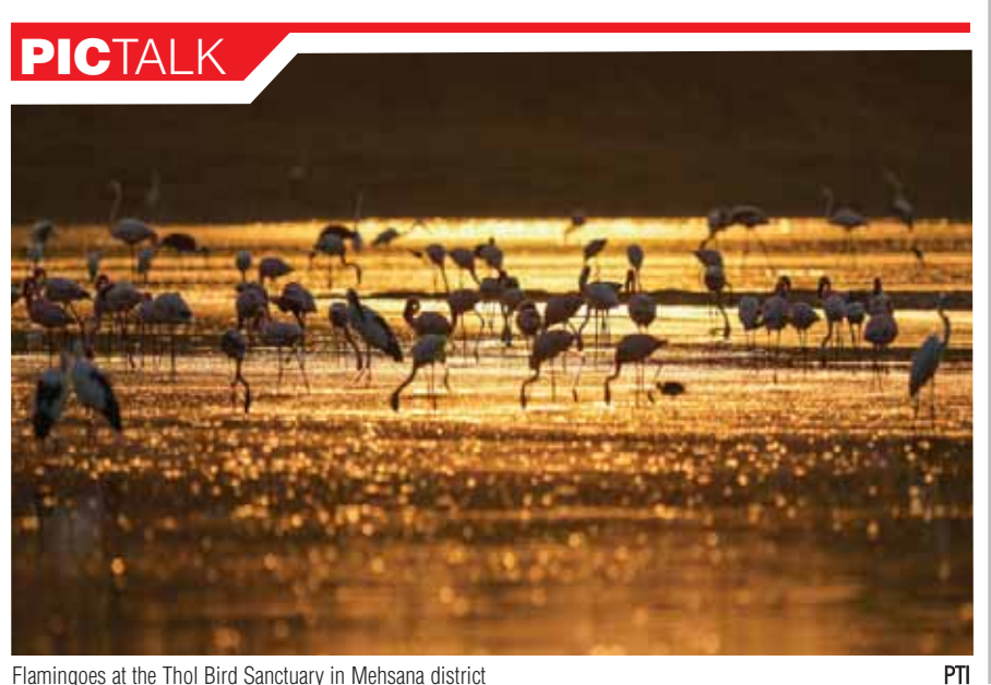
Flamingoes at the Thol Bird Sanctuary in Mehsana district

follow and that explains India's rising trade ties with