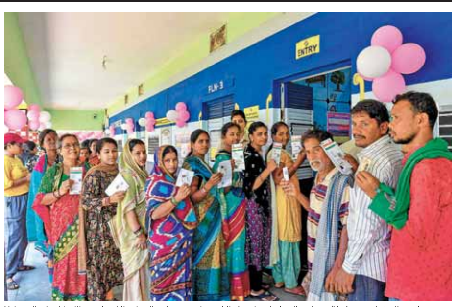
Voters display identity cards while standing in queue to cast their votes during the phase IV of general elections, in Berhampur, Odisha, on Monday

West Bengal witnessed over 76.02 per cent turnout, the polling. Among other States, Andhra Pradesh recorded