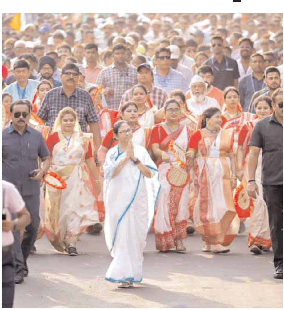
West Bengal Chief Minister Mamata Banerjee greets supporters during an election roadshow for the Lok Sabha polls, in Howrah, on Wednesday

Notwithstanding her "outside support" pledge for INDIA Bloc, Mamata said by INDIA she did not mean the Left and the Congress of