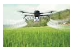
Drone flying over a field.

Drone technology has gained popularity in the agriculture industry in recent years. Drones provide farmers with several advantages, such as higher yields, lower costs, and enhanced efficiency. However, there are worries that farmers would be hesitant to use drone technology because they don't know enough about it or are afraid of losing their jobs. We will examine the advantages of drone technology for the agricultural industry as well as any obstacles that might be preventing farmers from implementing it. Drones' advantages in the agriculture industry