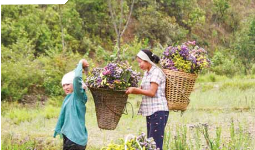
Women carry stajice flowers in bamboo baskets, in Senapati district of Manipur