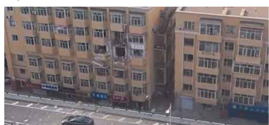
least one person being carted away by first responders into an ambulance, and the streets

Beijing (AP): An explosion at an apartment building in northeastern China killed one person and injured at least three others Thursday, state media reported. Parts of the five-story apartment building in Harbin were damaged, with one apartment's balcony completely blown off, videos on social media showed. Officials told local media that the explosion was likely from a natural gas tank. One woman died of her injuries, according to Jimu News, a state-backed media outlet. The three others were taken to the hospital for their injuries. Videos online also showed at