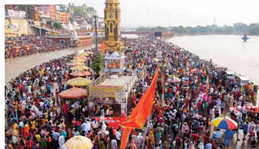
Devotees at Har Ki Pauri on the occasion of Buddha Purnima, in Haridwar