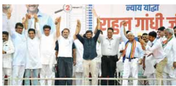
Congress leader Rahul Gandhi with party leader and INDIA Bloc Lok Sabha candidate from North East Delhi constituency Kanhaiya Kumar during a public meeting at Dilshad Garden in New Delhi on Thursday.