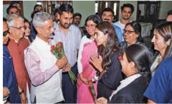
External Affairs Minister S. Jaishankar during a discussion on 'Viksit Bharat @2047', in Shimla, Tuesday

China is constructing roads, bridges and model village at the border on the land it took in 1962 and had made a road to Siachen with the coordination of Pakistan and India has also deployed forces,