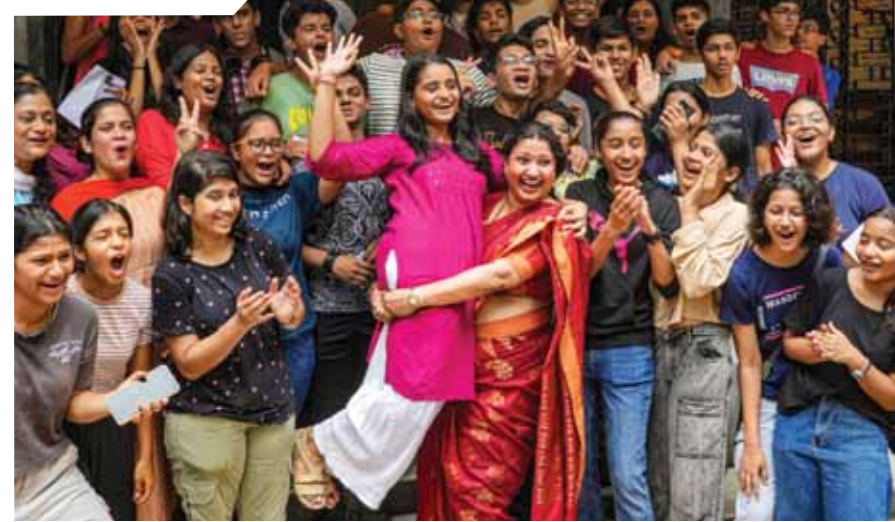
Students celebrate with their teacher over Secondary School Certificate (SSC) results, in Mumbai