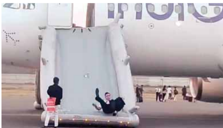
A pilot slides down from the Varanasi-bound IndiGo flight that received a bomb threat at the Indira Gandhi International Airport, in New Delhi on Tuesday

Dramatic scenes unfolded at the Indira Gandhi International Airport as the 176 passengers onboard the IndiGo flight were evacuated via the emergency exits following the bomb threat. Panic gripped after a bomb threat received from Delhi to Varanasi bound IndiGo flight (6E2211) at the IGI airport here on Tuesday morning prompting authorities to move the aircraft to an isolation bay for a thorough investigation.