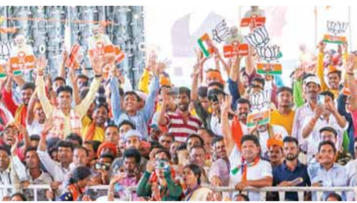
BJP supporters during Prime Minister Narendra Modi's public meeting for Lok Sabha elections, in Dumka district, on Tuesday

was decreasing in the Santhal Parganas because of infiltration and accused the JMM-led ruling alliance in Jharkhand of "patronising" infiltrators, who he said were grabbing land and putting women at risk.