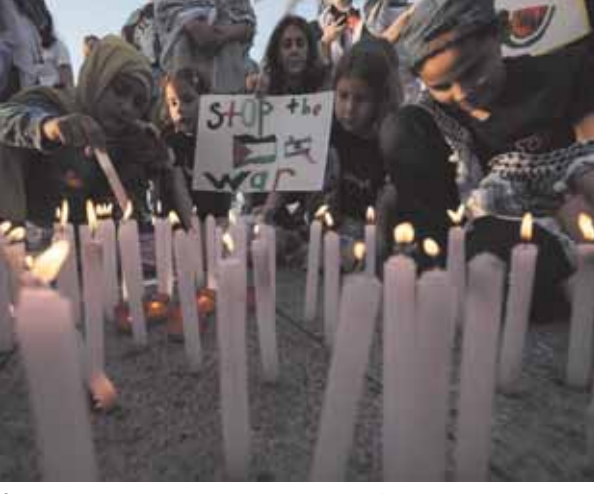
Children light candles during a march against Israel and in solidarity with Palestinians in the southern Gaza city of Rafah, on the Mediterranean Sea corniche in Beirut, Lebanon, Monday. Israeli Prime Minister Benjamin Netanyahu acknowledged Monday that a "tragic mistake" had been made after an Israeli strike in the southern Gaza city of Rafah set fire to a tent camp housing displaced Palestinians and killed at least 45 people, according to local officials.