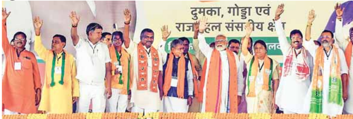
Prime Minister Narendra Modi during a public meeting for Lok Sabha elections, in Dumka district

Accusing the JMM of indulging in "communal and appeasement politics",