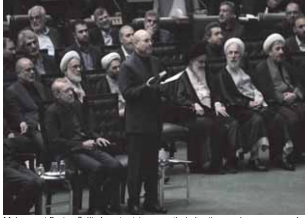
Mohammad Bagher Qalibaf, center, takes an oath during the opening ceremony of the new parliament term in Tehran, Iran.

Iran's parliament re-elected hard-liner Mohammad Bagher Qalibaf on Tuesday as its speaker, reaffirming its hard-right makeup in the wake of a helicopter crash that killed the country's president and foreign minister. Of 287 lawmakers voting, 198 backed Qalibaf to retain the position he first took in 2021. He initially became speaker following a string of failed presidential bids and 12 years as the leader of Iran's capital city, in which he built out Tehran's subway and supported the construction of modern high-rises. Many, however, know Qalibaf for his support, as a Revolutionary Guard general, for a violent crackdown on Iranian university students in 1999. He also reportedly ordered live gunfire to be used against Iranian students in 2003 while serving as the country's police chief. In Tuesday's