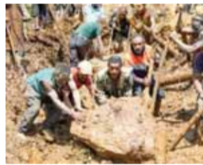
for speedy recovery of the injured. India is ready to offer all possible support and assistance," the Prime Minister posted on X. According to the Papua New Guinea Government, more than 2,000 people are believed to have been buried alive in a landslide in the South Pacific island nation.

Prime Minister Narendra Modi on Tuesday expressed grief over the loss of lives and damage wreaked by a devastating landslide in Papua New Guinea, and said India is ready to offer all possible support and assistance.