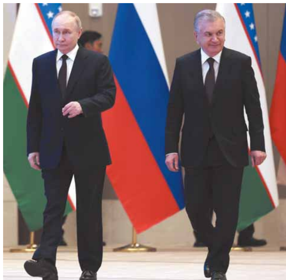
Russian President Vladimir Putin, left, and Uzbek President Shavkat Mirziyoyev arrive to attend a meeting of the Council of Regions of Uzbekistan and Russia in Tashkent, Uzbekistan, Monday.

Much before that, in 2017, Nawaz had stepped down as the country's prime minister after the Supreme Court disqualified him for life from holding public office for not declaring a receivable salary. Following his trial in the Panama Papers case, the apex court, in February 2018, disqualified the PML-N supremo as the party's president.