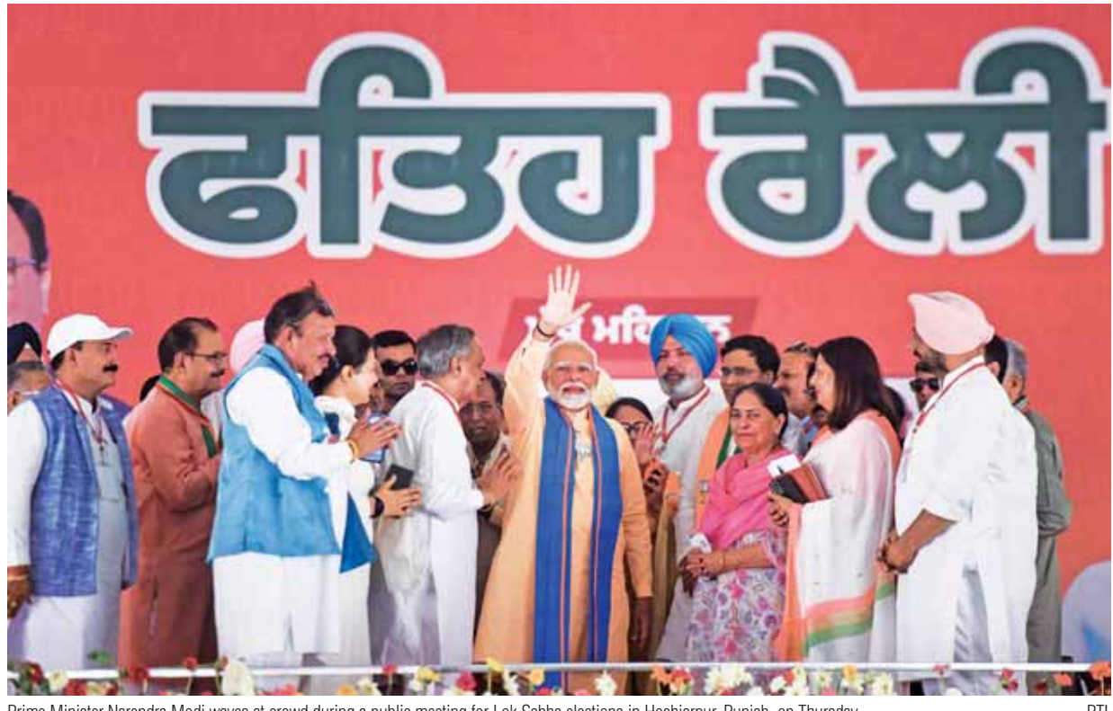
Prime Minister Narendra Modi waves at crowd during a public meeting for Lok Sabha elections in Hoshiarpur, Punjab, on Thursday

Prime Minister Narendra Modi ended his whirlwind Lok Sabha poll campaign with a rally in Punjab's Hoshiarpur on Thursday, closing out his electioneering the way he began — by focussing on a region where he has invested heavily over the years for the BJP to make a mark outside its strongholds. Modi notched up a total of 206 public-outreach programmes, including rallies and roadshows, since the Election Commission (EC) announced the poll schedule on March 16. The Prime Minister surpassed his nearly-145 public engagements on the stump during the 2019 polls by a big margin. The campaign period this time was of 76 days, compared to the 68 days in the polls held five years ago. When the EC announced the polls, Modi was on a political tour of southern India, covering all five states in the three days between March 15 and March 17. The Bharatiya Janata Party (BJP) is eyeing to boost its fortunes in Tamil Nadu, Kerala and Andhra Pradesh — three states where it won no seat in 2019 — and