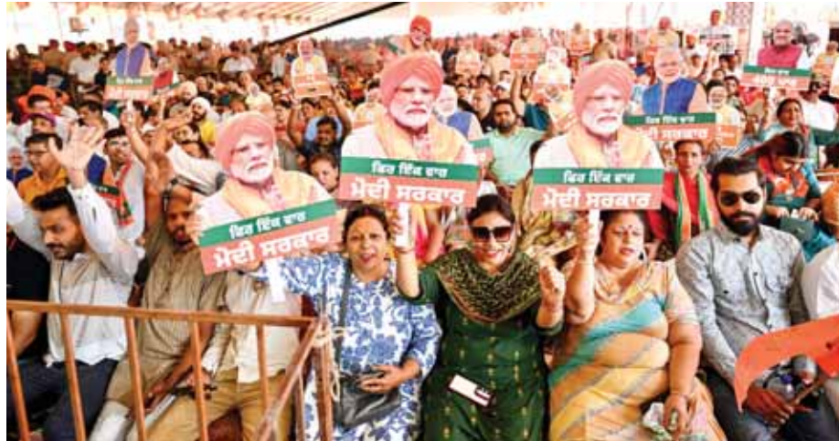
NDA supporters at Prime Minister Narendra Modi's public meeting for the last phase of Lok Sabha elections, in Hoshiarpur, Punjab, on Thursday.

PIONEER NEWS SERVICE ■ HOSHIARPUR (PUNJAB)