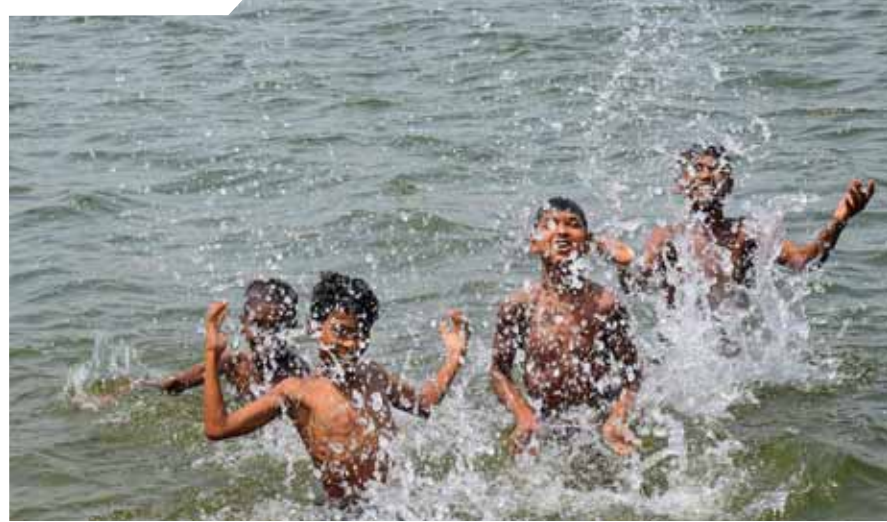
Children playing in water to beat the heat during a hot summer day, in Ranchi