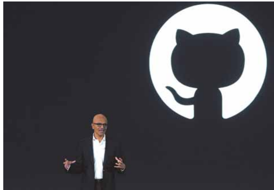
Microsoft CEO Satya Nadella speaks as the logo of GitHub, a subsidiary of Microsoft Corp, is displayed on the screen during an event titled "Microsoft Build: AI Day" in Jakarta, Indonesia, Tuesday.

Microsoft will invest USD 1.7 billion over the next four years in new cloud and artificial intelligence infrastructure in Indonesia — the single largest investment in Microsoft's 29-year history in the country — Microsoft CEO Satya Nadella said Tuesday. Microsoft runs one of the world's largest cloud computing operations and has taken a significant step into artificial intelligence by incorporating an AI chatbot into its search engine, Bing. Its earnings report Thursday said profit rose 20 per cent for the January-March quarter as it tries to position itself as a leader in applying artificial intelligence technology to make workplaces more productive. "This new generation of AI is reshaping how people live and work everywhere, including in Indonesia," said Nadella, in Jakarta on the first stop of a tour of Southeast Asia. "The investments we are