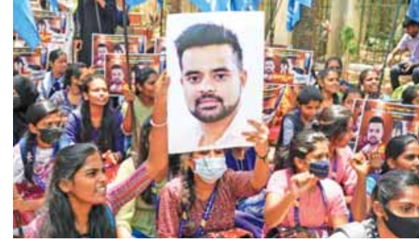
NSUI members hold a poster of JD(S) MP Prajwal Revanna during a protest against his involvement in the alleged sexual abuse case in Bengaluru on Tuesday

JD(S) on Tuesday suspended its Hassan MP Prajwal Revanna from the party with immediate effect over an alleged sex scandal involving him. Prajwal is the BJP-JD(S) alliance's candidate from Hassan, which went to the polls in the second phase on Friday. While Home Minister Amit Shah sought to know why the Congress Government in the State did not take any action against Prajwal for alleged sexual abuse of women, the National Commission for Women sought a report within three days from the Karnataka police over allegations of sexual abuse involving Prajwal. The 33-year-old is the son of HD Deve Gowda's elder son HD Revanna, who is an MLA and a former Minister. Prajwal's uncle H D Kumaraswamy is State president of JD(S). The suspension came minutes after the party core committee that met in Hubballi recommended his suspension to its national president and former Prime Minister H D Deve Gowda, who is also Prajwal's grandfather. "Videos of Hassan MP Prajwal