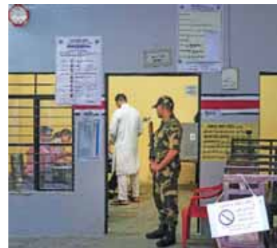
2019 polls, the turnout in the first phase stood at 69.43 per cent. In the second phase of elections held on April 26, the male voter turnout was recorded at 66.99 per cent, while the female turnout stood at 66.42 per cent. As many as 23.86 per cent of the

for 88 constituencies. "In the ongoing general elections, voter turnout of 66.14 per cent has been recorded in phase 1 for 102 PCs (Parliamentary Constituencies) and 66.71 per cent in phase 2 for 88 PCs that went for polls in the two phases," the EC said in a statement. Generally, a higher voter turnout is considered an indication of change, while a low turnout suggests continuity. However, there is no clear correlation or trend evident in the data. Analysts say the lower turnout marked a clear lack of enthusiasm among people. Officially sharing the turnout figure, the EC said in phase one of the elections, 66.22 per cent of male and 66.07 female electors turned up to vote. The turnout for registered third-gender voters stood at 31.32 per cent. In the