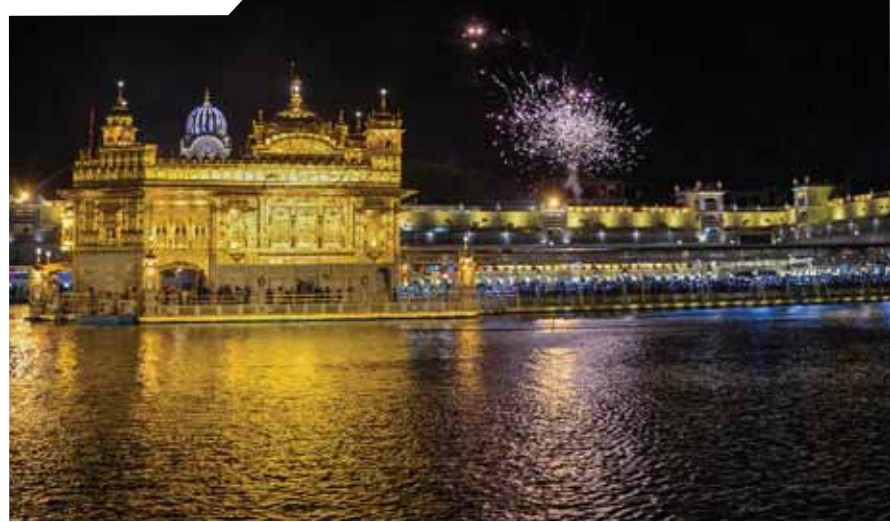
Fireworks light up the sky at the Golden Temple on the birth anniversary of Sikh Guru Teg Bahadur, in Amritsar