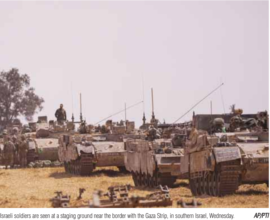
Israeli soldiers are seen at a staging ground near the border with the Gaza Strip, in southern Israel, Wednesday.

of New York, demonstrators were in a standoff with police outside the public college’s main gate. Video posted on social media by news reporters on the scene late Tuesday showed officers putting some people to the ground and shoving others as they cleared people from the street and sidewalks. After police arrived, officers lowered a Palestinian flag atop the City College flagpole, balled it up and tossed it to the ground before raising an American flag. Brown University, another member of the Ivy League, reached an agreement Tuesday with protesters on its Rhode Island campus. Demonstrators said they would close their encampment in exchange for administrators taking a vote to consider divestment from Israel in October. The compromise appeared to mark the first time a US college has agreed to vote on divestment in the wake of the protests.