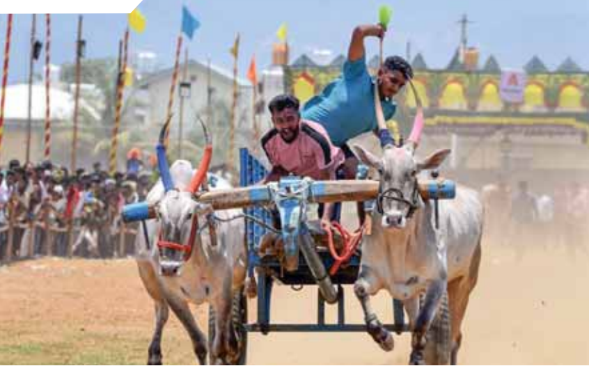
Participants during a State-level bullock cart race at Thegur, in Chikkamagaluru