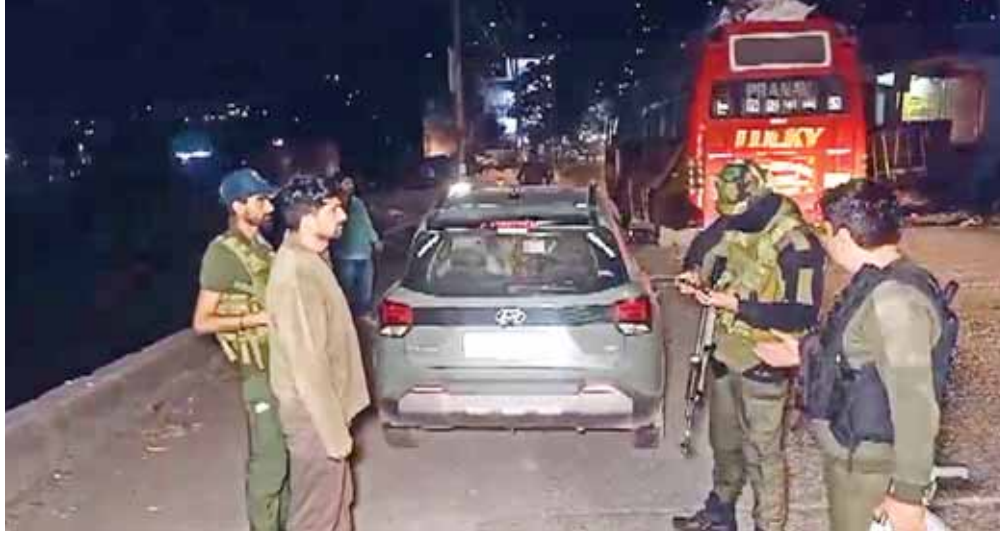
Security personnel stand guard after a militant attack on army vehicles, in Poonch district on Saturday. A search operation is going on in the woods amid inputs about the presence of the militants

The local military units launched cordon and search operations to capture the terrorists behind the strike, the IAF statement read. This is the ninth major attack on security personnel since October 2021 in the region including this which comes right in the midst of 2024 General Elections. A similar terrorist strike took place in the Poonch district on December 21, 2023. Four Army personnel sacrificed their lives and three others received critical injuries after their vehicles were ambushed by the hiding foreign terrorists in the general area of Dera ki Gali in the Poonch district. Five Indian Army personnel including two officers were "killed in action" in the Kalakote forest area of Rajouri on November 22. Meanwhile, the audacious strike has once again raised question marks as none of the terrorists