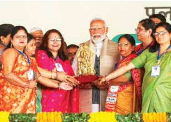
Prime Minister Narendra Modi being felicitated during a public meeting for Lok Sabha polls, in Palamu, on Saturday

The continuous jibe by Prime Minister Narendra Modi on Congress leader Rahul Gandhi by terming him "shehzada" (prince) reached a new zenith on Saturday with the latter's sibling and a general secretary in the grand old party, Priyanka Gandhi, calling the PM as "Shehanshah" (monarch). At the Lok Sabha poll rallies in Bihar and Jharkhand, Modi also used the term shehzada along with Rahul for the RJD leader and former Deputy Chief Minister Tejaswini Yadav. "There is a shehzada in Delhi (Rahul) and one in Patna (Tejaswini), both of whom think of the country as their fiefdom (jaagir)." While addressing a rally in Gujarat, Priyanka called Modi a "Shahanshah" who lives in a palace but is cut off from the public. It was her first response to the PM's 'shehzada' jibe for her brother Rahul. Asserting that India wants a strong leader at the helm to ensure security, Modi said his Government's surgical and air strikes had shaken Pakistan, and the neighbouring country's