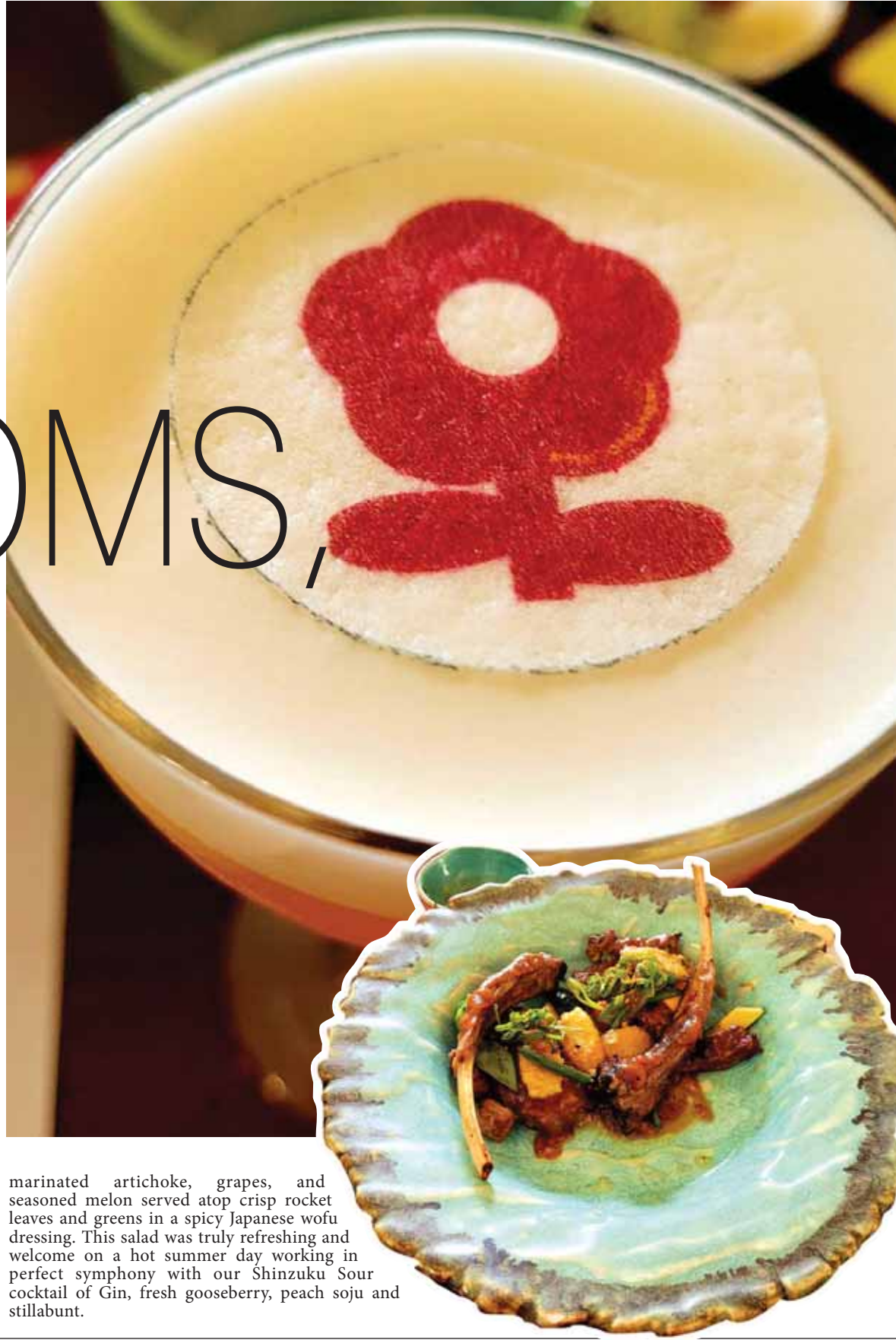
marinated artichoke, grapes, and seasoned melon served atop crisp rocket leaves and greens in a spicy Japanese wofu dressing. This salad was truly refreshing and welcome on a hot summer day working in perfect symphony with our Shinzuku Sour cocktail of Gin, fresh gooseberry, peach soju and stillabunt.

This week I had the great fortune to partake of the Hanami festival at one of Delhi's finest Japanese restaurants Guppy (part of the Olive Chain). This is cherry blossom season of spring in Japan, a time to mark the Hanami festival — a unique cultural tradition of viewing flowers in full bloom, an ancient ritual which serves as a Japanese reminder of the transience of nature, the blossoms a metaphor for life, draped in the immortal philosophy of hope and renewal. And no festival in the world is complete without its attendant share of feasts and festivities. Guppy, in an earnest attempt to keep this old Japanese heritage alive and robust in a faraway land from Japan, in the very heart of India in Delhi, laid out a sumptuous fare of what would typically be a part of a Hanami dining spread. Among the salads on offer — Artichoke & Melon, Acvocado, Beet & Edamame and Chicken, Avocado & Greens — my friend and I settled for the first one which was a refreshing mix of