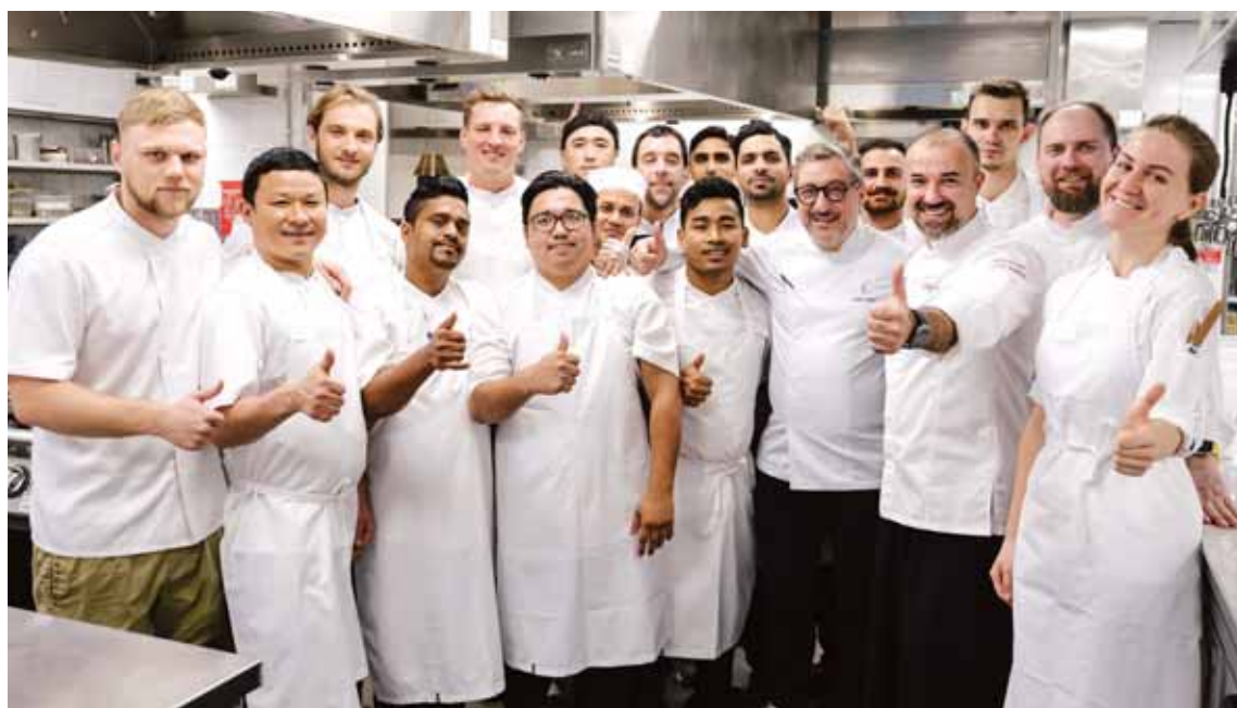
CHEF JOAN ROCA WITH CHEF VLADIMIR MUKHIN AND HIS TEAM AT KRASOTA, DUBAI

Engaging in pop-up events presents chefs with a valuable chance to acquire new skills and engage in the exchange of culinary knowledge amongst peers in the industry. "Pop-ups are a great platform of exchanging ideas and sharing our cooking philosophies and techniques. It's a true example of how the world is getting smaller and more inclusive. It's a sense of pride when I get an opportunity to cook Indian food for an audience that may not be well educated about Indian Cuisine, or when Chefs of the most renowned restaurants around the world join us at Trésind Studio to share their cooking philosophy with our guests. In the end it's a celebration of culture and creating new friendships. The ideas and brainstorming during pop ups sometimes create dishes that eventually