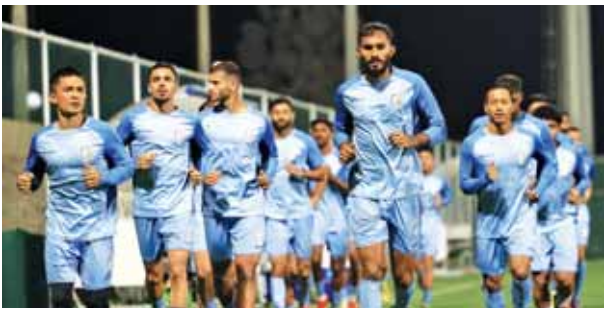
two matches of Group A. India are currently placed second in the group, with four points from as many matches. The top two teams in the group will qualify for round three of the FIFA World Cup Qualifiers and also book their berth at the AFC Asian Cup Saudi Arabia 2027.