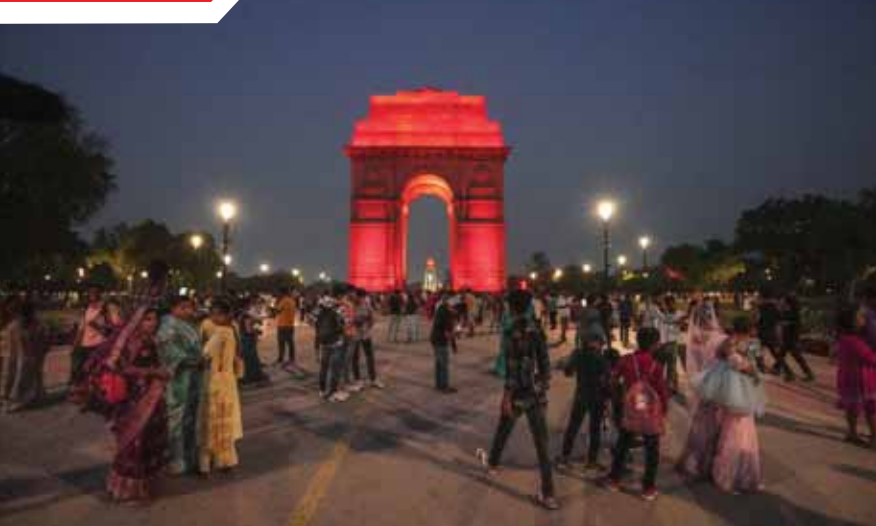
India Gate lit in red to raise awareness on World Thalassaemia Day, in New Delhi