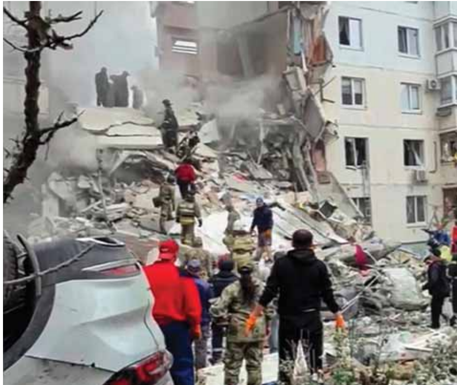
In this photo taken from video released by the Russian Emergency Ministry Press Service on Sunday, May 12, 2024, Russian emergency services work at the scene of a partially collapsed block of flats authorities said was hit during an attack by Russia.

Thousands more civilians have fled Russia's renewed ground offensive in Ukraine's northeast that has targeted towns and villages with a barrage of artillery and mortar fire, officials said on Sunday. The intense battles have forced at least one Ukrainian unit to withdraw in the Kharkiv region, capitulating more land to Russian forces across less defended settlements in the so-called contested "gray zone" along the Russian border. By Sunday afternoon, the town of Vovchansk, with a prewar population of 17,000, emerged as a focal point in the battle. Volodymyr Tymoshko, the head of the Kharkiv regional police, said Russian forces were in the outskirts of the town and approaching from three directions. A Russian tank was spotted along a major road leading to the town, Tymoshko said, illustrating Moscow's confidence to deploy heavy weaponry.