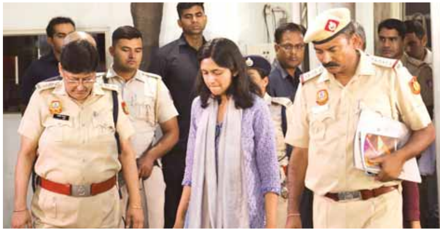
Aam Aadmi Party (AAP) Rajya Sabha MP Swati Maliwal leaves Delhi Chief Minister Arvind Kejriwal's residence at Civil Lines, in New Delhi, on Friday. The Delhi Police on Friday took Maliwal to the CM's residence to recreate the crime scene as it investigates the alleged assault on her there earlier this week, officials said