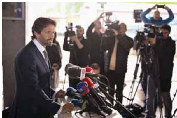
Deputy Prime Minister and Defence Minister of Slovakia Robert Kalinak speaks during a media briefing outside the F. D. Roosevelt University Hospital, where Slovak Prime Minister Robert Fico, who was shot and injured on May 15, is treated, in Banska Bystrica, central Slovakia, Friday.