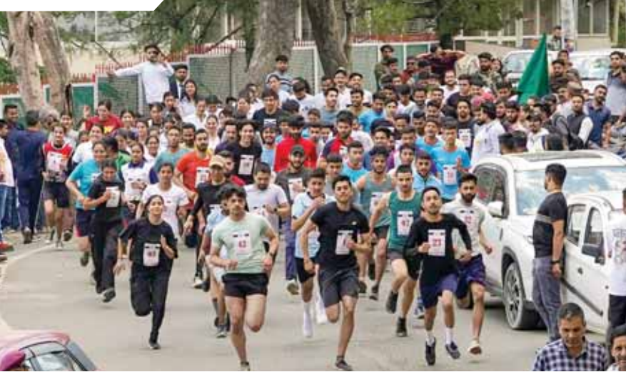
Participants at the 'Run For Vote' marathon for the Lok Sabha election awareness, in Shimla