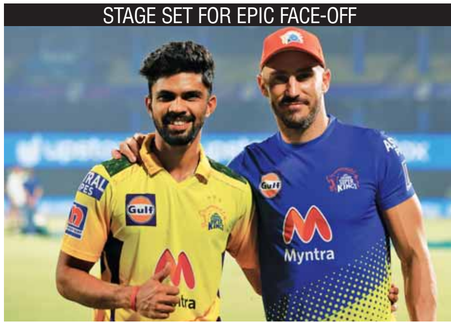
STAGE SET FOR EPIC FACE-OFF

du Plessis is back among runs, having capped single digit scores in his last two outings. In the middle order, Rajat Patidar and Cameron Green have both showcased compelling form. Mahipal Lomror and Dinesh Karthik would be looking to make the most out of the Chinnaswamy track, which is typically a good batting wicket. As for RCB's bowling, Yash Dayal has been their star, bagging the most wickets this season. Lockie Ferguson, Mohammed Siraj, Green, and Swapnil Singh face a formidable task ahead. Will Jacks, who has impressed with the bat, is a part-time spin bowling option. But it will be interesting to see if he is utilised on this track. For CSK, Ruturaj Gaikwad has been the team's top run-scorer this season and is expected to