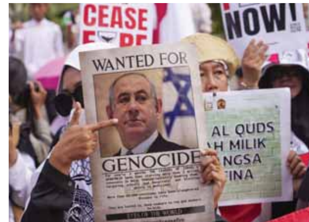
A protester holds a poster of Israeli Prime Minister Benjamin Netanyahu during a rally commemorating the 76th anniversary of the mass expulsion of the Palestinians from what is now Israel in 1948, often called the "Nakba" or Arabic for catastrophe, outside the U.S. Embassy in Jakarta, Indonesia on Friday.

Israel strongly denied charges of genocide on Friday, telling the United Nations' top court it was doing everything it could to protect the civilian population during its military operation in Gaza. The International Court of Justice wrapped up a third round of hearings on emergency measures requested by South Africa, which says Israel's military incursion in the southern city of Rafah threatens the "very survival of Palestinians in Gaza" and has asked the court to order a cease-fire. Tamar Kaplan-Tourgeman, one of Israel's legal team, defended the country's conduct, saying it had allowed in fuel and medication to the beleaguered enclave. "Israel takes extraordinary measures in order to minimize the harm to civilians in Gaza," she told The Hague-based court. A protester shouting "Liars" briefly interrupted Kaplan-