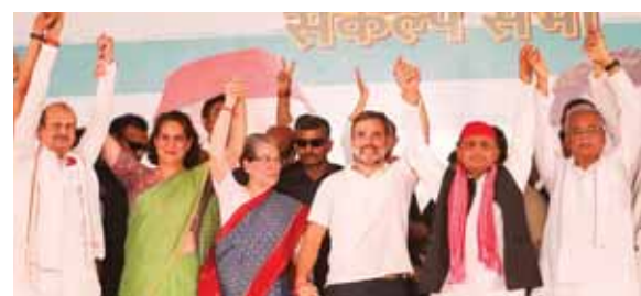
Congress leader and party candidate from Rae Bareilly constituency Rahul Gandhi with party leaders Sonia Gandhi and Priyanka Gandhi, Samajwadi Party (SP) chief and party candidate from Kannauj constituency Akhilesh Yadav, former Chhattisgarh Chief Minister Bhupesh Baghel and others during a public meeting for the Lok Sabha elections, in Rae Bareilly district, on Friday

"The past days since the incident have been extremely painful for me. It is one of the most difficult times of my life. The pain, trauma and harassment have been mind-numbing. My head and neck have been hurting constantly since the attack. My arms are very sore and my abdomen is also hurting. I am also experiencing difficulty walking. My situation is exacerbated by the fact that I have worked all my life for women's issues and have helped lakhs of women get justice," the FIR read.