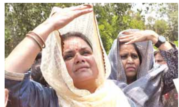
People use scarves to shield themselves from the hot summer sun.

Nautapa, which will continue until June 2, is also considered the birth time of the southwest monsoon. During Nautapa, the Sun is closest to the Earth, resulting in intense heat. The maximum temperature is expected to range from 42 degrees Celsius to 45 degrees Celsius, which may feel like 50