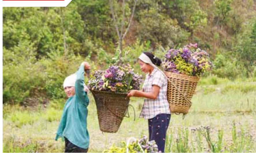
Women carry stajice flowers in bamboo baskets, in Senapati district of Manipur