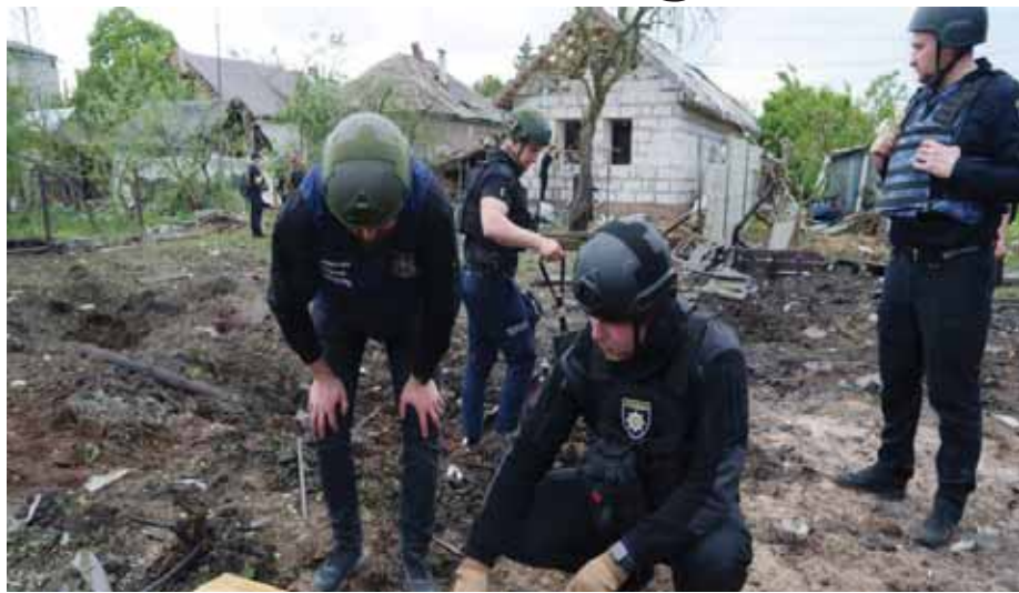
A Ukrainian police officer and war crime prosecutor inspect fragments of a glide bomb in front of damaged house, after a Russian airstrike on a residential neighbourhood in Kharkiv, Ukraine, Saturday.

Russia said it shot down some 60 drones and several missiles over its territory while Ukraine in turn said it destroyed over 30 Russian drones. At least four people were reported killed in an attack on the outskirts of Kharkiv on Sunday as Russia pushed ahead with its renewed offensive in Ukraine's war-ravaged northeast. Russian air defences shot down 57 Ukrainian drones over the southern Krasnodar region overnight, the Russian Defence Ministry said. Local military officials said drone debris hit an oil refinery in the town of Slavyansk-on-Kuban, but there was no fire or damage. News outlet Astra published videos appearing to show an explosion at the refinery as it was hit by a drone. The videos could not be independently verified. Nine long-range ballistic missiles and a drone were destroyed over the Russia-occupied Crimean Peninsula,