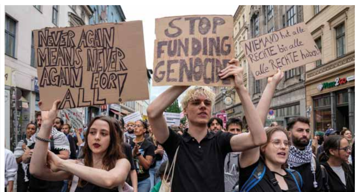
People take part in a pro-Palestinian rally in Berlin, Saturday.

on base transceiver stations to transmit signals, are unable to reach outer islands because they have limited coverage. Starlink's satellites, which remain in low orbit, will help them deliver faster internet with nationwide coverage. Health Minister Budi Gunadi Sadikin said of the more than 10,000 clinics across the country, there are still around 2,700 without internet access. "The internet can open up better access to health services as communication between regions is said to be easier, so that reporting from health service facilities can be done in real time or up to date," he said. During his first in-person visit to Bali, Musk is also scheduled to participate in the 10th World Water Forum, which seeks to address global water and sanitation challenges.