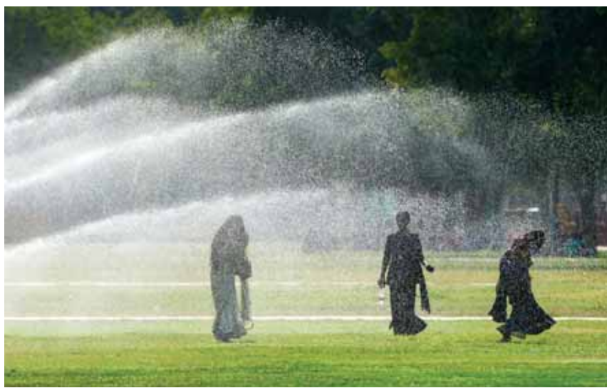
Young women stand under fountains to beat the heat at Central Vista Lawns near India Gate, in New Delhi, on Sunday