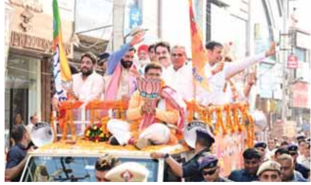
Haryana Chief Minister Nayab Singh Saini participated in a roadshow in support of BJP candidate from Sirsa Ashok Tanwar at Fatehabad on the last day of campaigning on Thursday.

Among prominent candidates in contest for the 10 Lok Sabha seats include former State Chief Minister and BJP's candidate Manohar Lal Khattar from Karnal; BJP's Naveen Jindal, INLD's Abhay Chautala and AAP's Sushil Gupta from Kurukshetra; BJP's Ranjit Singh Chautala, Congress' Jai Prakash and JJP's Naina Chautala from Hisar. Union Ministers Rao Inderjit Singh and Krishan Pal Gurjar are seeking re-election from Gurugram and Faridabad, respectively. From