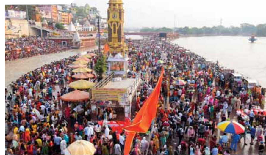
Devotees at Har Ki Pauri on the occasion of Buddha Purnima, in Haridwar