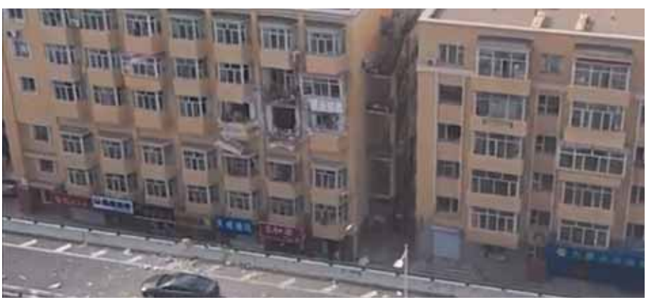
least one person being carted away by first responders into an ambulance, and the streets

An explosion at an apartment building in northeastern China killed one person and injured at least three others Thursday, state media reported. Parts of the five-story apartment building in Harbin were damaged, with one apartment's balcony completely blown off, videos on social media showed. Officials told local media that the explosion was likely from a natural gas tank. One woman died of her injuries, according to Jimu News, a state-backed media outlet. The three others were taken to the hospital for their injuries. Videos online also showed at