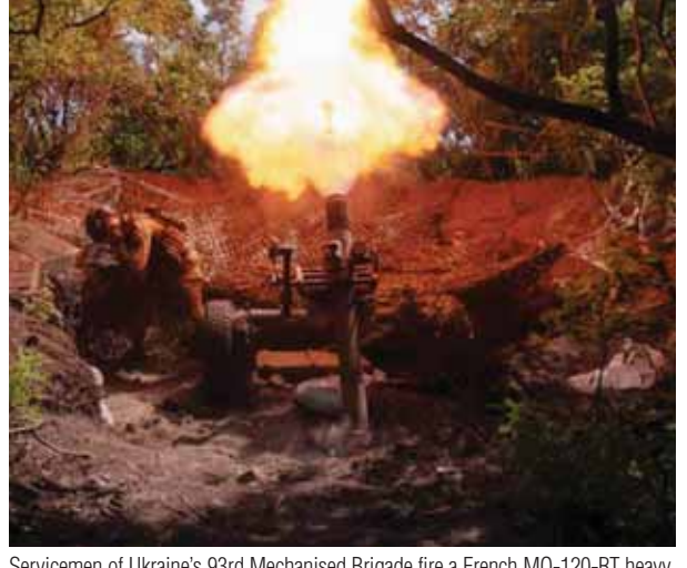
Servicemen of Ukraine's 93rd Mechanised Brigade fire a French MO-120-RT heavy mortar at the Russian forces on the front line near the city of Bakhmut in Ukraine's Donetsk region on Wednesday.

Russian missiles slammed into Ukraine's second-largest city in the northeast of the country and killed at least seven civilians early Thursday, officials said, as Kyiv's army labored to hold off an intense cross-border offensive by the Kremlin's larger and better-equipped forces.