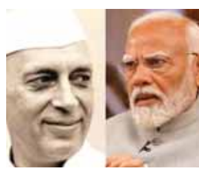
PIONEER NEWS SERVICE ■ NEW DELHI