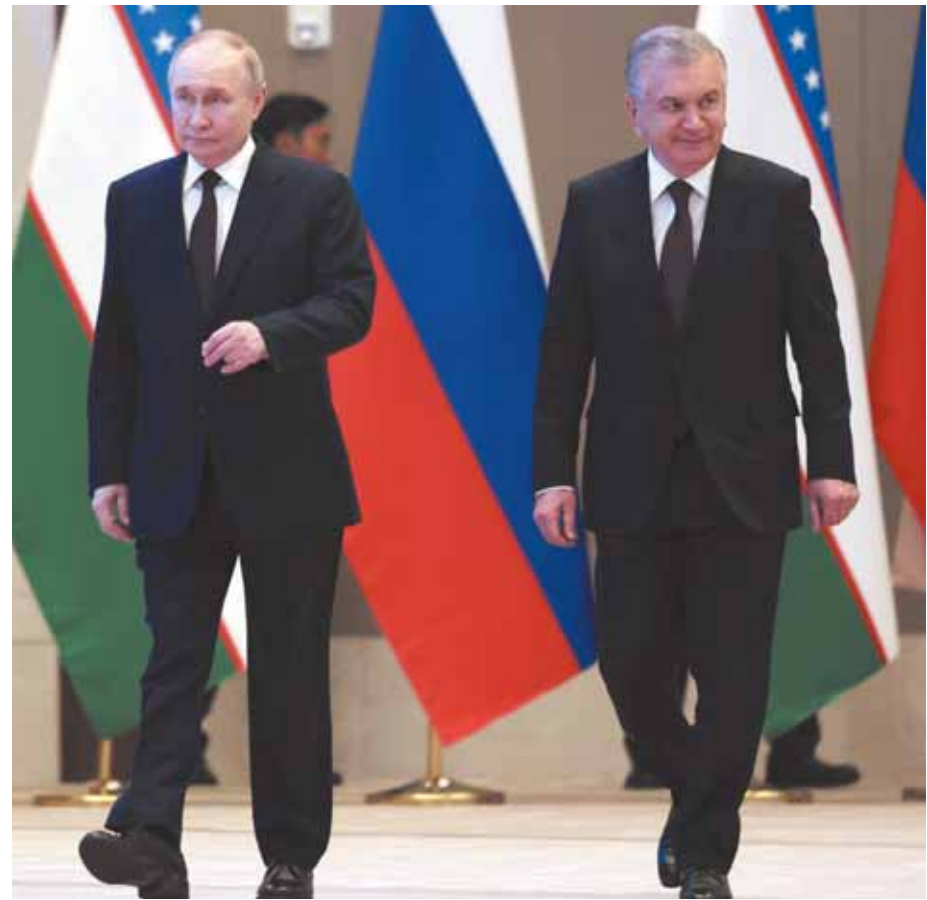
Russian President Vladimir Putin, left, and Uzbek President Shavkat Mirziyoyev arrive to attend a meeting of the Council of Regions of Uzbekistan and Russia in Tashkent, Uzbekistan, Monday.

Much before that, in 2017, Nawaz had stepped down as the country's prime minister after the Supreme Court disqualified him for life from holding public office for not declaring a receivable salary. Following his trial in the Panama Papers case, the apex court, in February 2018, disqualified the PML-N supremo as the party's president.