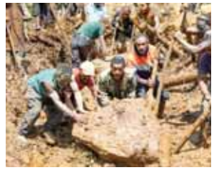
injured. India is ready to offer all possible support and assistance,' the Prime Minister posted on X. According to the Papua New Guinea Government, more than 2,000 people are believed to have been buried alive in a landslide in the South Pacific island nation.

Prime Minister Narendra Modi on Tuesday expressed grief over the loss of lives and damage wreaked by a devastating landslide in Papua New Guinea, and said India is ready to offer all possible support and assistance. An immediate financial aid of USD 1 million to provide relief and assistance to people there was announced by the Indian Government. 'Deeply saddened by the loss of lives and damage caused by the devastating landslide in Papua New Guinea. Our heartfelt condolences to the affected families and prayers for speedy recovery of the