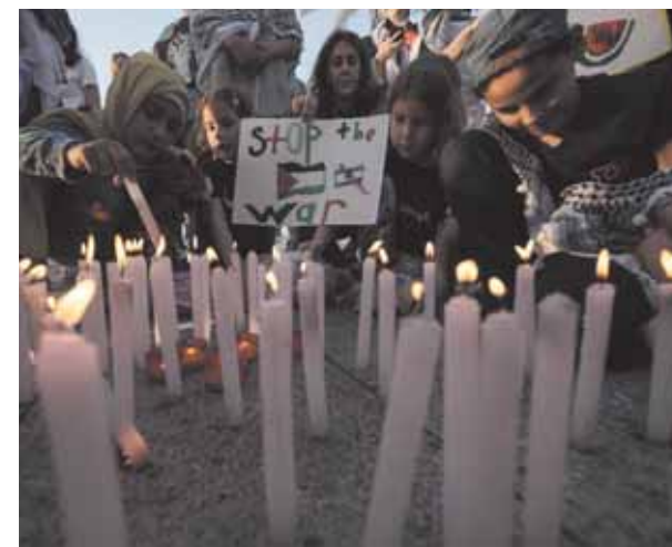
Children light candles during a march against Israel and in solidarity with Palestinians in the southern Gaza city of Rafah, on the Mediterranean Sea corniche in Beirut, Lebanon, Monday. Israeli Prime Minister Benjamin Netanyahu acknowledged Monday that a "tragic mistake" had been made after an Israeli strike in the southern Gaza city of Rafah set fire to a tent camp housing displaced Palestinians and killed at least 45 people, according to local officials.

Palestinian health officials say at least 45 people, around half of them women and children, were killed in Sunday's strike. The fire also could have ignited fuel, cooking gas canisters or other materials in the densely populated camp housing displaced people.