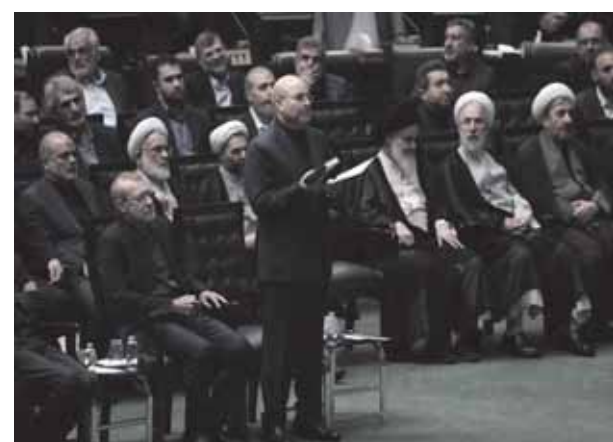
Mohammad Bagher Qalibaf, center, takes an oath during the opening ceremony of the new parliament term in Tehran, Iran.

Of 287 lawmakers voting, 198 backed Qalibaf to retain the position he first took in 2021. He initially became speaker following a string of failed presidential bids and 12 years as the leader of Iran's capital city, in which he built onto Tehran's subway and supported the construction of modern high-rises. Many, however, know Qalibaf for his support, as a Revolutionary Guard general, for a violent crackdown on Iranian university students in 1999. He also reportedly ordered live gunfire to be used against Iranian students in 2003 while serving as the country's police chief. In Tuesday's