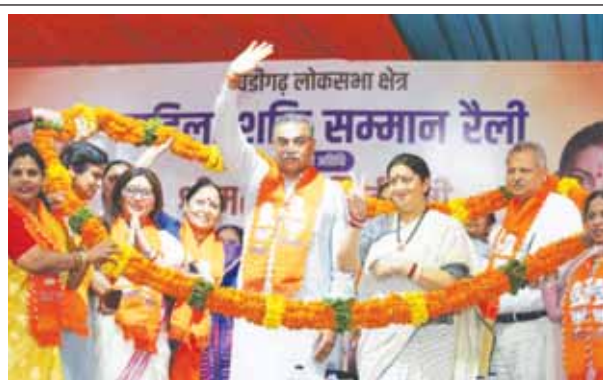
Union Minister and BJP leader Smriti Irani campaigned in support of party's candidate for Chandigarh Sanjay Tandon on Tuesday.

said, "India's defence exports were around Rs 600-800 crore in 2014 and today it has crossed Rs 31,000 crore. In the next five years, we expect it to take beyond Rs 50,000 crore". He also rejected the opposition's allegations of alleged Chinese infiltration and said, "No country can occupy even an inch of our land." He further said that if China tries to indulge in any kind of mischief, the Indian army is fully capable of giving a befitting reply.