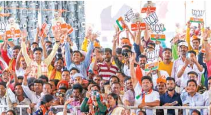
BJP supporters during Prime Minister Narendra Modi's public meeting for Lok Sabha elections, in Dumka district, on Tuesday