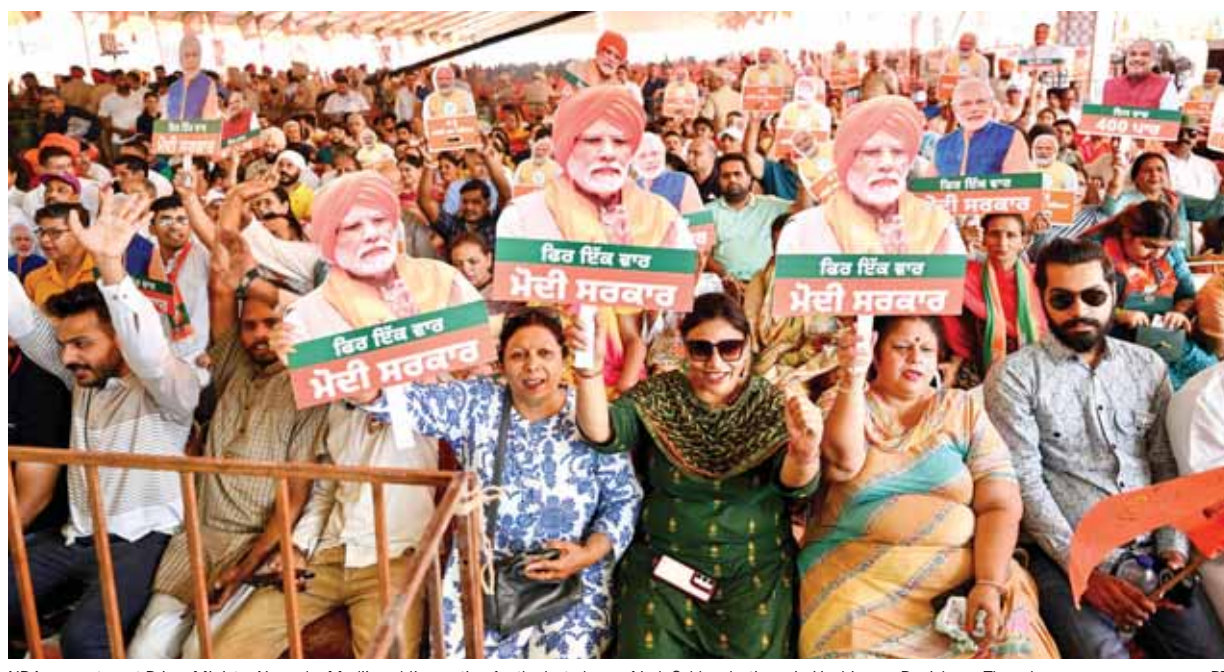
NDA supporters at Prime Minister Narendra Modi's public meeting for the last phase of Lok Sabha elections, in Hoshiarpur, Punjab, on Thursday

Addressing his final rally of the back-to-back hectic 2024 Lok Sabha polls campaign, which spanned about two months, Prime Minister Narendra Modi on Thursday attacked the Congress for 'ranting' about the Constitution. He accused them of 'strangling' it during the Emergency and not caring about it when Sikhs were killed in the 1984 riots. "Sikhs were killed after putting burning tyres around them. At that time, they did not care about the Constitution," Modi said in his last poll rally in the seven-phase election. At the rally in favour of his party's candidates in Punjab which goes to polls on Saturday, the Prime Minister also touched upon the issues of reservation, corruption and the Ram Temple.