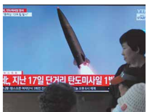
South Korea after it staged an aerial exercise involving 20 fighter jets near the inter-Korean border hours before North Korea attempted to launch its second military reconnaissance satellite.

objects. Japan's Prime Minister Fumio Kishida told reporters that the suspected missiles were believed to have landed in waters outside of Japan's exclusive economic zone.