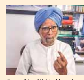
Former Prime Minister Manmohan Singh

Commission's direction of no appeal for votes on caste and religion. Earlier in an appeal to voters, particularly Punjab ahead of the seventh-phase of Lok Sabha polls on Saturday, Singh asserted that only the Congress can ensure growth-oriented progressive future where democracy and Constitution will be safeguarded. The senior Congress leader also hit out at the BJP Government for imposing an "ill-conceived" Agniveer scheme on the Armed forces. "The BJP thinks that the value of patriotism, bravery and service is only four years. This shows their fake nationalism," he said in a letter to voters of Punjab.