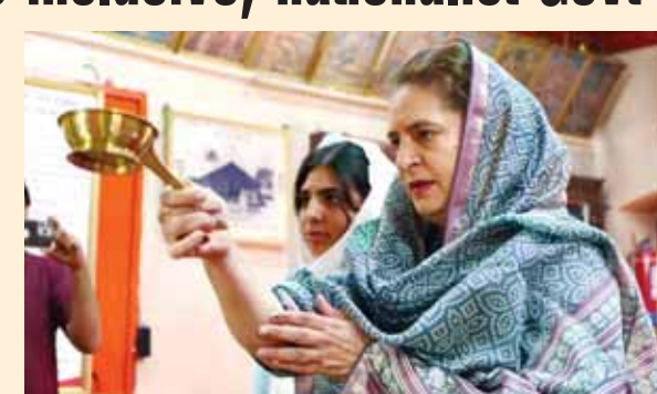
Congress leader Priyanka Gandhi at Jakhu Temple, Shimla, in the midst of last day of campaign in Himachal Pradesh on Thursday

In his first statement in the fag-end of ensuing Lok Sabha elections, former Prime Minister Manmohan Singh on Thursday accused his successor Narendra Modi of lowering the dignity of public discourse and the gravity of the office of the PM by giving "hateful speeches" during the poll campaign. Singh also took the opportunity to make his stand clear after the controversy erupted when Modi had accused Singh of saying that Muslims have the first right on the country's resources. On the last day of two months long campaign, Congress president Mallikarjun Kharge also expressed confidence that the INDIA Bloc will secure a clear majority in the Lok Sabha polls and give the country an inclusive and nationalistic Government, while senior leader Rahul Gandhi responded to Modi's assertion that the world only learned of Mahatma Gandhi through the film 'Gandhi'. Rahul criticised those