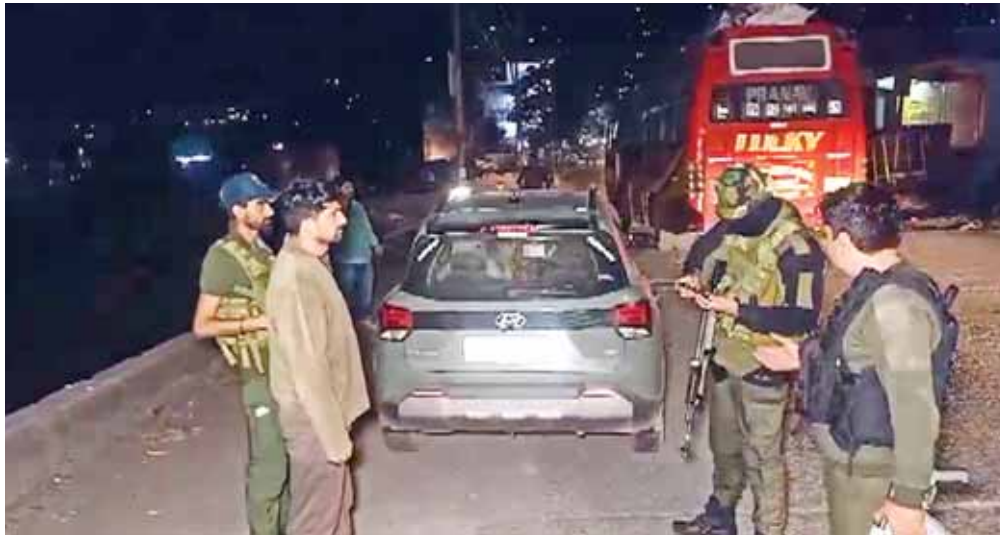
Security personnel stand guard after a militant attack on army vehicles, in Poonch district on Saturday. A search operation is going on in the woods amid inputs about the presence of the militants

In a stark reminder to the security personnel in February 2019 ahead of the Lok Sabha polls, an Indian Air Force (IAF) vehicle convoy was attacked in the similar fashion by terrorists in the Poonch district of Jammu and Kashmir late Saturday evening in which one soldier was killed and four seriously injured. The attack occurred near Shashidhar when the convoy vehicles were moving towards Sanai Top in the district's Surankote area.