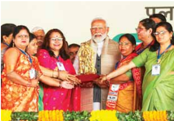
Prime Minister Narendra Modi being felicitated during a public meeting for Lok Sabha polls, in Palamu, on Saturday

The continuous jibe by Prime Minister Narendra Modi on Congress leader Rahul Gandhi by terming him "shehzada" (prince) reached a new zenith on Saturday with the latter's sibling and a general secretary in the grand old party, Priyanka Gandhi, calling the PM as "Shehanshah" (monarch). At the Lok Sabha poll rallies in Bihar and Jharkhand, Modi also used the term shehzada along with Rahul for the RJD leader and former Deputy Chief Minister Tejaswini Yadav. "There is a shehzada in Delhi (Rahul) and one in Patna (Tejaswini), both of whom think of the country as their fiefdom (jaagir)." While addressing a rally in Gujarat, Priyanka called Modi a "Shahanshah" who lives in a palace but is cut off from the public. It was her first response to the PM's 'shehzada' jibe for her brother Rahul. Asserting that India wants a strong leader at the helm to ensure security, Modi said his Government's surgical and air strikes had shaken Pakistan, and the neighbouring country's