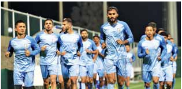
two matches of Group A. India are currently placed second in the group, with four points from as many matches. The top two teams in the group will qualify for round three of the FIFA World Cup Qualifiers and also book their berth at the AFC Asian Cup Saudi Arabia 2027.