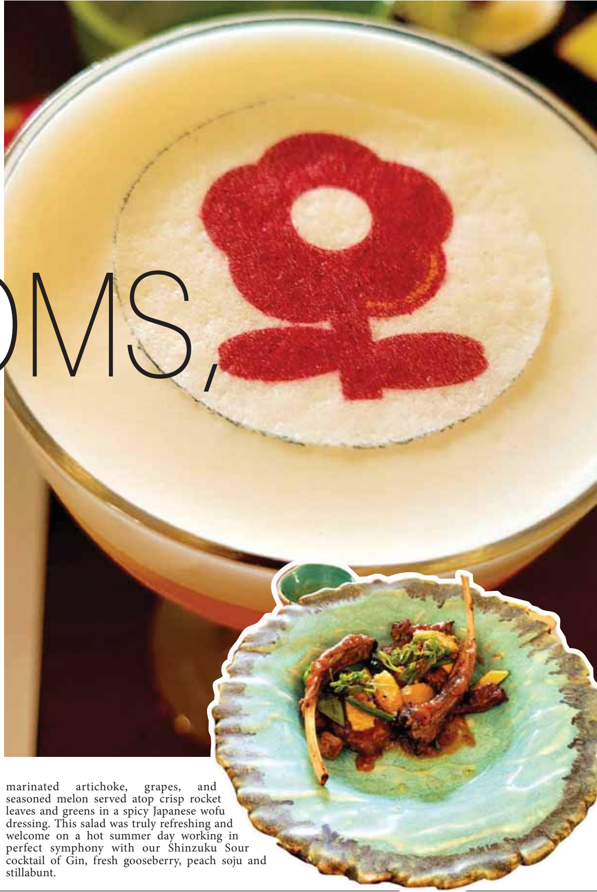
marinated artichoke, grapes, and seasoned melon served atop crisp rocket leaves and greens in a spicy Japanese wofu dressing. This salad was truly refreshing and welcome on a hot summer day working in perfect symphony with our Shinzuku Sour cocktail of Gin, fresh gooseberry, peach soju and stillabunt.

This week I had the great fortune to partake of the Hanami festival at one of Delhi's finest Japanese restaurants Guppy (part of the Olive Chain). This is cherry blossom season of spring in Japan, a time to mark the Hanami festival — a unique cultural tradition of viewing flowers in full bloom, an ancient ritual which serves as a Japanese reminder of the transience of nature, the blossoms a metaphor for life, draped in the immortal philosophy of hope and renewal. And no festival in the world is complete without its attendant share of feasts and festivities. Guppy, in an earnest attempt to keep this old Japanese heritage alive and robust in a faraway land from Japan, in the very heart of India in Delhi, laid out a sumptuous fare of what would typically be a part of a Hanami dining spread. Among the salads on offer — Artichoke & Melon, Acvocado, Beet & Edamame and Chicken, Avocado & Greens — my friend and I settled for the first one which was a refreshing mix of