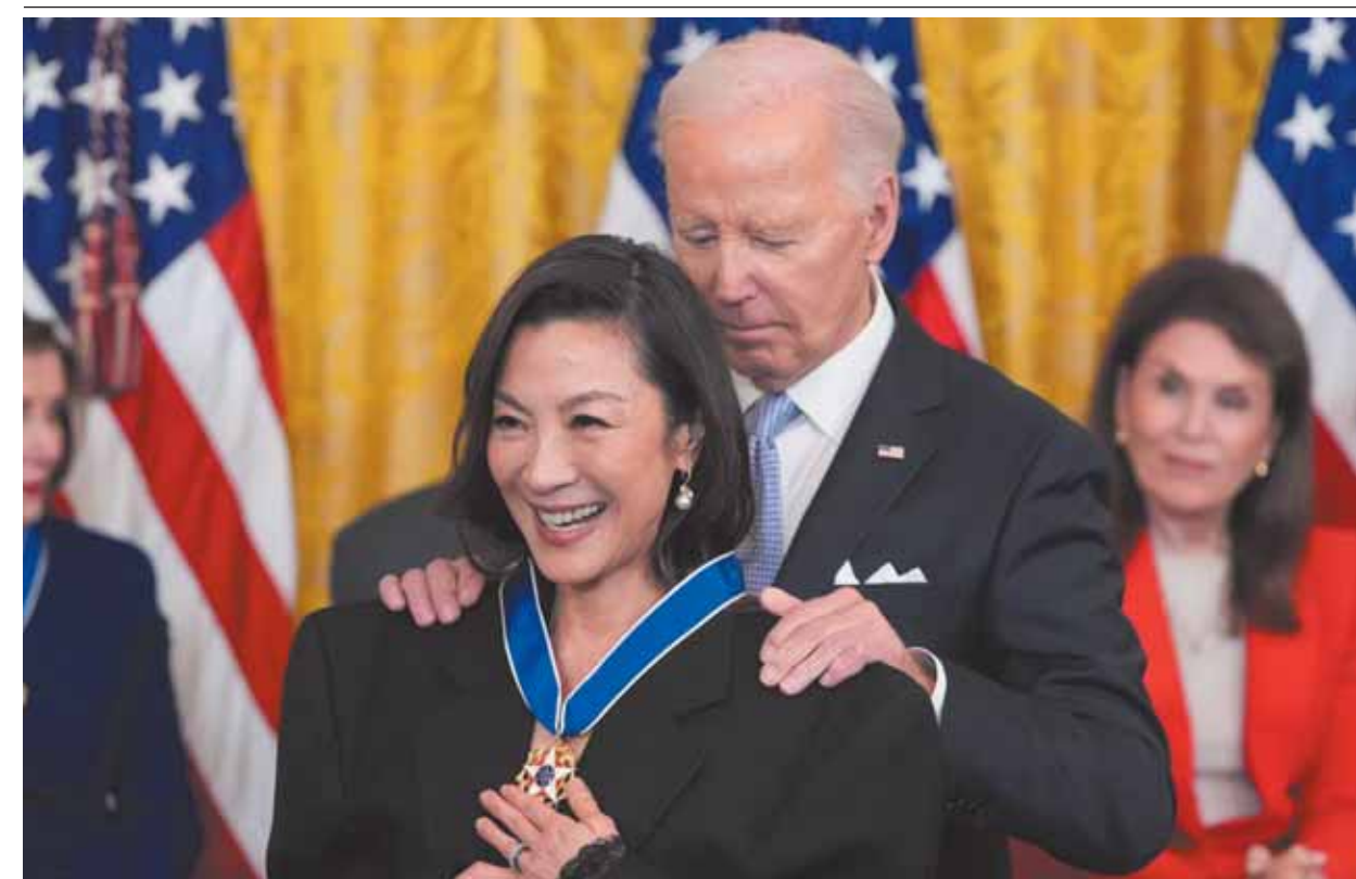
President Joe Biden awards the nation's highest civilian honor, the Presidential Medal of Freedom, to Michelle Yeoh during a ceremony in the East Room of the White House, on Friday in Washington.

Palestinian prisoners in Israeli jails. Hamas has said it will send a delegation to Cairo in the coming days for further discussions on the offer, though it has not specified when. Israel, and its allies, have sought to increase pressure on Hamas on the hostage negotiation. Signaling that Israel continues to move forward with its planning for a Rafah operation could be a tactic to nudge the militants to finalise the deal. Netanyahu said earlier this week that Israeli forces would enter Rafah, which Israel says is Hamas' last stronghold, regardless of whether a truce-for-hostages deal is struck. His comments appeared to be meant to appease his nationalist governing partners, and it was not clear whether they would have any bearing on any emerging deal with Hamas. US Secretary of State Antony Blinken visited the region, including Israel, this week and called the latest proposal "extraordinarily generous" and said "the time to act is now."