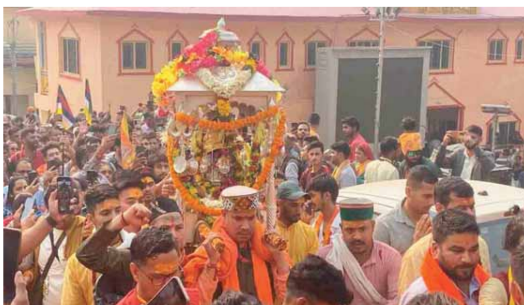
Devotees carry the Panch Mukhi Doli of lord Kedarnath from Guptkashi towards Fata on Tuesday

istered to visit Kedarnath while 6,38,725 had registered to visit Badrinath, 3,81,267 to visit Gangotri and 3,35,413 to visit the Yamunotri temple. Further, 43,980 people have registered so far to visit the Hemkund Sahib Gurudwara. Out of the total number of people who have registered so far, 16,54,972 have registered on the web portal, 2,92,753 have registered on the mobile phone application and 1,92,780 have registered through WhatsApp, officials informed. It is pertinent to mention here that more than 56 lakh people had visited the Char Dham during 2023. The State government is expecting that last year's record will be broken by the number of people who undertake the Char Dham Yatra this year.