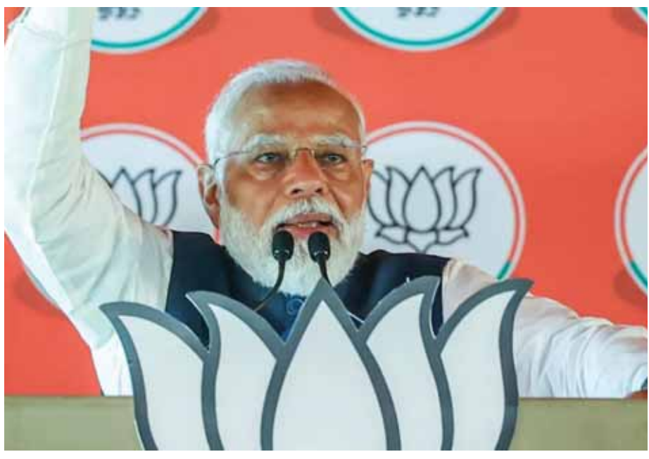
The PM said he wants 400 Lok Sabha seats to prevent Congress from "dacoity" of the OBC quota to benefit its vote bank. "We have also used these 400

spreading rumours that if he gets 400 Lok Sabha seats, he will change the Constitution. It seems as if the Congress people's intelligence is focussed on their vote bank, he said. "It is important for the country's people to know the BJP-led NDA already has 400-plus seats in Parliament. We used this number to scrap Article 370 (which provided special status to Jammu and Kashmir)," the PM said. "Modi wants 400 seats so that the Congress won't bring back Article 370 to spoil the game, Modi wants 400 seats so that the Congress won't put a Babri lock on the Ram temple in Ayodhya," he said. The PM said that about 14 days back, he challenged the Congress to give in writing to the country's 140 crore people that it will not give reservation on the basis of religion. "Secondly, I asked them to give in writing that they will never snatch reservation being given to SCs, STs and OBC and thirdly, to give in writing that they will never give reservation