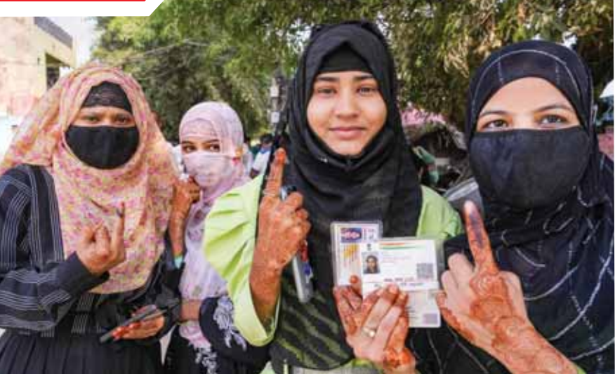
Women show their ink-marked finger after casting votes for the 3rd phase of Lok Sabha elections, in Bareilly