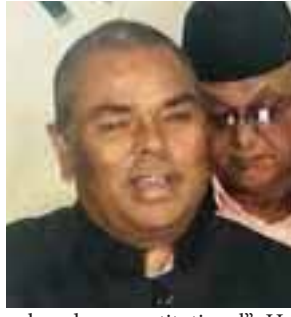
Upendra Yadav, Deputy Prime Minister and Chairperson of the Janata Samajbadi Party-Nepal (JSP-N).

Deputy Prime Minister and Chairperson of the Janata Samajbadi Party-Nepal (JSP-N) Upendra Yadav on Wednesday said that he will approach the court against the "unconstitutional move" to divide his party when he was abroad as he insisted that the split would not affect the stability of the coalition government.