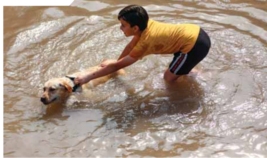
A child bathes his dog in a waterbody on a hot summer day, in Jammu