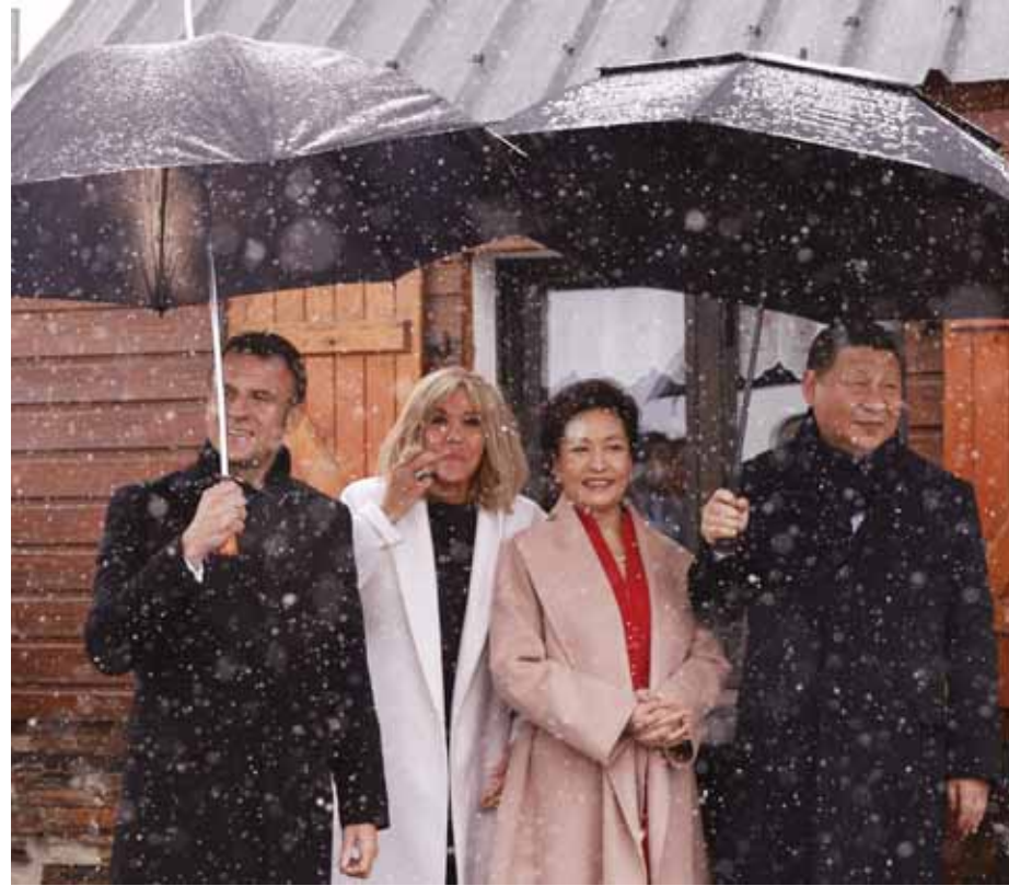
French President Emmanuel Macron and his wife Brigitte Macron, Chinese President Xi Jinping, and his wife Peng Liyuan watch folklore dancers on Tuesday at the Tourmalet pass, in the Pyrenees mountains.

Beijing (PTI): China's former defence minister Gen. Wei Fenghe whose prolonged absence from the public view sparked speculation about his fate has resurfaced, suggesting that he was politically safe, a media report said on Wednesday.